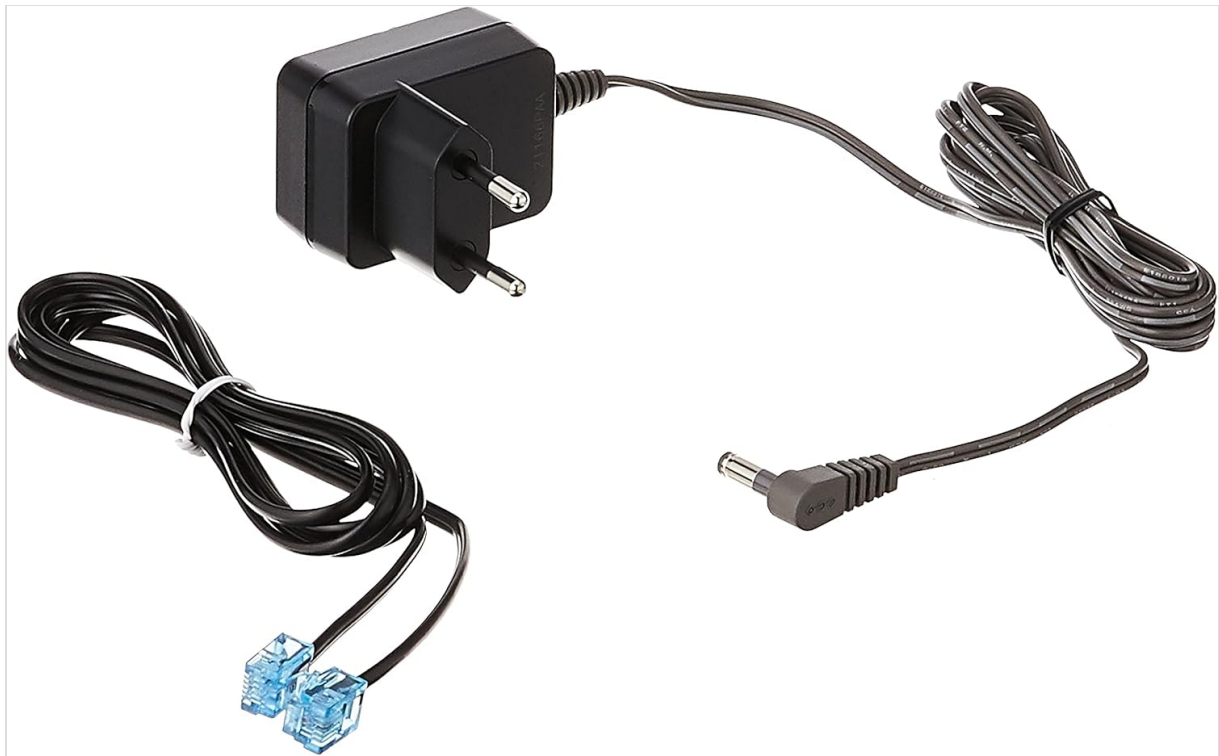
Image: AC Power Adapter and Telephone Line Cord. These are essential for connecting the base unit to power and the telephone line.