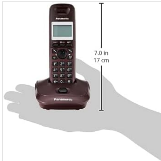
Image: The cordless phone on its base unit, illustrating its approximate dimensions (7.0 inches / 17 cm height). This provides a visual reference for the product's size.