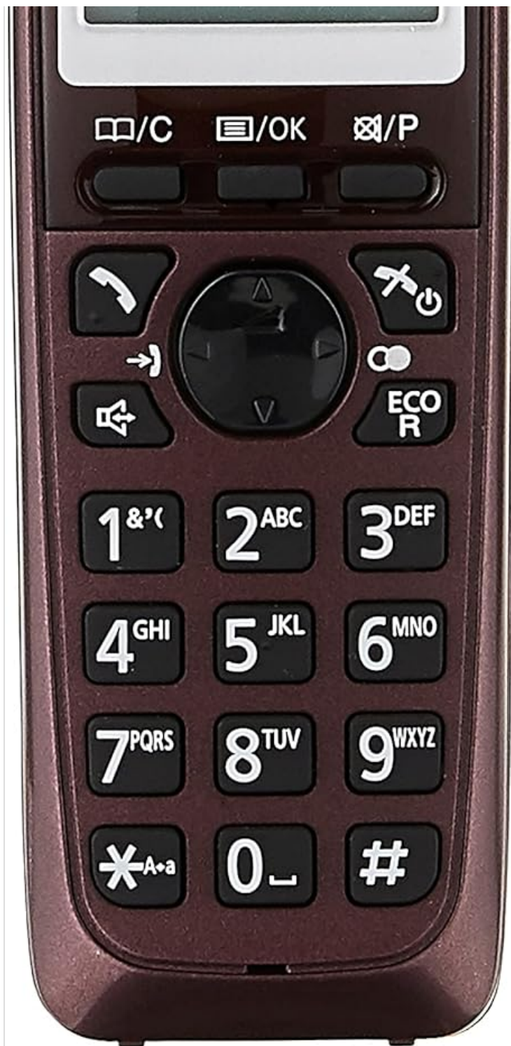
Image: Close-up view of the cordless handset, showing the keypad, screen, and navigation buttons. This highlights the user interface for making and receiving calls, including the Talk, End Call, and Speakerphone buttons.