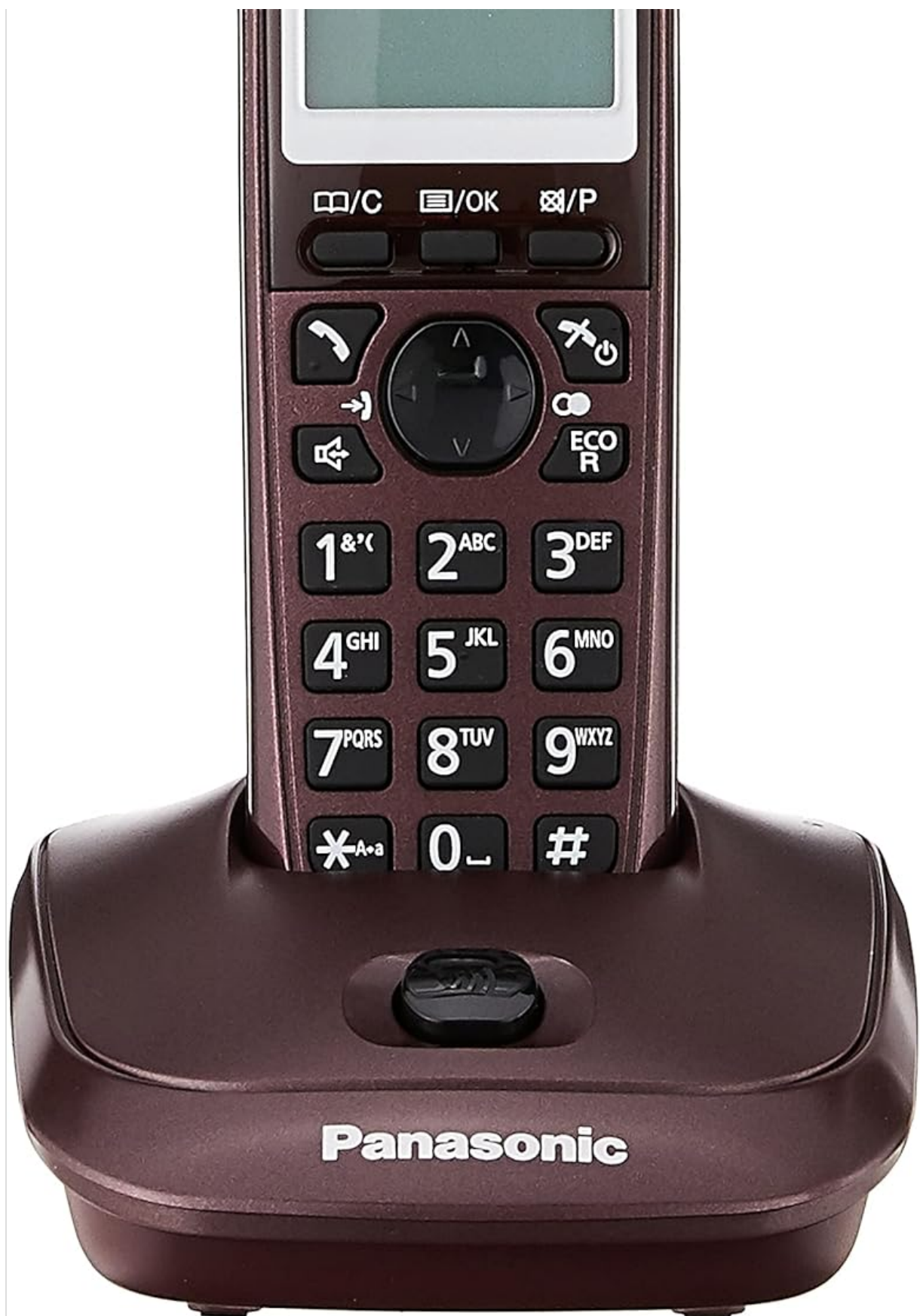
Image: Front view of the cordless handset placed on its base unit. This shows the phone in its charging position.