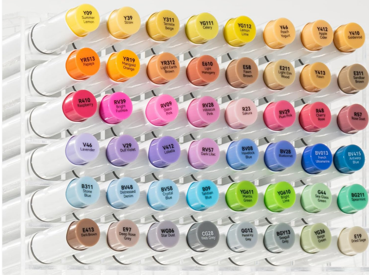
Image: Close-up of Ohuhu markers with color-coded caps, showing the color name and code for easy identification.