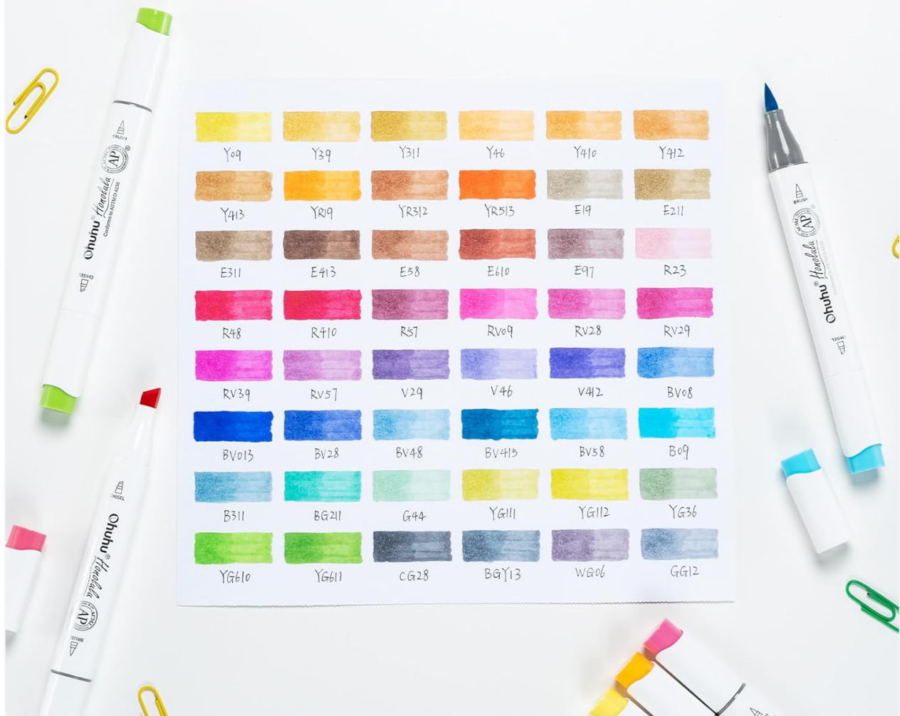
Image: A color swatch chart displaying the 48 mid-tone colors of Ohuhu markers.