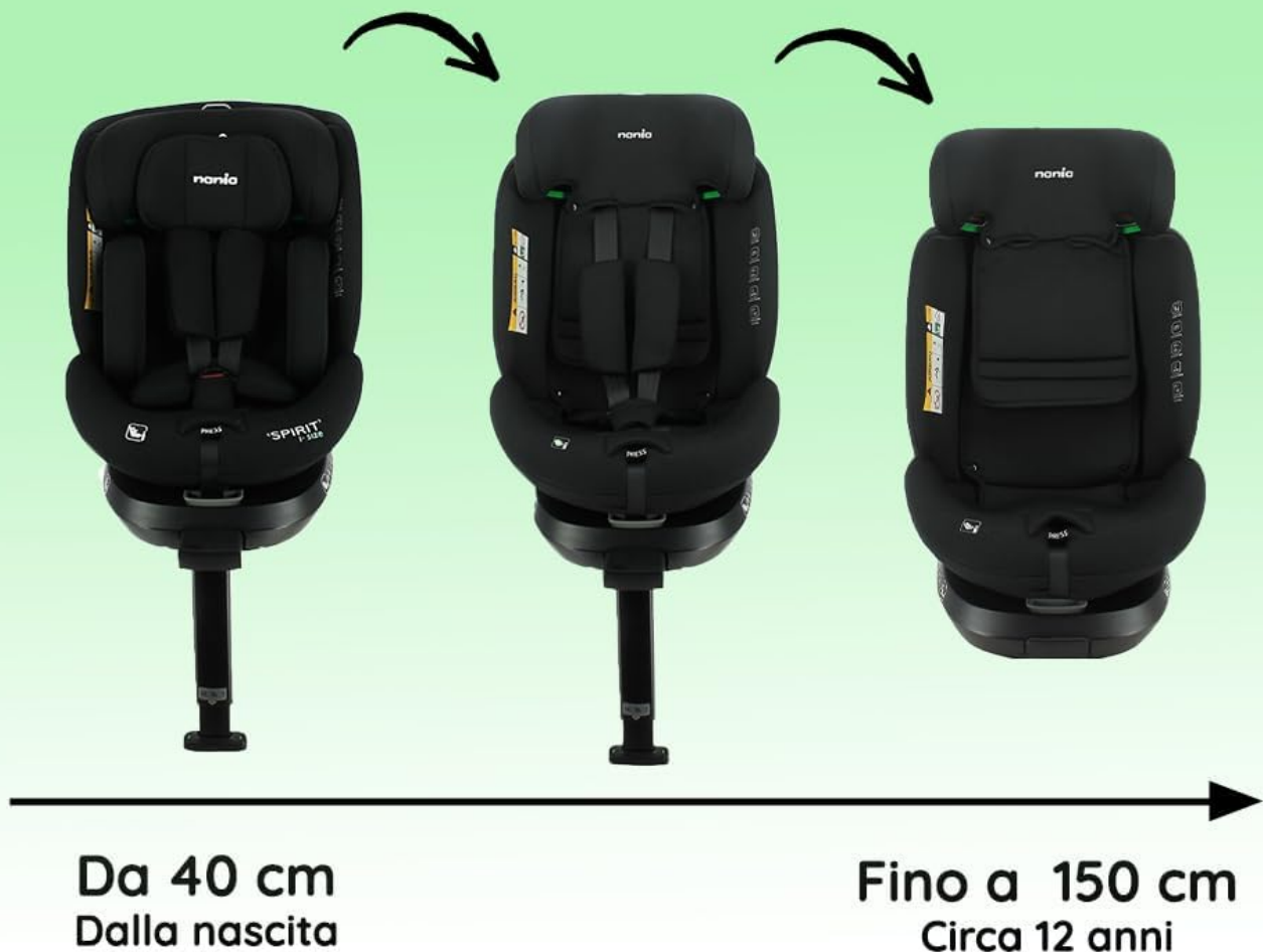
Image: Side view of the Nania SPIRIT car seat with the adjustable support leg extended downwards.