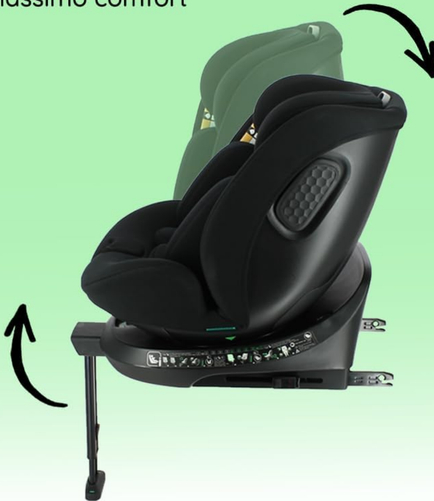
Image: Side view of the Nania SPIRIT car seat with ISOFIX connectors extended, ready for installation.