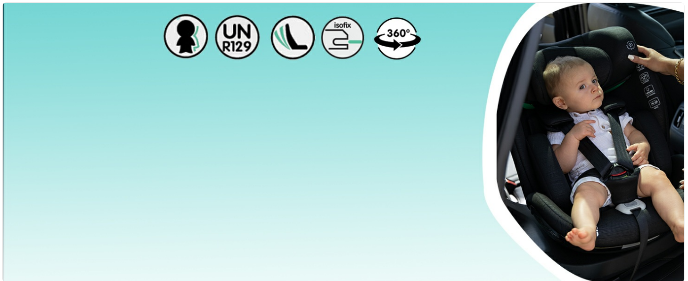
Image: Safety icons indicating i-Size R129, ISOFIX, and 360° rotation, with a partial view of car seat installation.