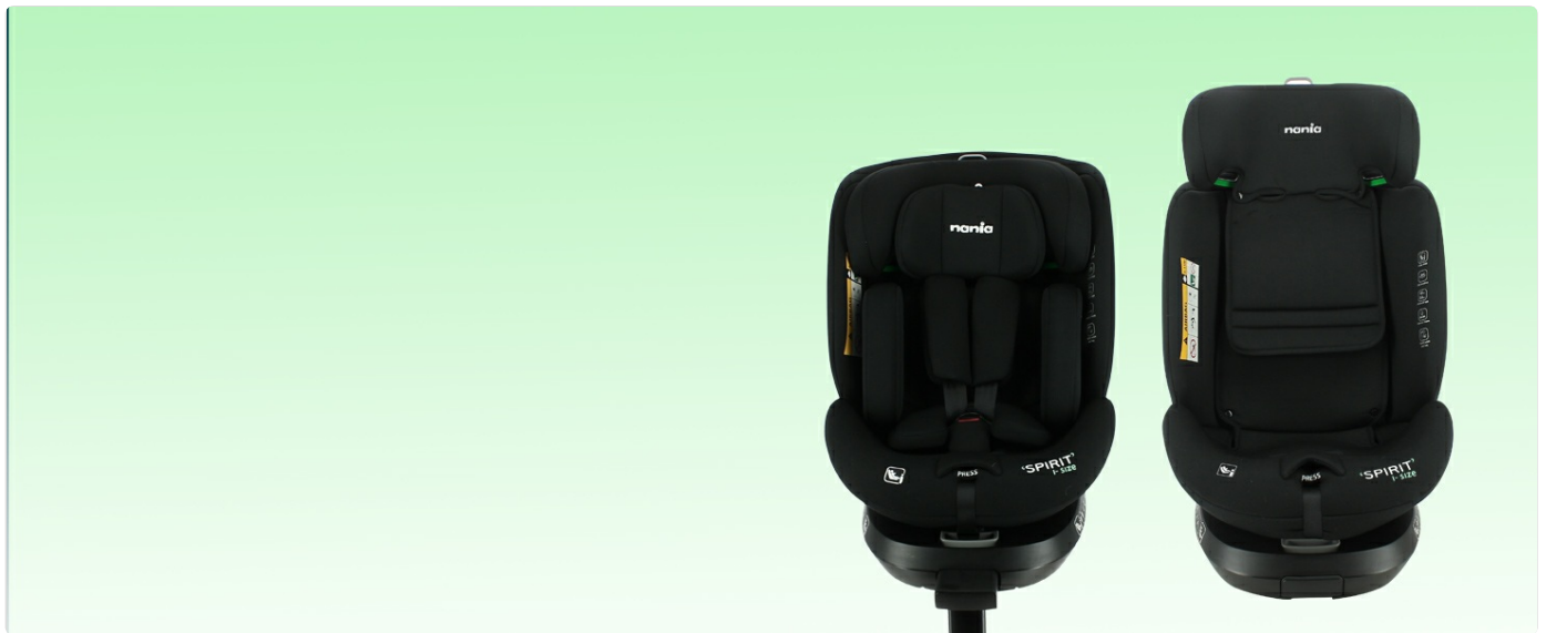
Image: Two Nania SPIRIT car seats, one configured for rear-facing (40-105 cm) and one for forward-facing (from 76 cm).