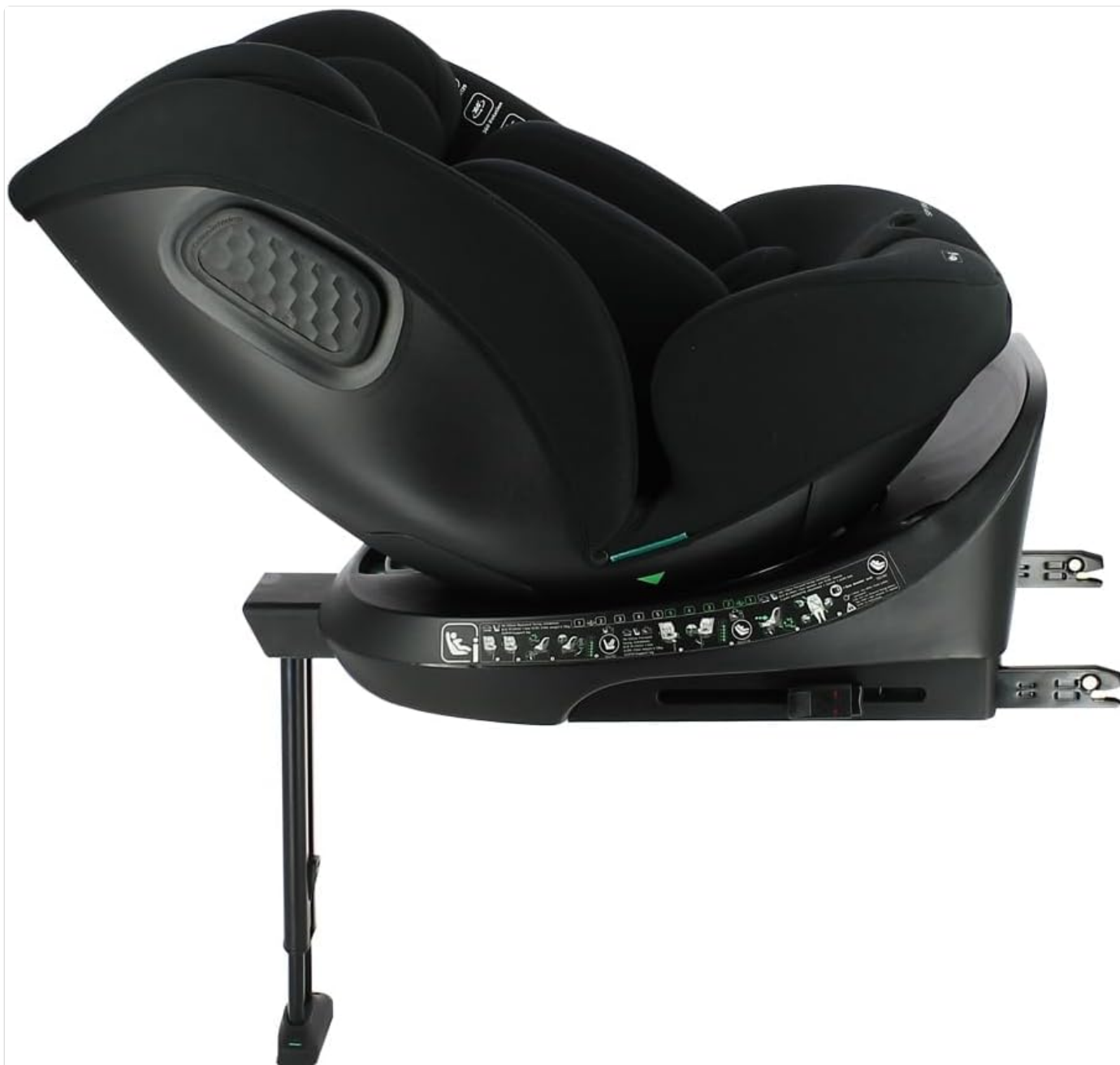
Image: Side view of the Nania SPIRIT car seat demonstrating a reclined position.