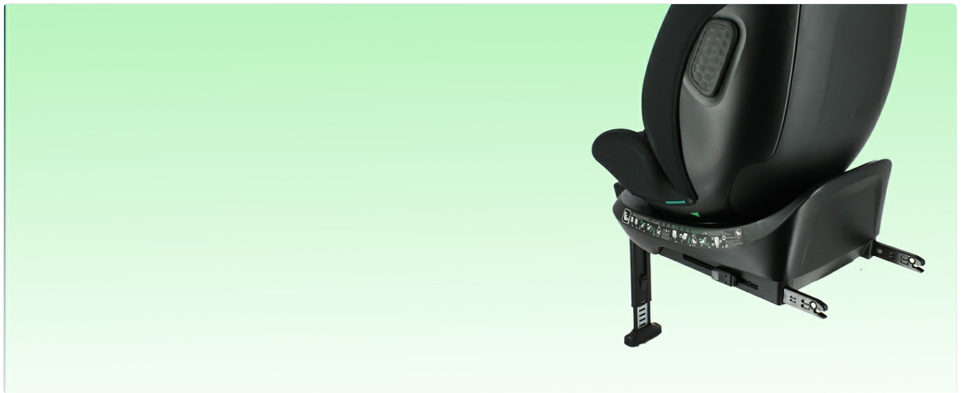
Image: Close-up of the Nania SPIRIT car seat's adjustable headrest and integrated side supports.