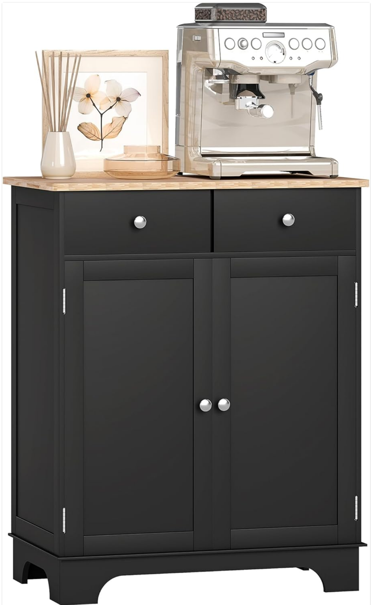
Figure 1: Front view of the HOMCOM Sideboard Storage Cabinet.