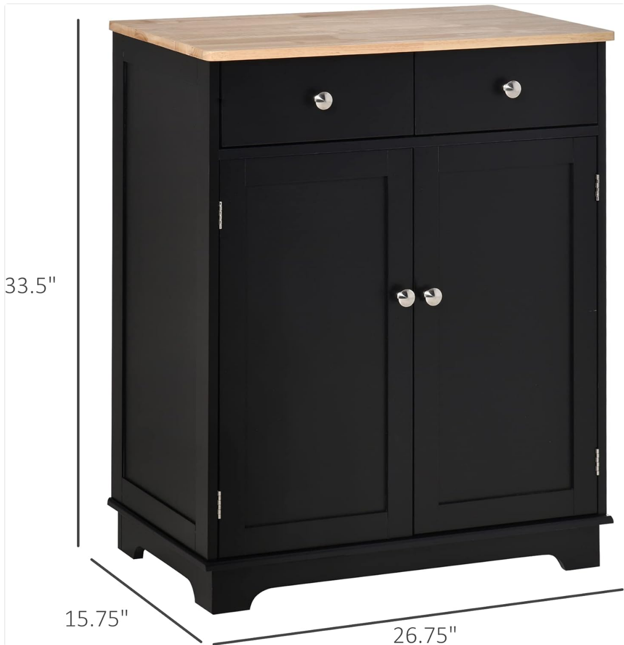
Figure 6: Key dimensions of the cabinet.