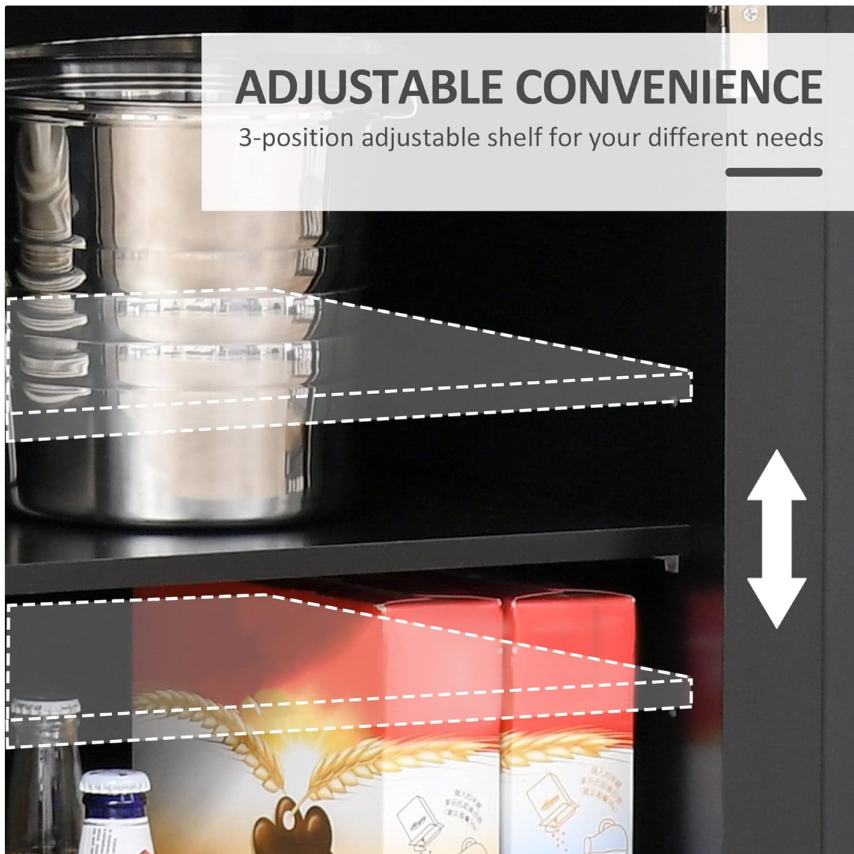
Figure 4: The adjustable shelf can be positioned at three different heights.