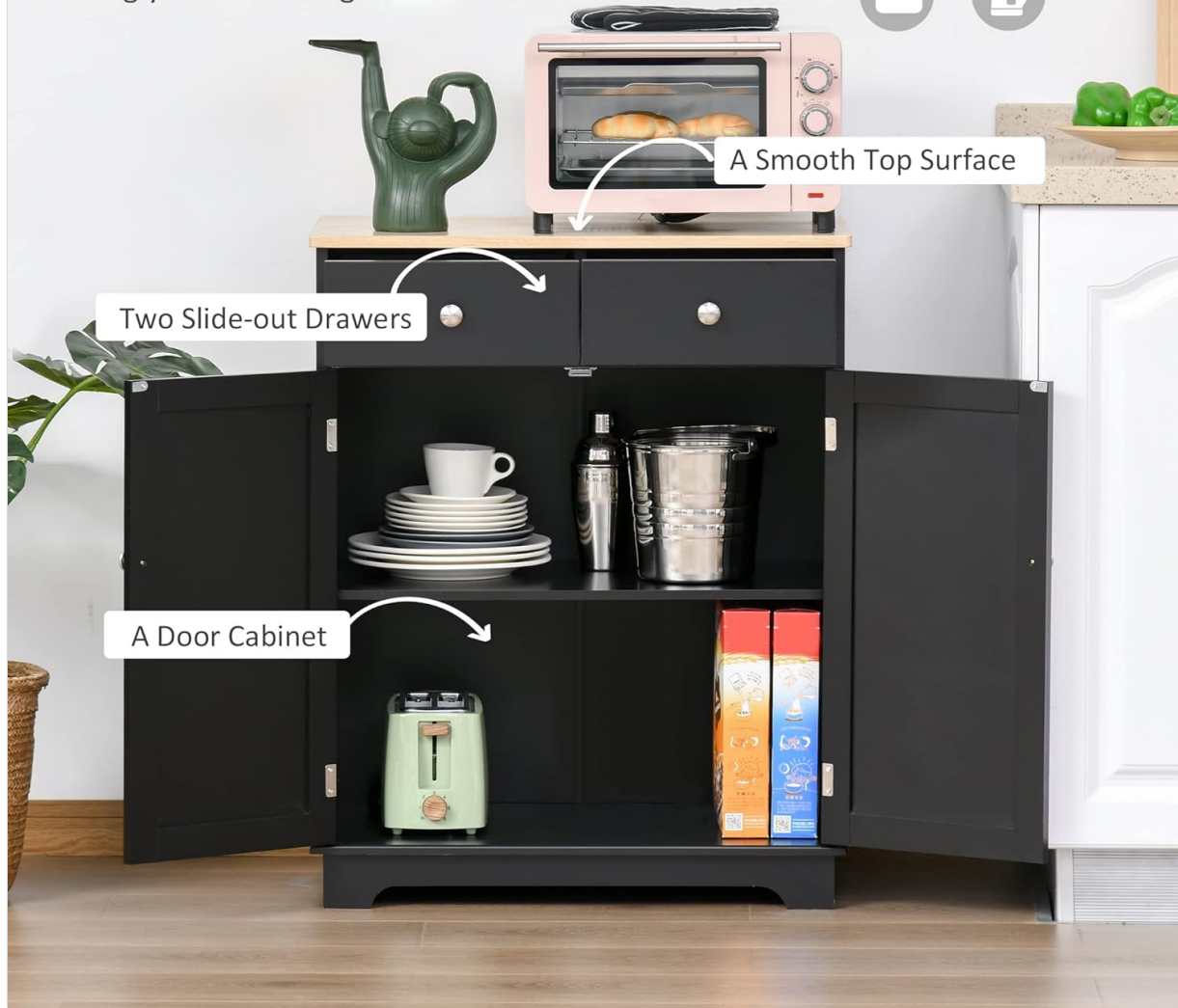
Figure 5: Ample storage space behind the cabinet doors.