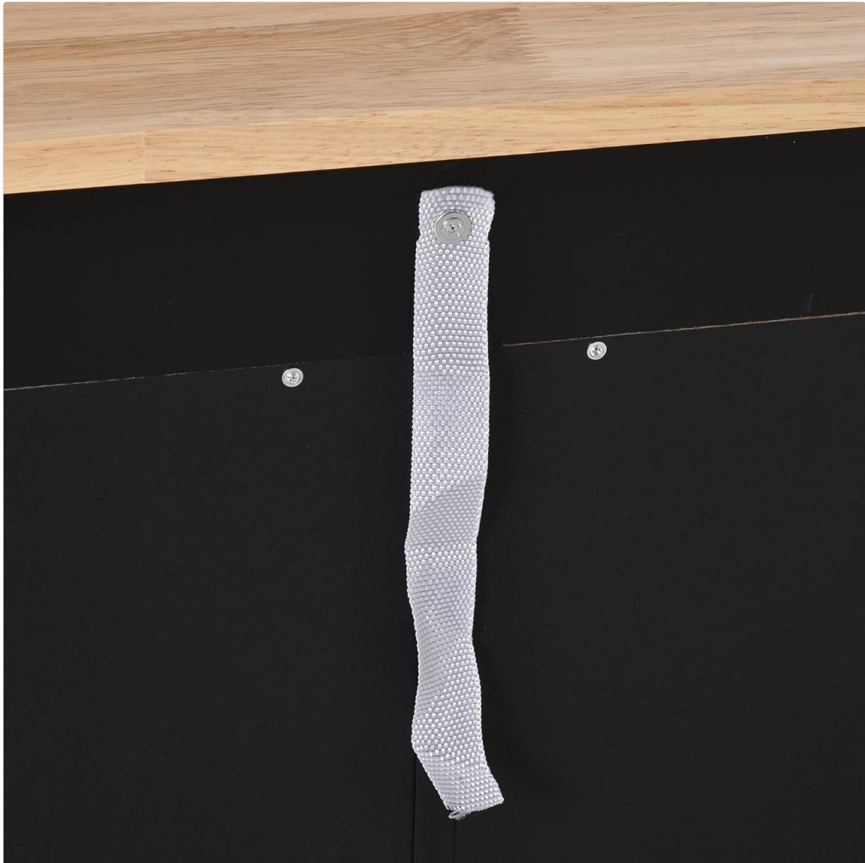
Figure 2: Anti-tipping strap for securing the cabinet to a wall.