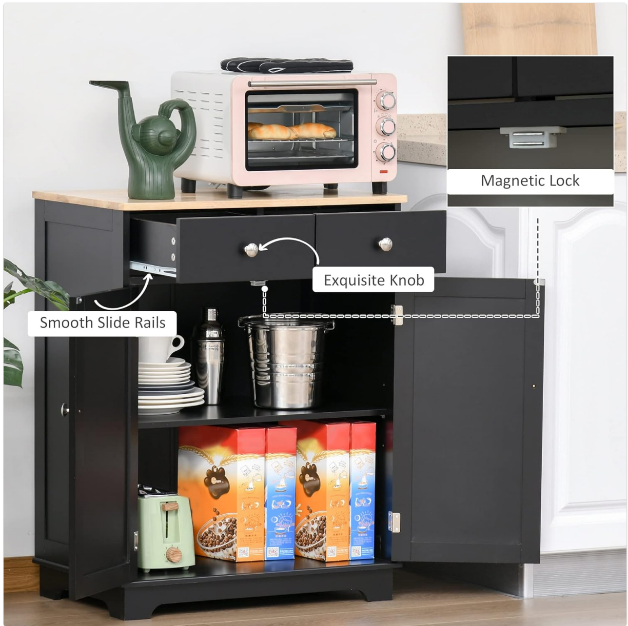
Figure 3: Detail of smooth slide rails for drawers and magnetic door lock.