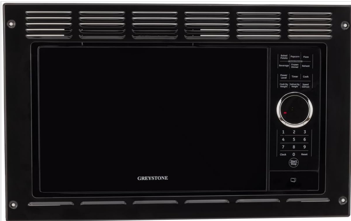
Image: Front view of the RecPro RV Microwave with the included trim kit, showcasing its sleek black finish.

Video: RecPro Brand Overview. This video provides a general overview of the RecPro brand and its commitment to RV products.