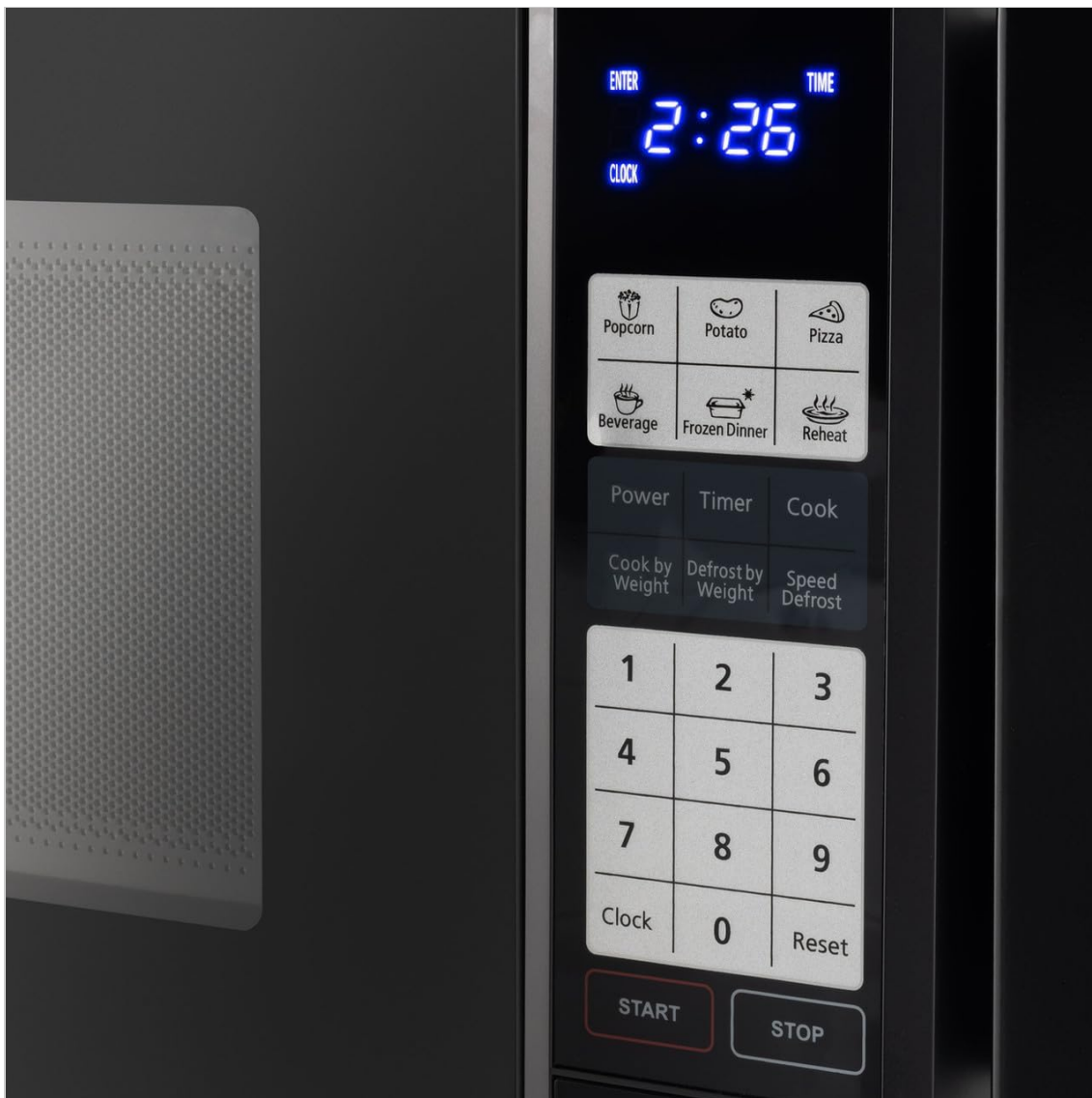
Image: A close-up view of the microwave's control panel, highlighting the digital display, number pad, and various function buttons.