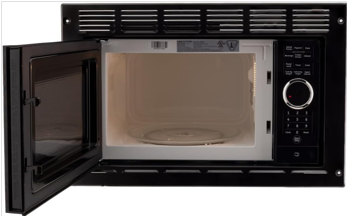
Image: The RecPro RV Microwave with its door open, revealing the spacious 0.9 cubic foot interior and glass turntable.

To activate the Child Safety Lock, press and hold the 'Stop' button for 3 seconds. The display will indicate that the lock is active. To deactivate, press and hold the 'Stop' button again for 3 seconds.