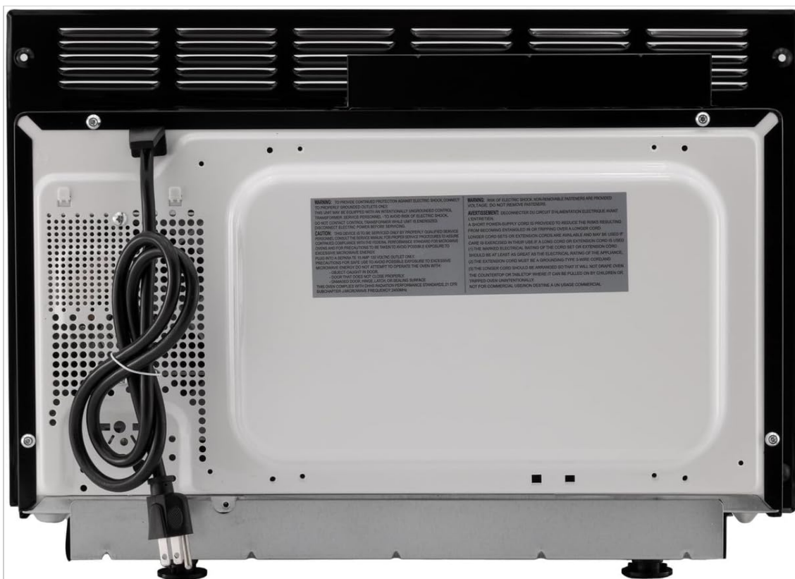
Image: Rear view of the RecPro RV Microwave, showing the power cord and important warning labels regarding electrical safety and servicing.