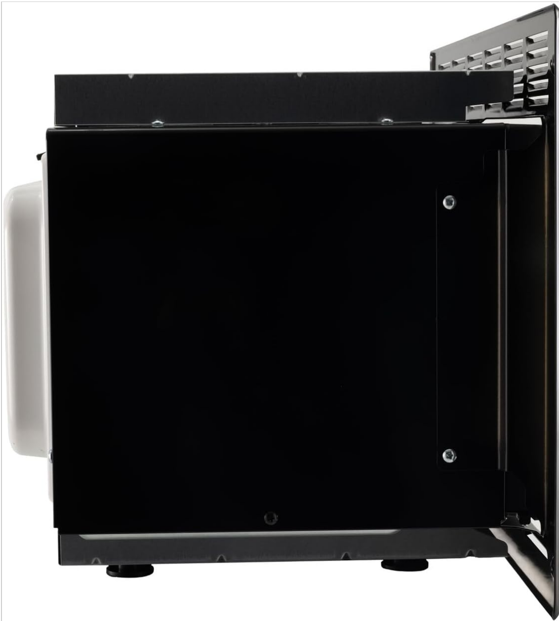
Image: Side view of the RecPro RV Microwave, providing a perspective on its depth and design for installation planning.