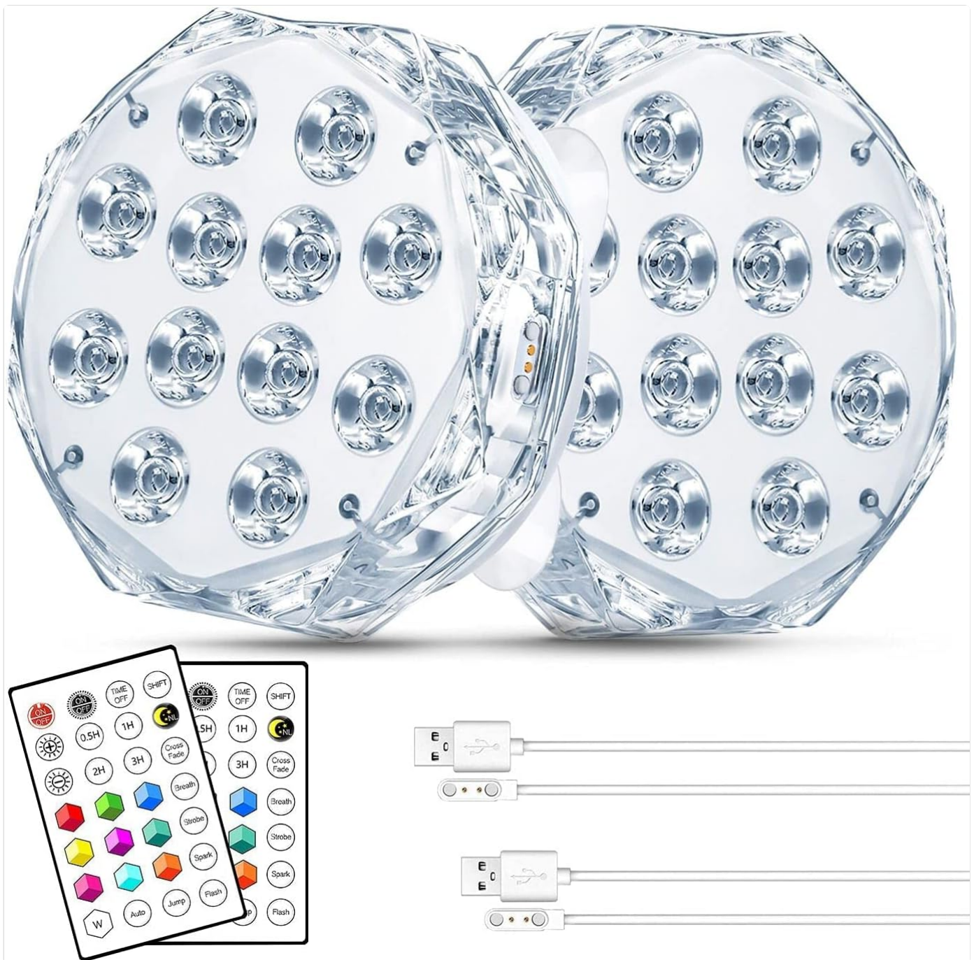
Figure 1: Idealife 4-inch 20 LED Submersible Light (2-pack) with remote controls and magnetic charging cables.