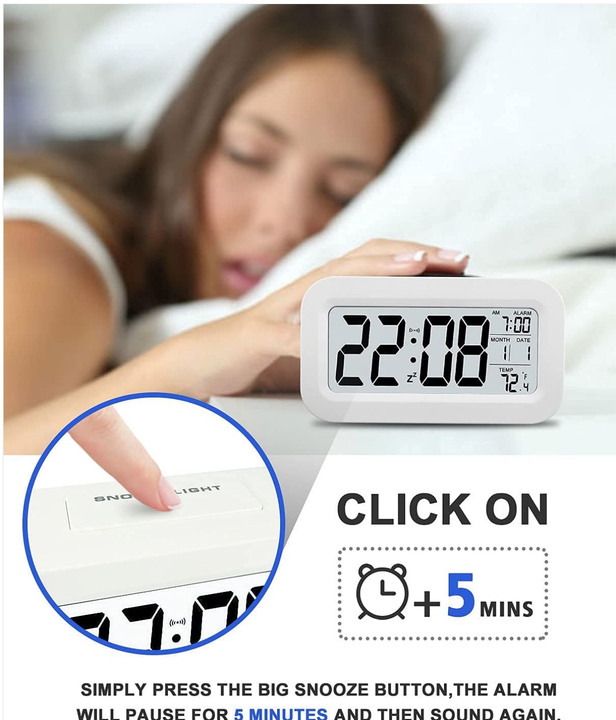
Figure 4.2.1: A hand pressing the 'SNOOZE/LIGHT' button on the top of the alarm clock to activate the snooze function.

To turn off the alarm completely, slide the AL ON/AL OFF switch to AL OFF .