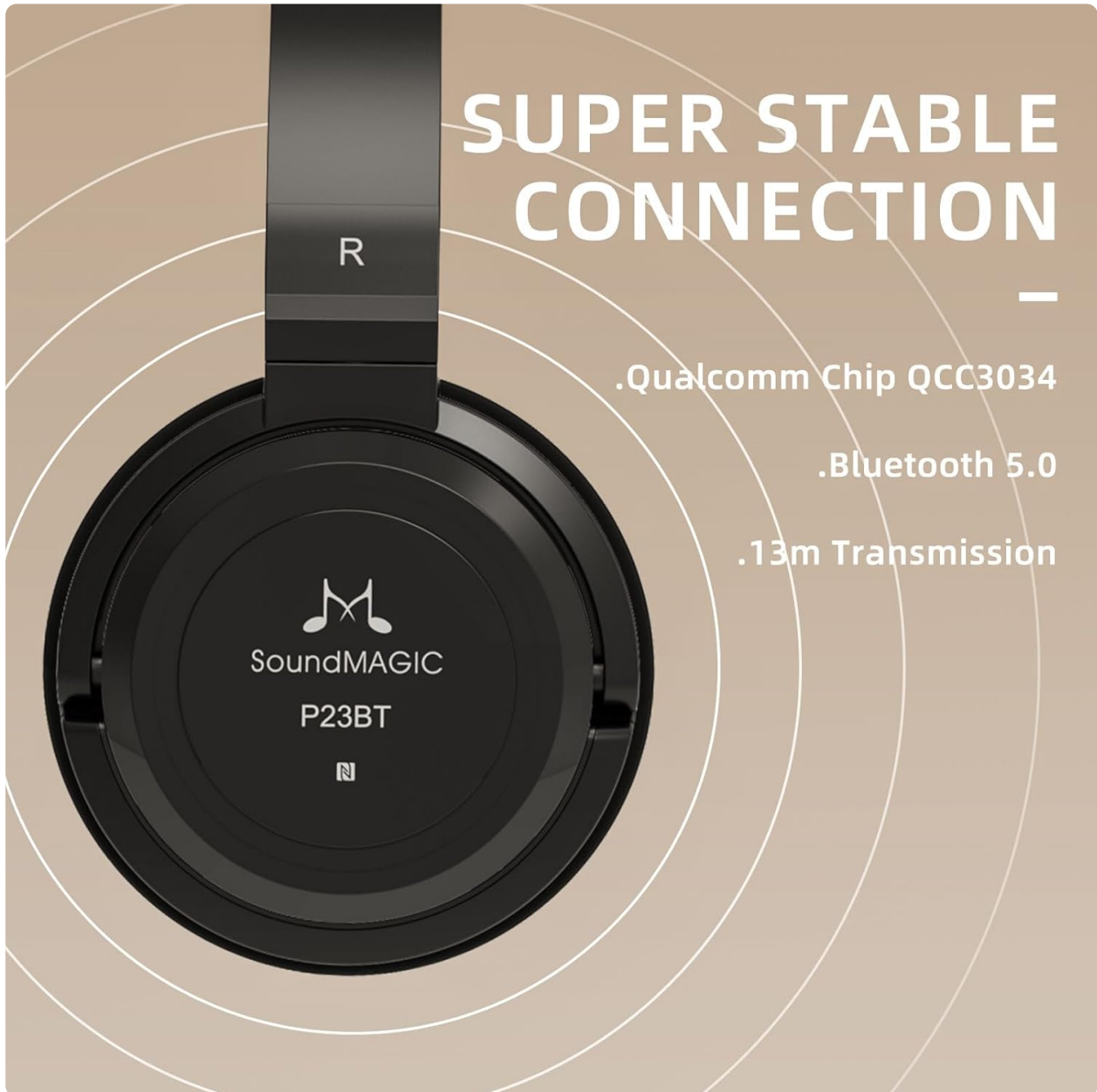
Image: Super Stable Connection features with Qualcomm Chip QCC3034 and Bluetooth 5.0.

The headphones support Bluetooth 5.0 for a stable and fast connection, and will automatically reconnect to the last paired device when powered on.