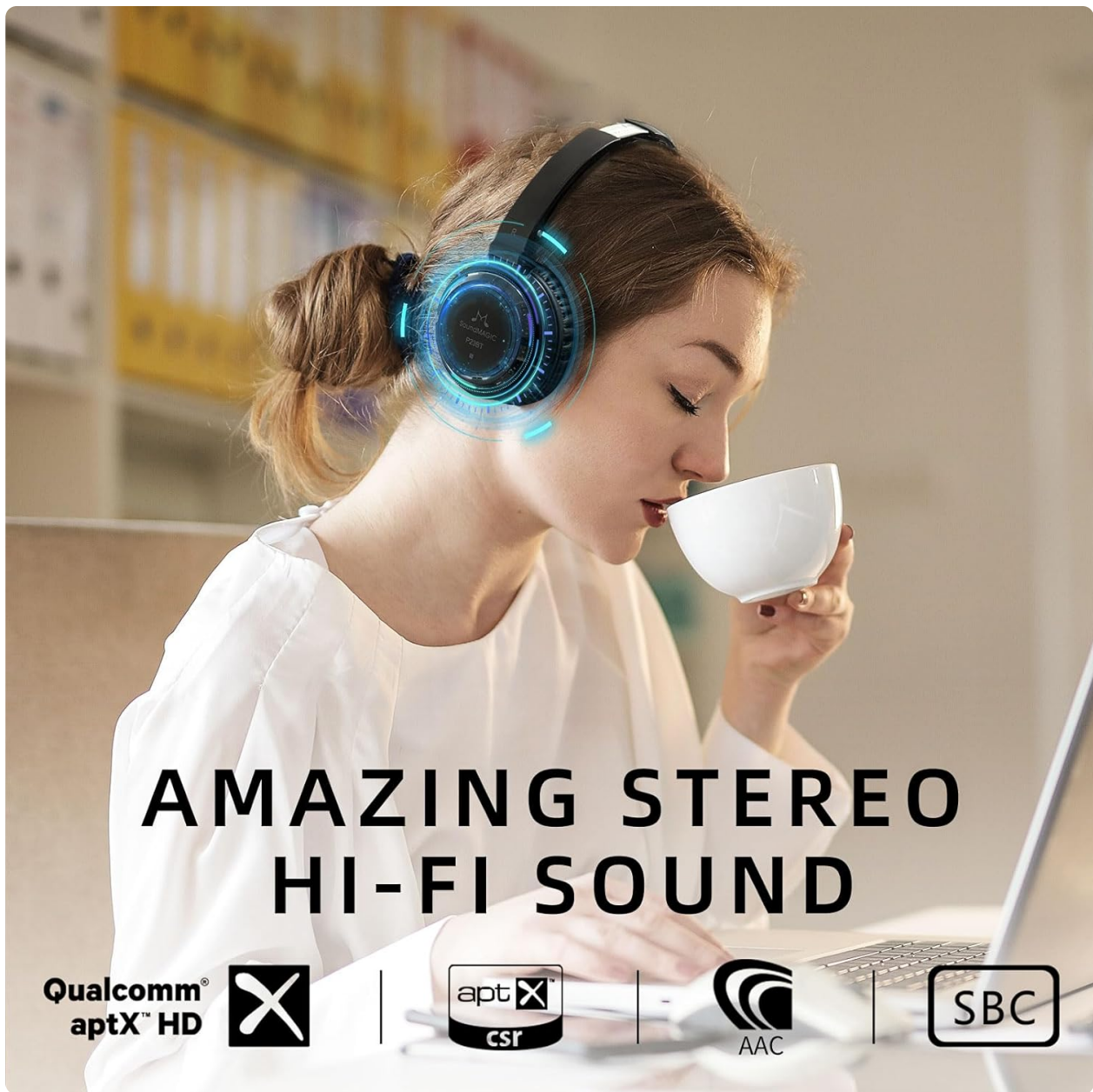
Image: SoundMAGIC P23BT headphones delivering amazing stereo Hi-Fi sound.