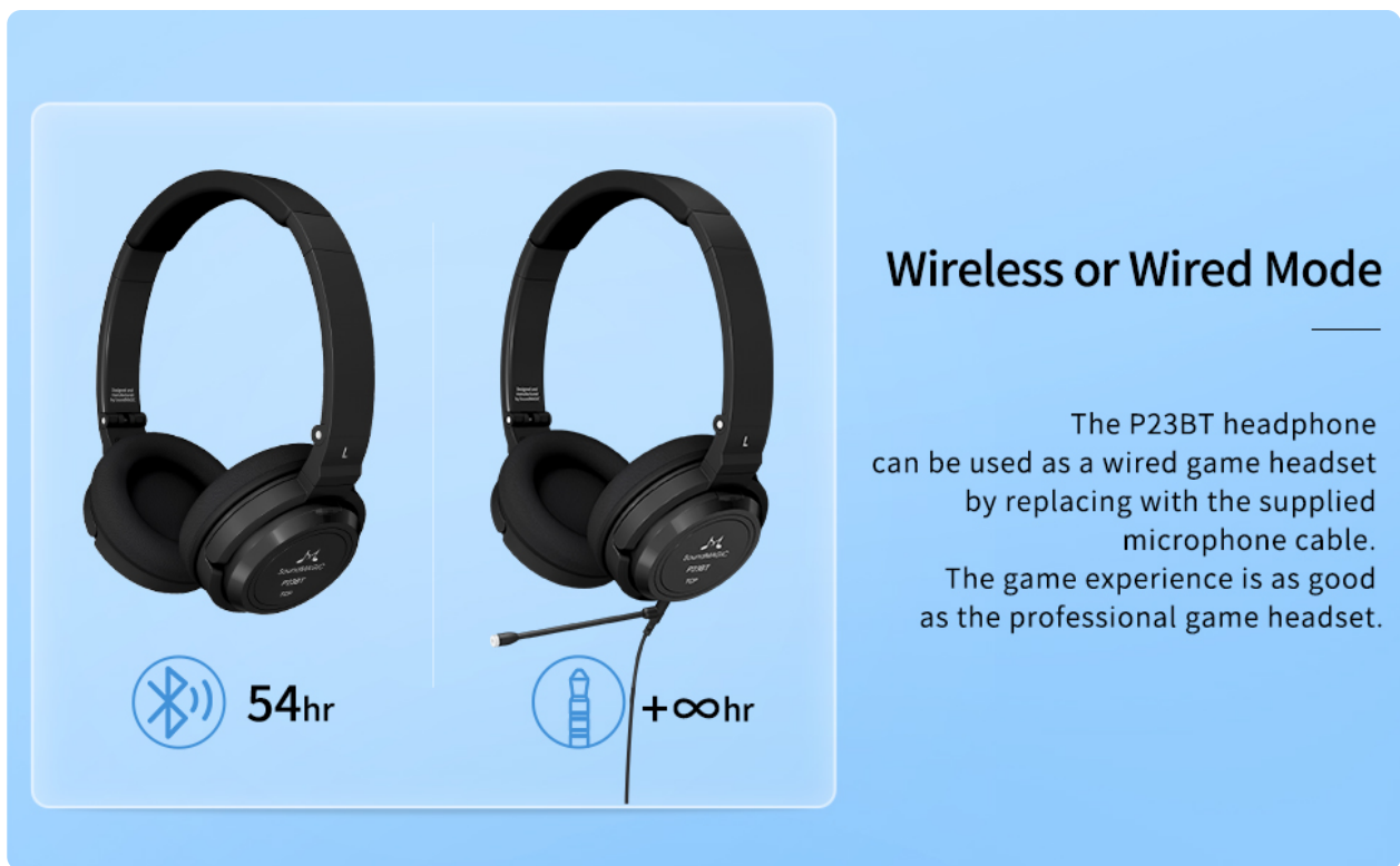
Image: SoundMAGIC P23BT headphones in wireless and wired modes.