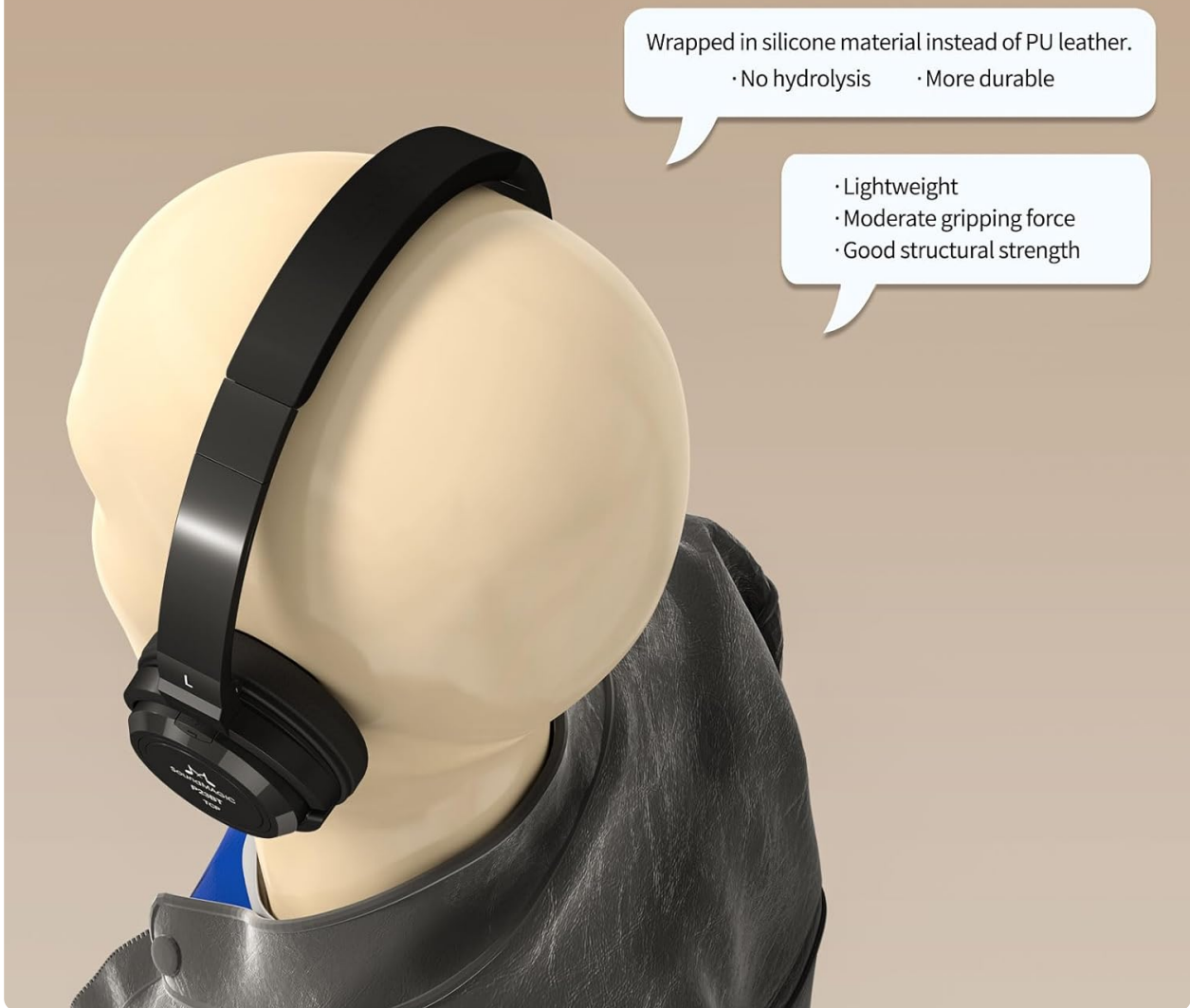
Image: SoundMAGIC P23BT headphones highlighting comfortable and durable design.