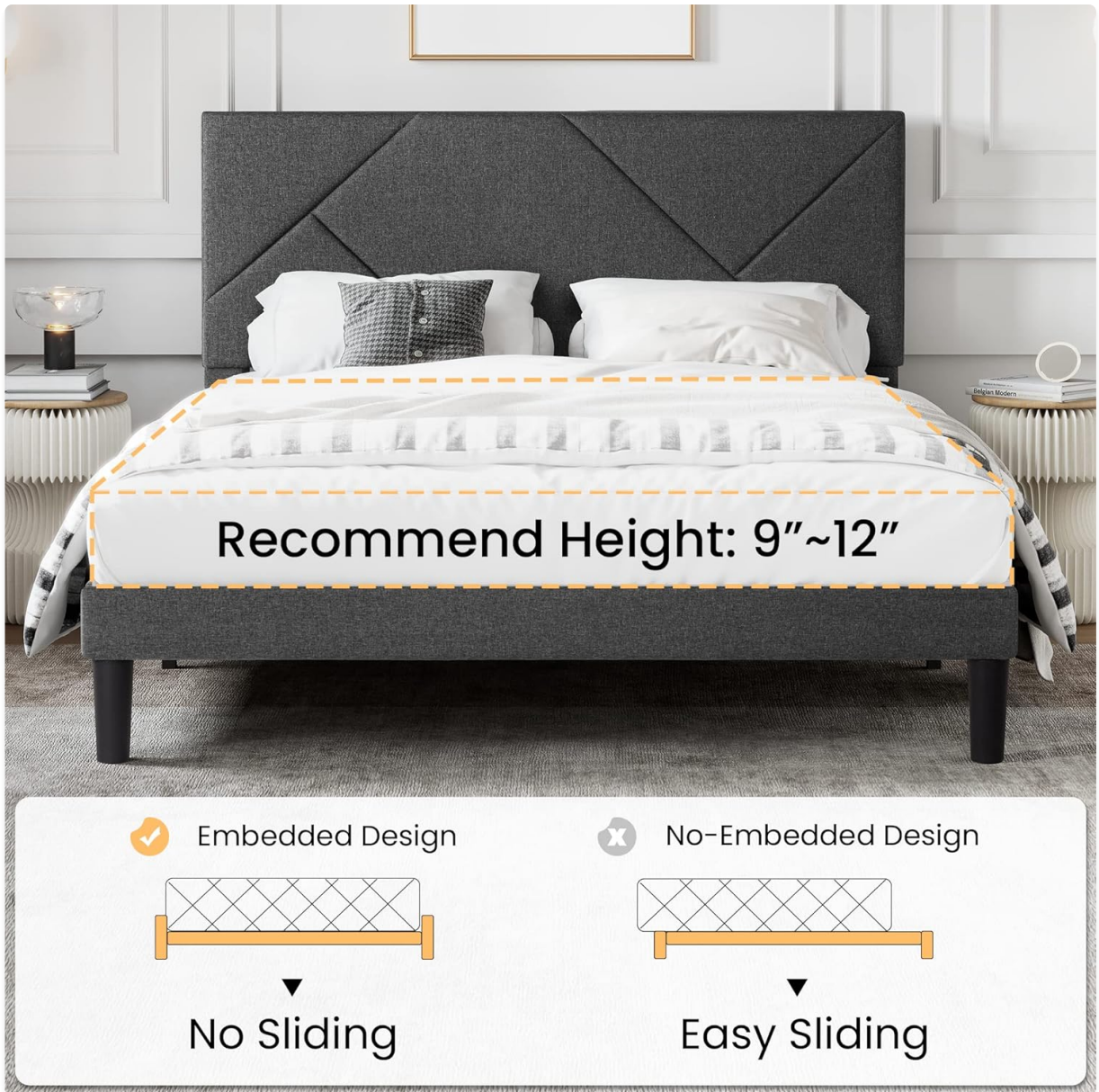
Image: Visual guide for mattress placement, showing the embedded design for stability.