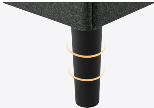
Image: Detailed view of the bed frame's construction, highlighting the Velcro slat attachment and robust leg design.

Upgrade metal leg support structure provides a strong foundation.