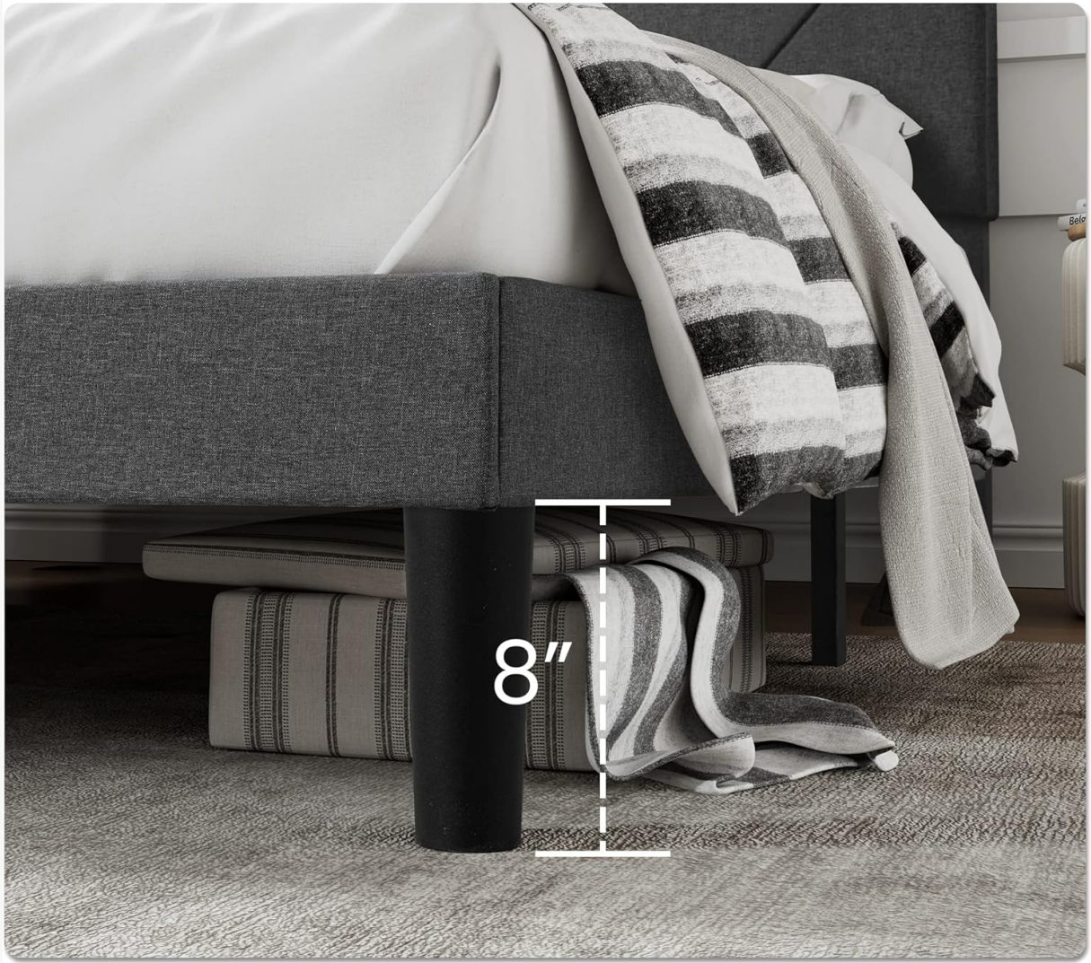
Image: The under-bed space, indicating 8 inches of clearance for storage or cleaning.

Ample space for storing and easy cleaning.