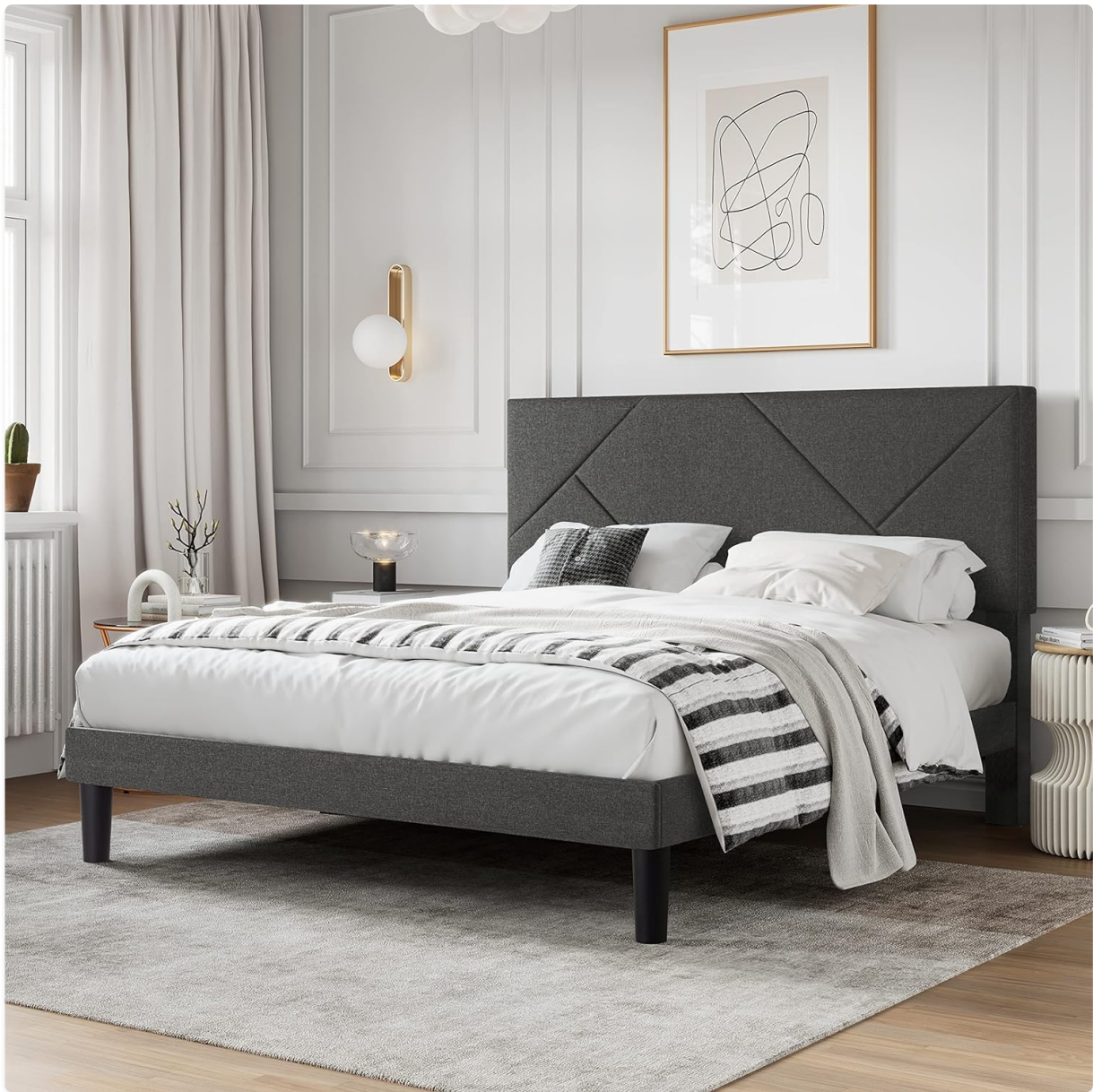
Image: The SHA CERLIN Full Size Upholstered Bed Frame with Geometric Headboard, showcasing its dark grey fabric and modern design.