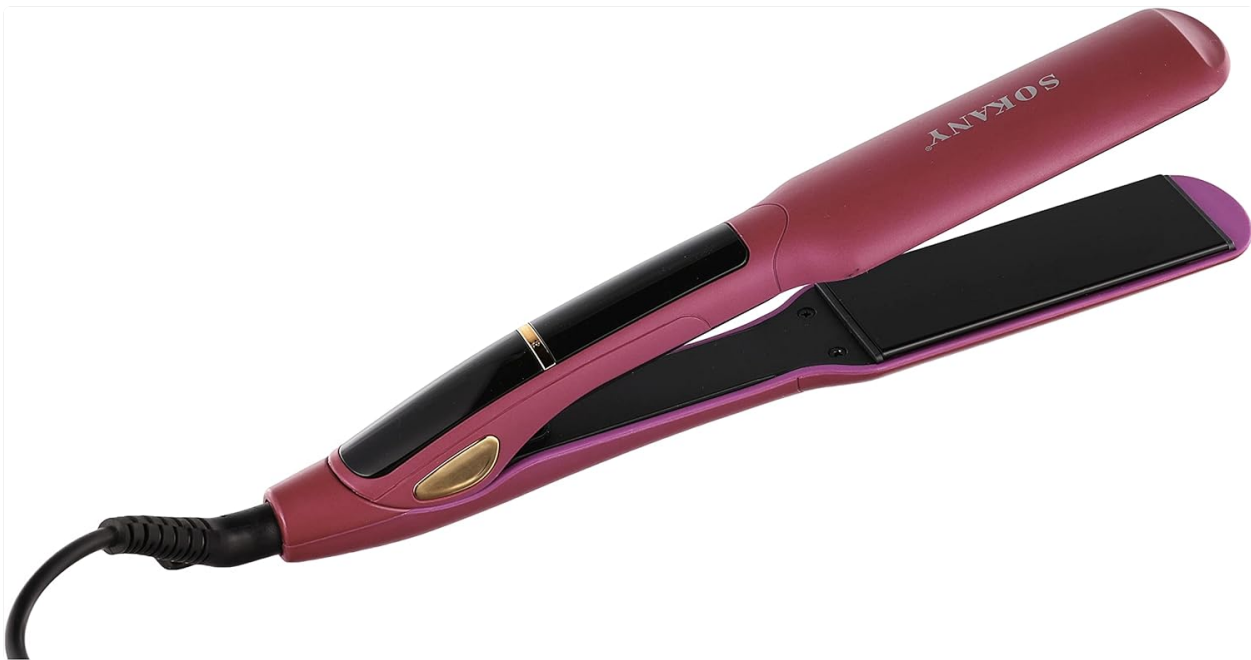
Image 2.2: The Sokany HS-030 Hair Straightener with its heating plates open, illustrating the styling surface and plate release button.