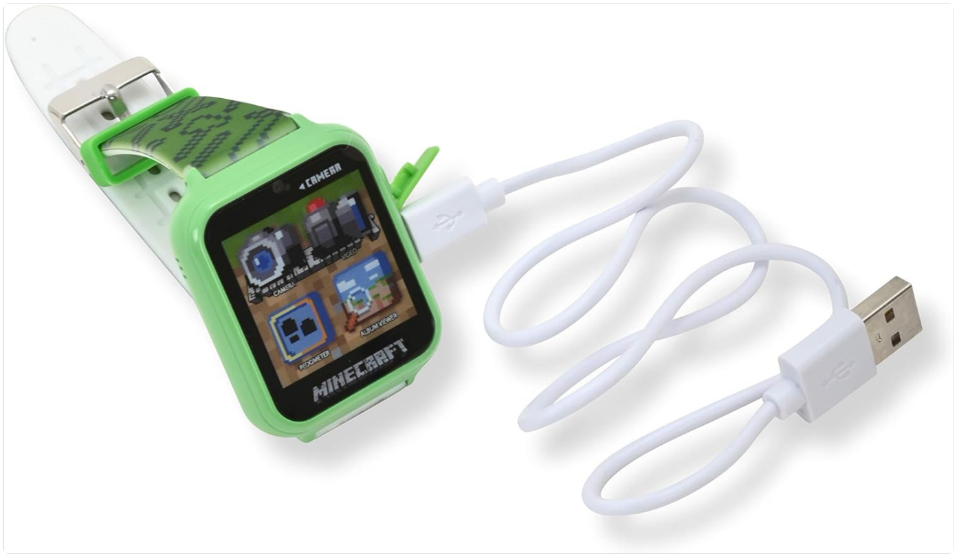
Figure 4: The watch connected to its white USB charging cable, illustrating the charging port location on the side of the watch.