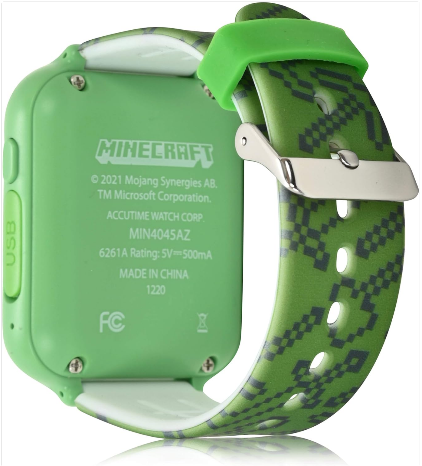
Figure 3: Back view of the watch, showing the "MINECRAFT" logo, copyright information, model number MIN4045AZ, and regulatory markings on the green and white casing.