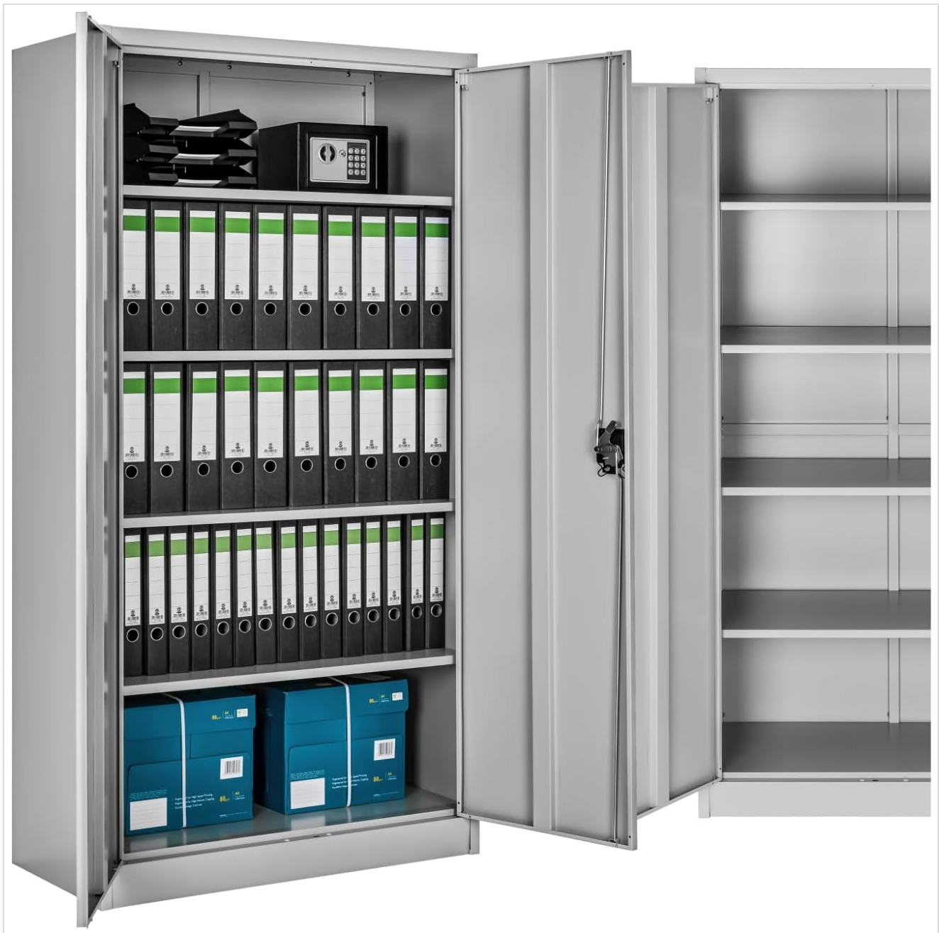
Image: The TecTake Metal Storage Unit with its two doors fully open, revealing multiple shelves filled with organized files and storage boxes. A small safe is visible on the top shelf.