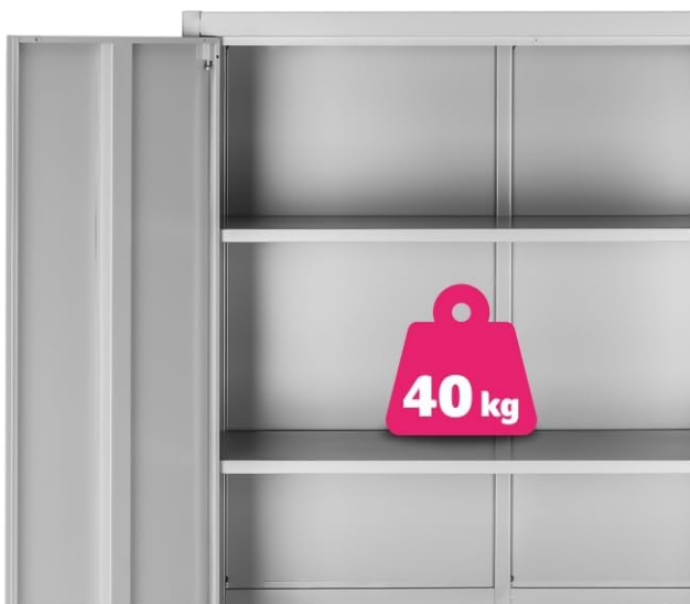
3. Solid shelves with a load capacity of 40 kg