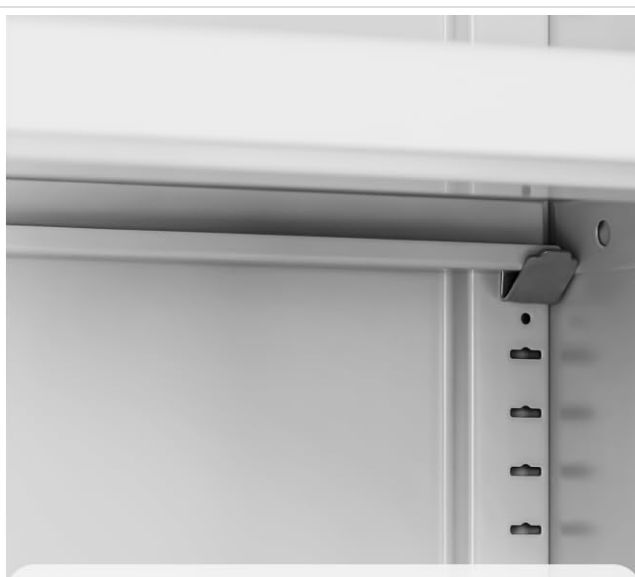
2. Individual height adjustment of the shelves