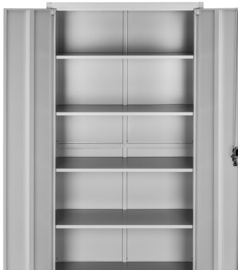
4. Doors with rubber buffers for quiet closing

Image: A composite image illustrating key assembly and feature details: the secure cylinder lock with keys, the mechanism for individual shelf height adjustment, a shelf demonstrating its 40 kg load capacity, and the rubber buffers on the doors for quiet closing.