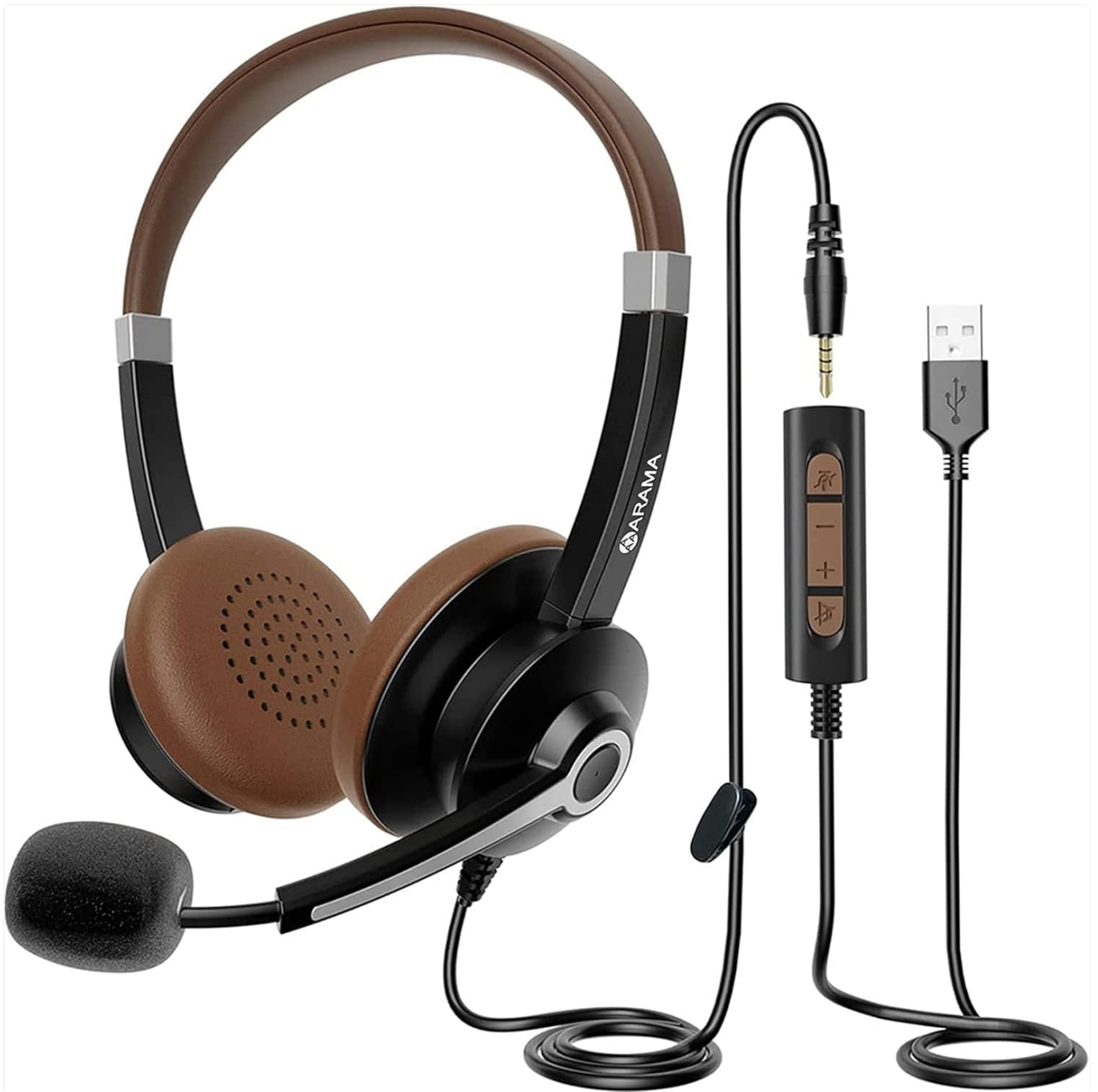
Figure 1: Arama ARA700 USB Headset. This image displays the complete headset with its brown ear cushions and headband, adjustable microphone, and the attached USB and 3.5mm audio cables with in-line controls.