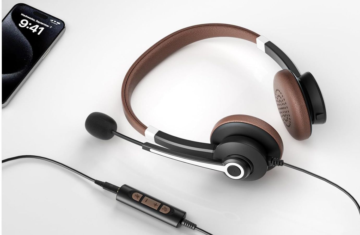
Figure 4: Dual connectivity options. This image shows the USB connector and the detachable 3.5mm jack, illustrating the versatility of the headset for different devices.

which gives you an additional connection option for phones and tablets.