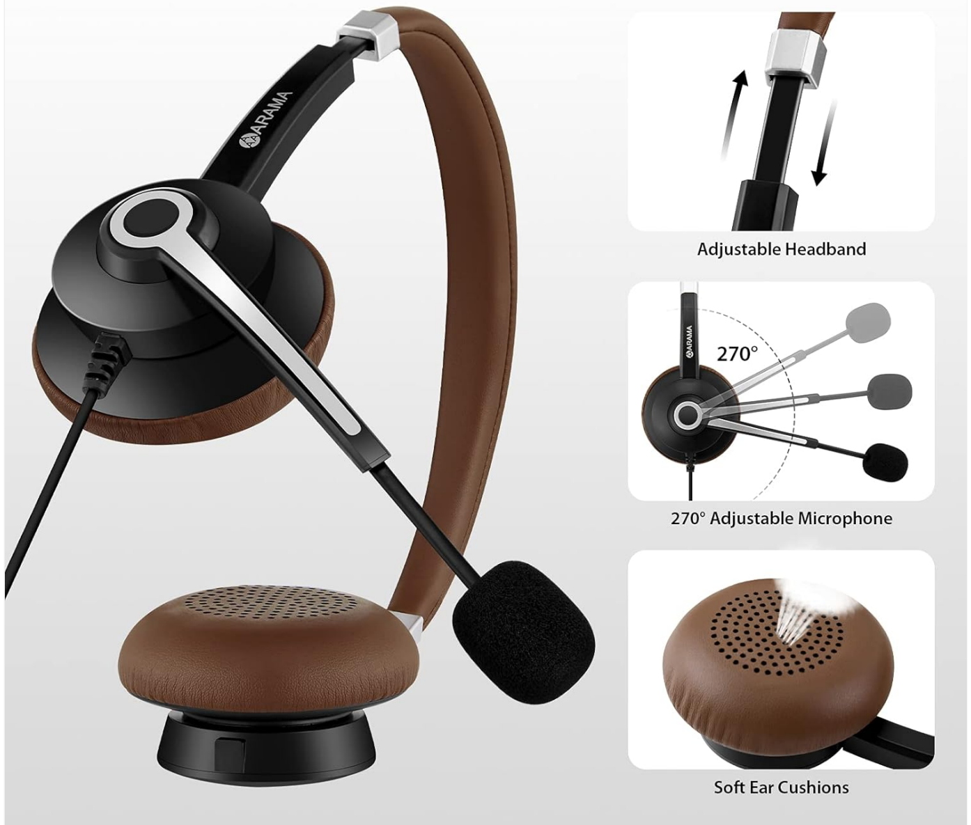
Figure 2: Headset comfort features. This image illustrates the adjustable headband and the 270-degree rotatable microphone, along with a close-up of the soft ear cushions designed for comfort and breathability.