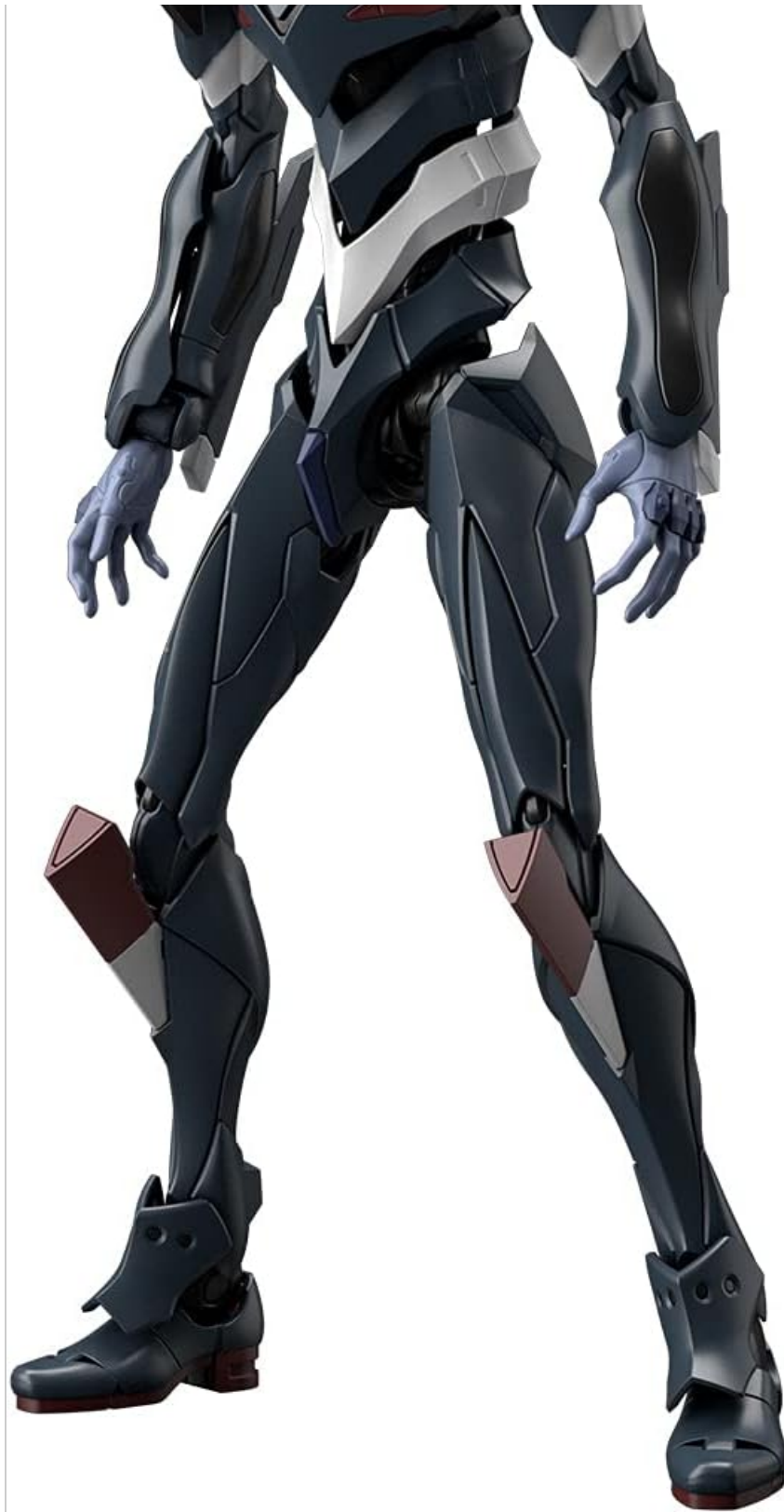
Image: A front view of the fully assembled Evangelion Unit-03 model kit, demonstrating its completed form and detailed coloring.