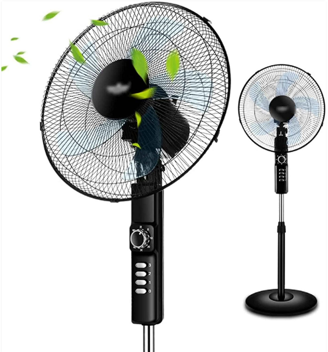
Image: The XLTTY Pedestal Fan, highlighting the control panel on the main body, which includes a rotary knob and push buttons for various settings.

The control panel is located on the motor unit and features mechanical knob controls for power, speed, and timer settings.