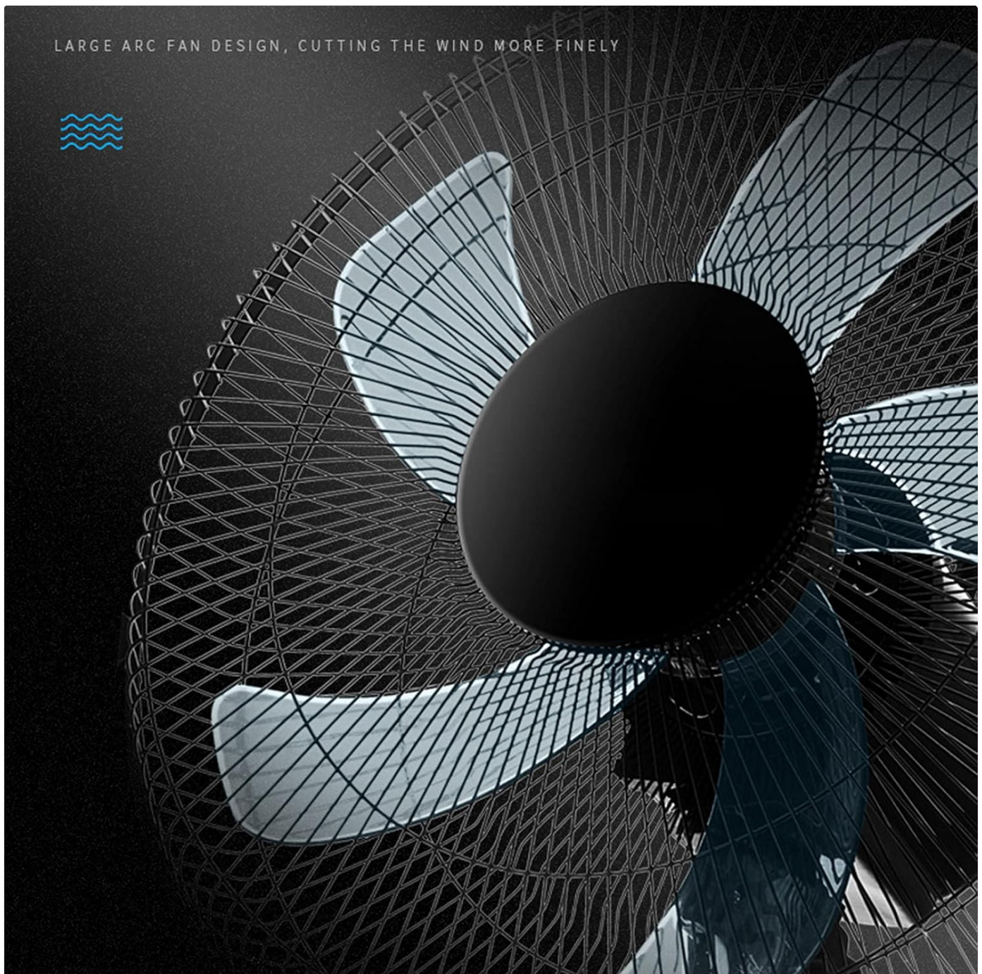
Image: A detailed view of the XLTTY Pedestal Fan's five-blade design and the protective double-ring net cover, emphasizing the fine mesh for safety and efficient air cutting.