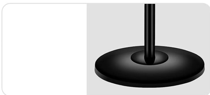
15cm telescopic pole