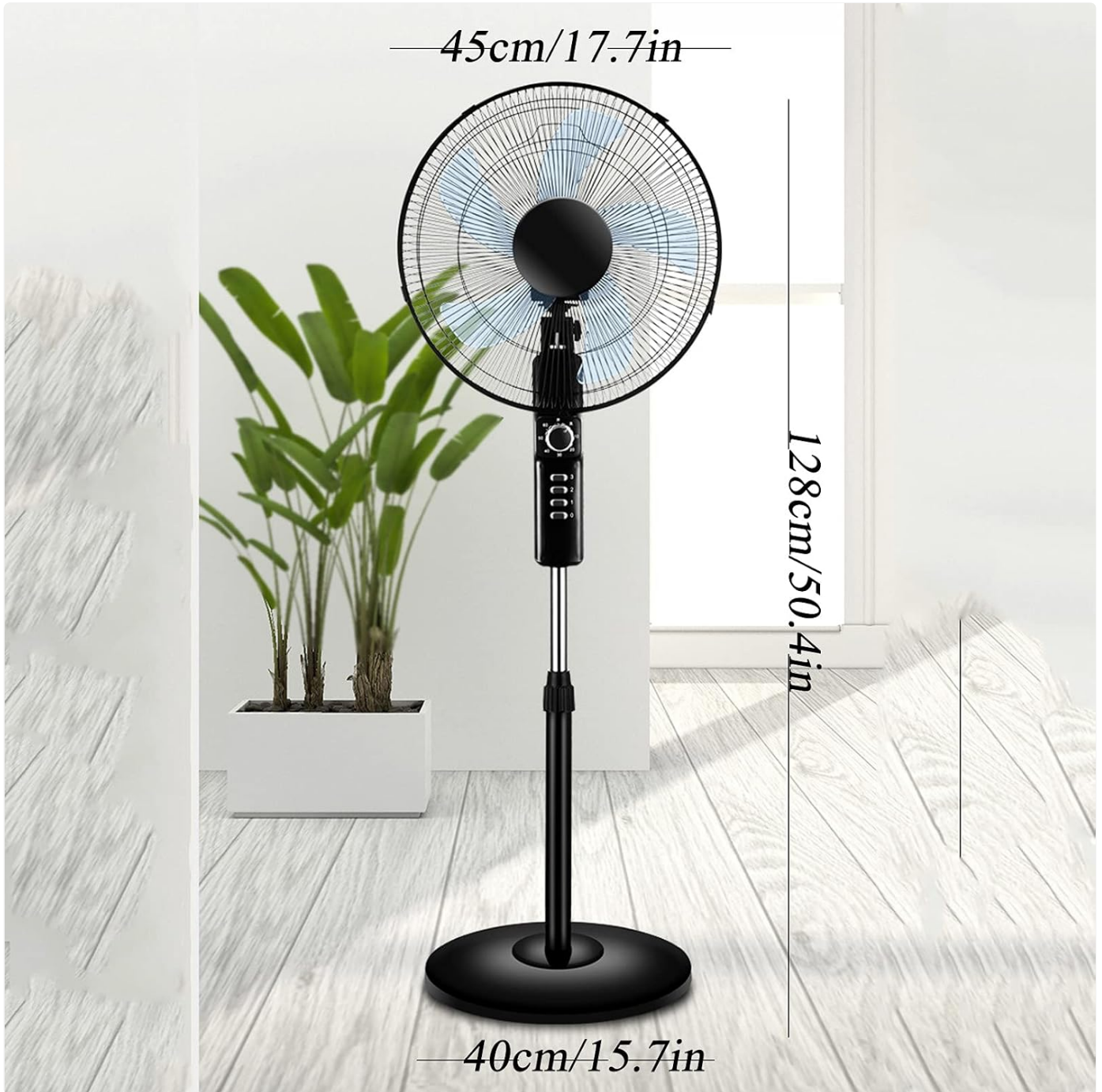
Image: Diagram illustrating the dimensions of the XLTTY Pedestal Fan, showing a fan head width of 45cm (17.7 inches), a maximum height of 128cm (50.4 inches), and a base width of 40cm (15.7 inches).