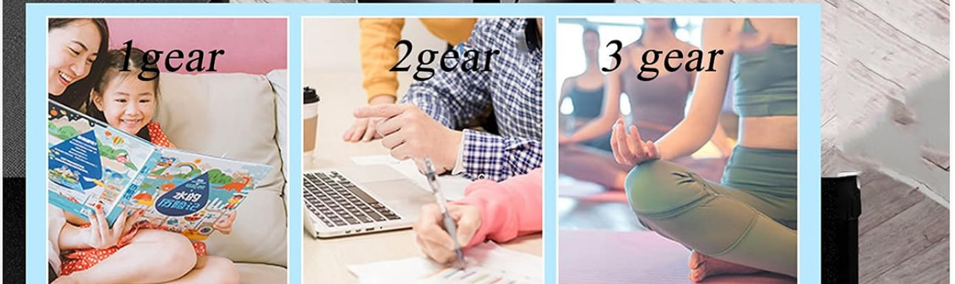
Image: Visual representation of the fan's three speed settings, suggesting appropriate uses: Speed 1 for quiet activities like reading, Speed 2 for focused tasks like working, and Speed 3 for more active situations like exercise.