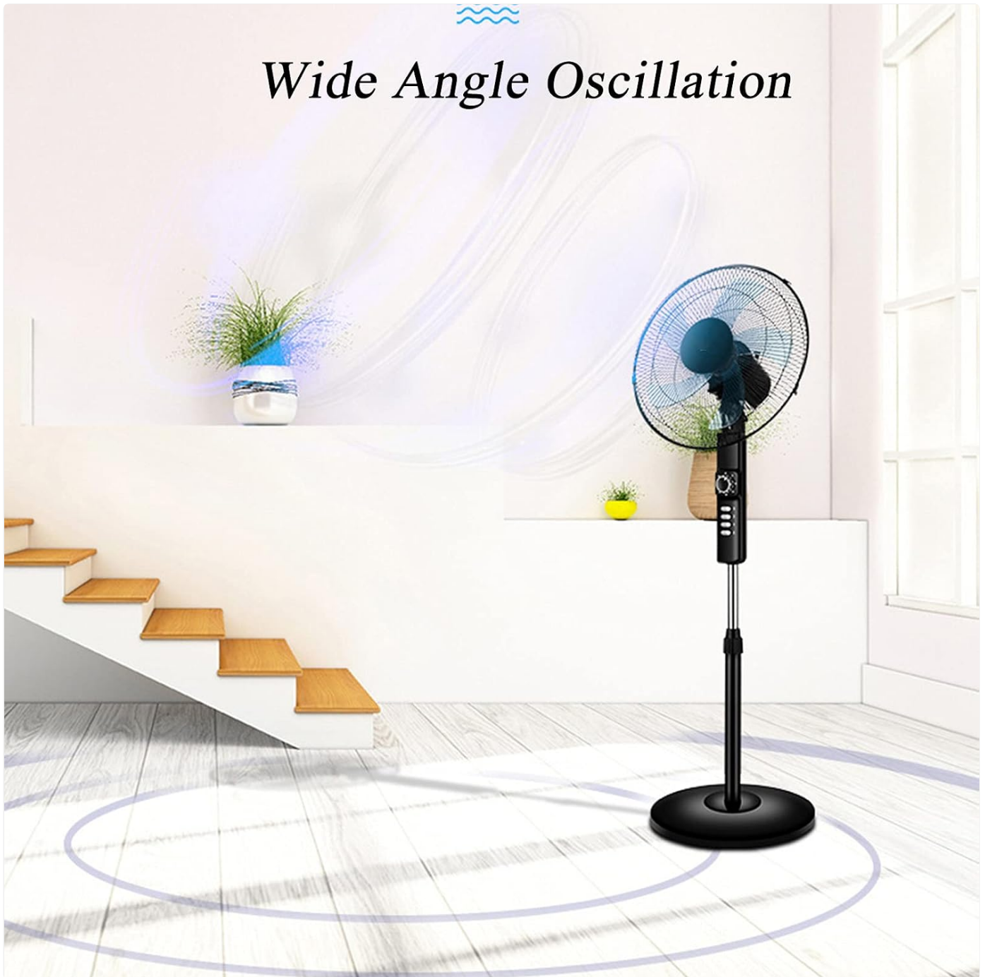
Image: The XLTTY Pedestal Fan operating with its wide-angle oscillation feature, illustrating how air is distributed broadly across a room.