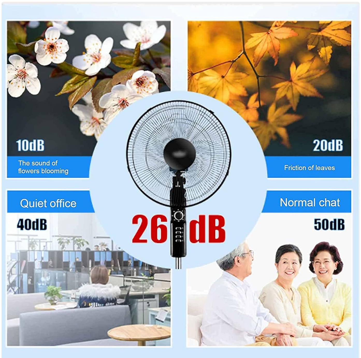
Image: A comparative chart illustrating the low noise output of the XLTTY Pedestal Fan (26 dB), juxtaposed with common ambient sounds like blooming flowers (10 dB), rustling leaves (20 dB), a quiet office (40 dB), and normal conversation (50 dB).