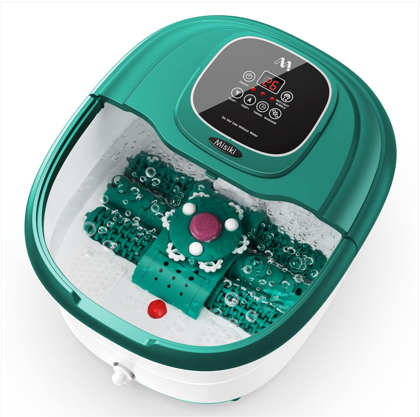
Image: The Misiki Foot Spa Bath Massager, ready for use.