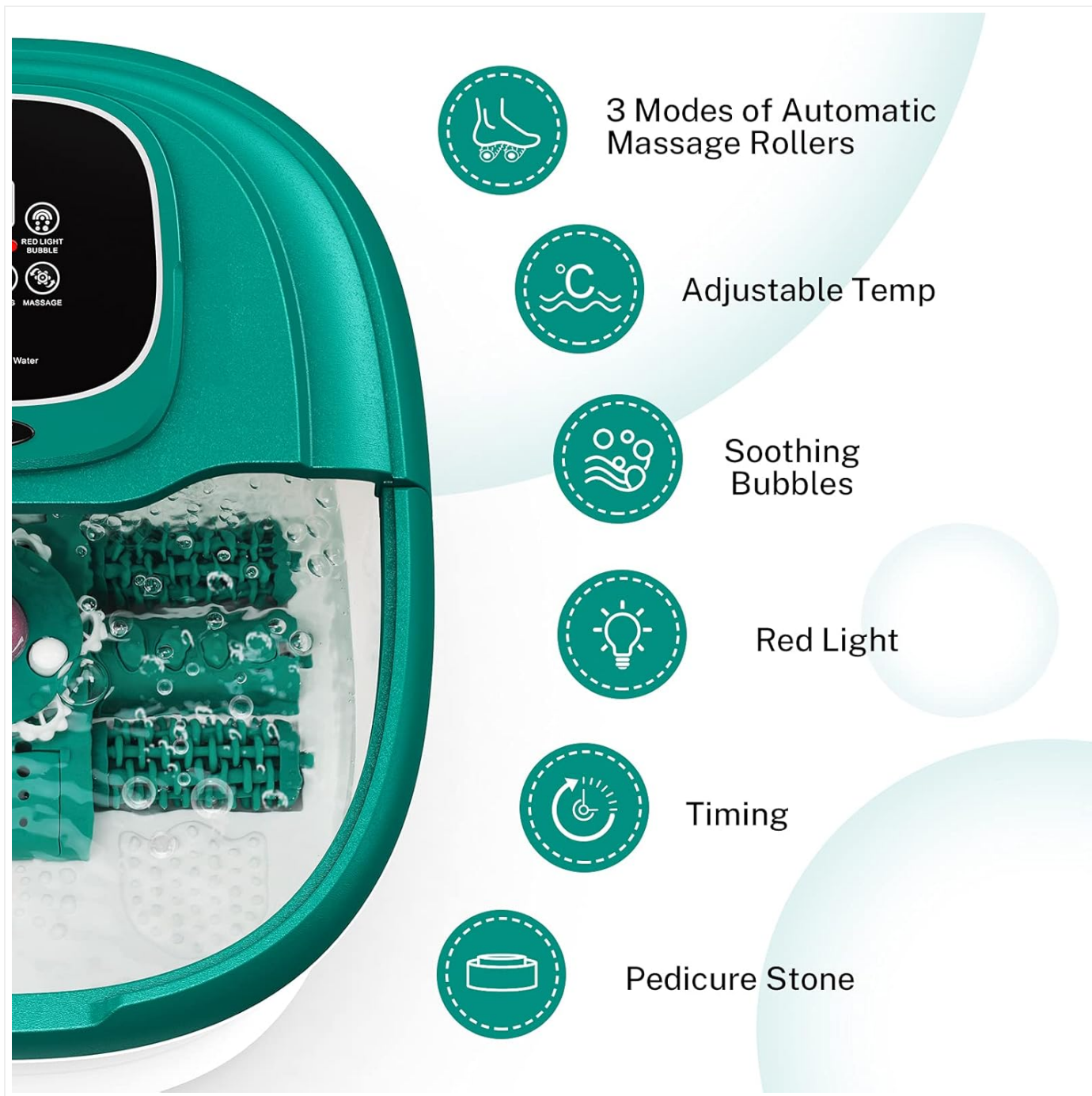
Image: Overview of the Misiki Foot Spa's key features, including massage modes, temperature control, bubbles, red light, timer, and pedicure stone.