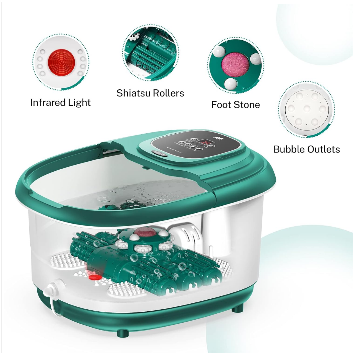
Image: Visual representation of the three automatic massage modes.