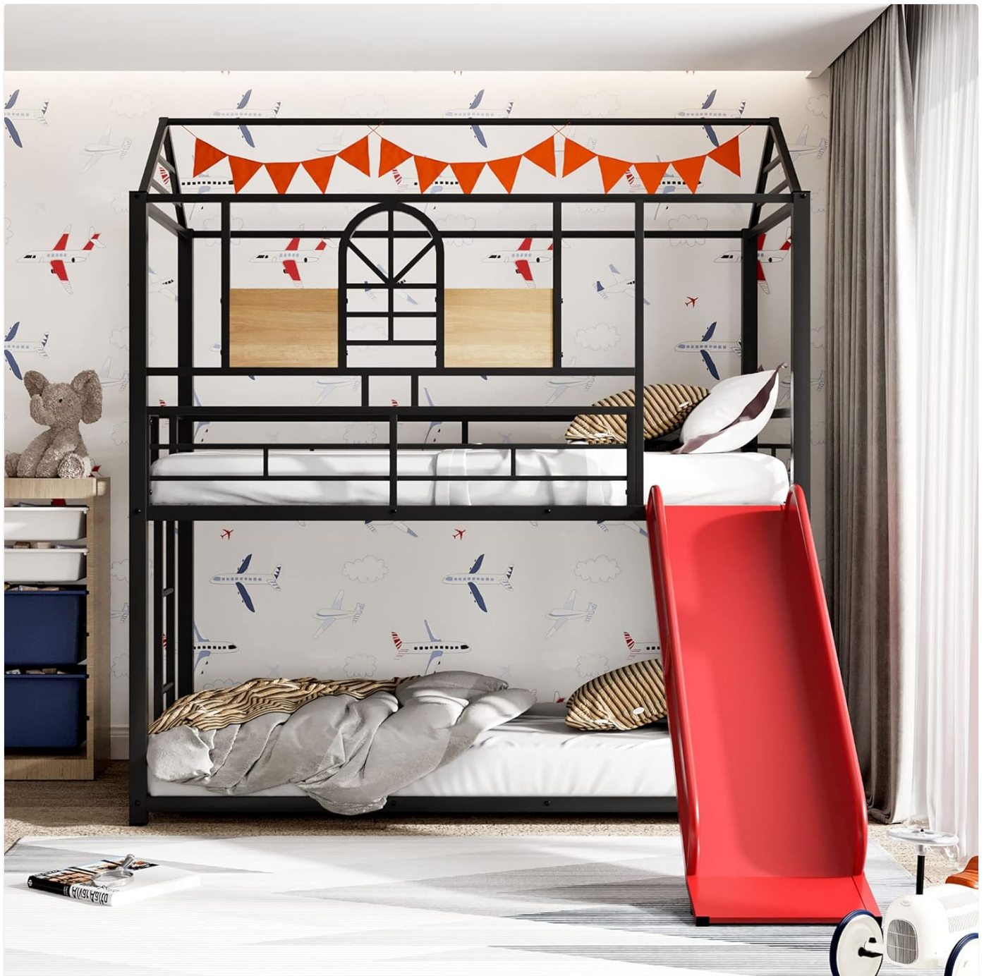
Image: A detailed view of the upper bunk's house-shaped frame and the integrated wooden panels.