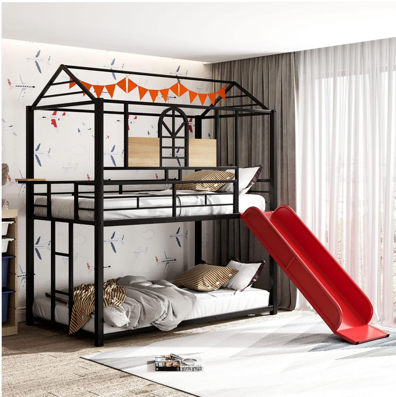
Image: The Bellemave Twin Over Twin Metal Bunk Bed with Slide, featuring a house-shaped frame and a red slide, set up in a bedroom.