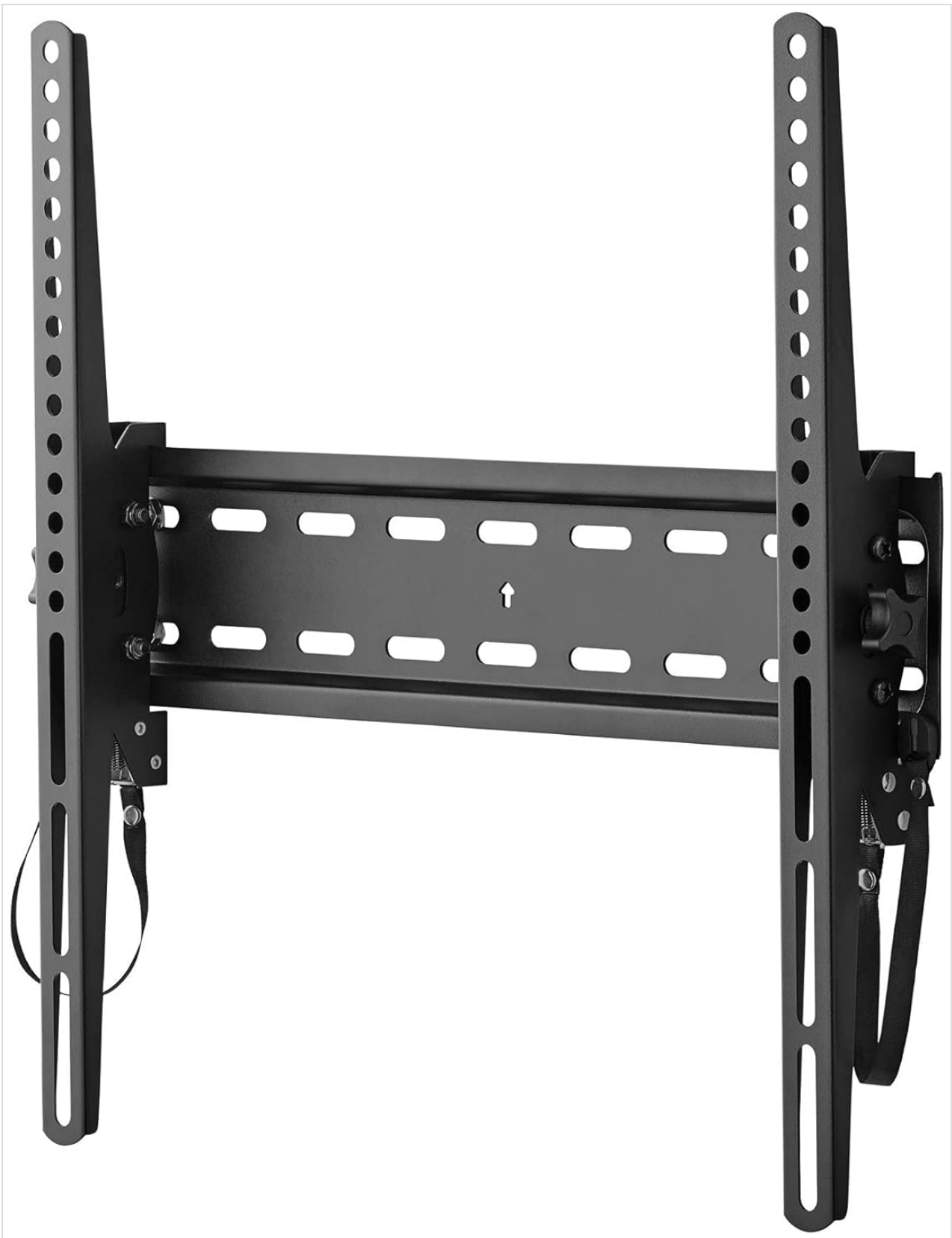
Figure 1: Main assembly of the ONN Tilting TV Wall Mount. This image shows the wall plate and the two vertical TV bracket arms.