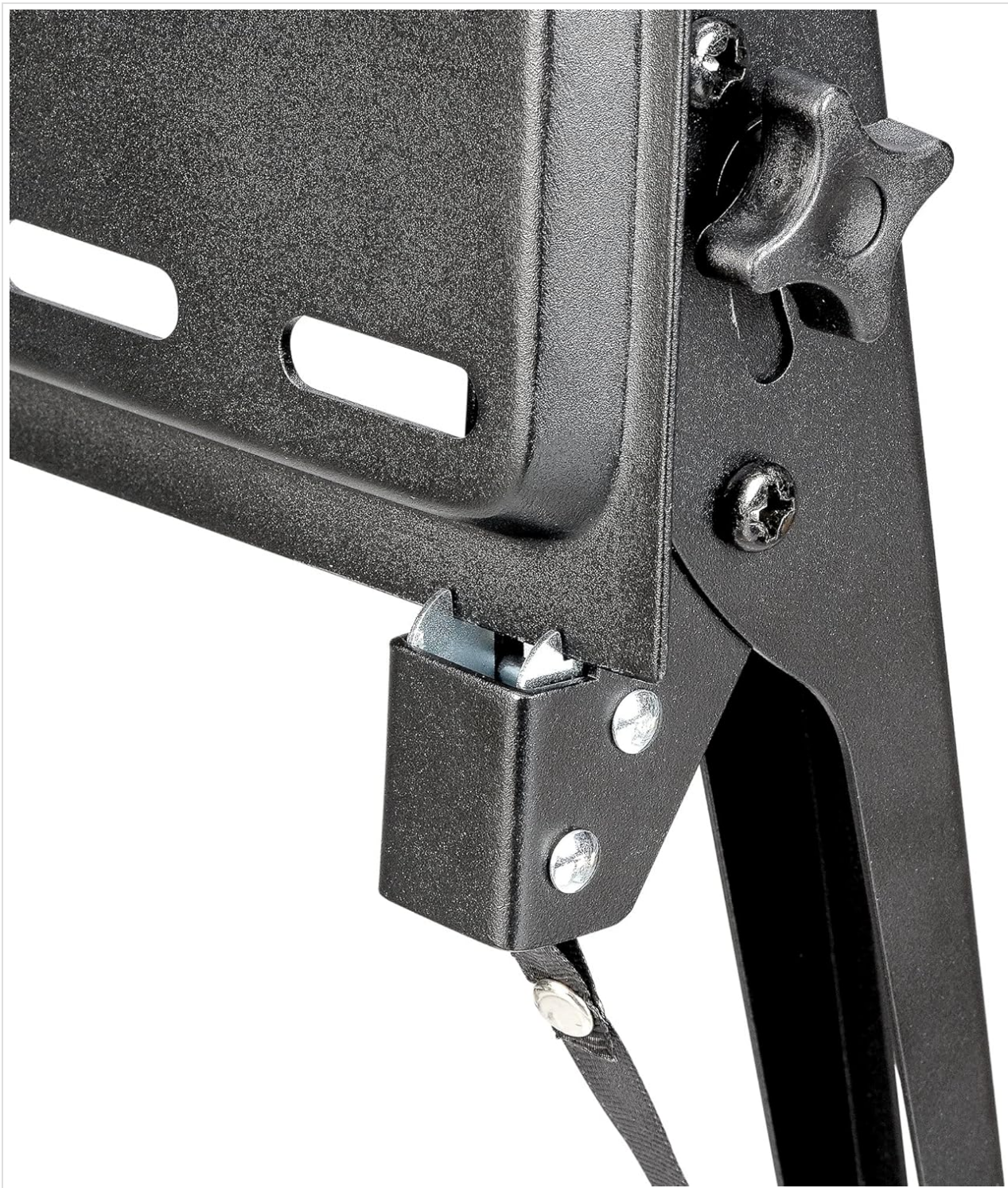
Figure 3: Detailed view of the safety latch mechanism located at the bottom of the TV bracket arm. This latch secures the TV to the wall plate and can be pulled to release the TV for removal.