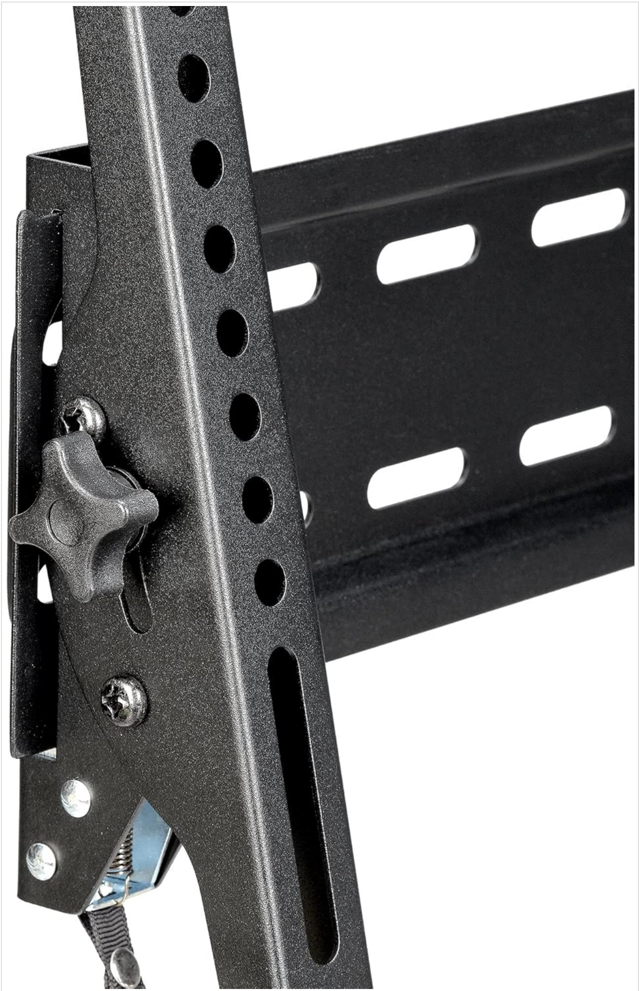
Figure 2: Close-up view of the TV bracket arm, highlighting the tilting adjustment knob. This knob allows for fine-tuning the tilt angle of the television once mounted.