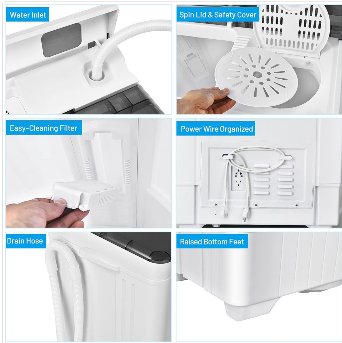
Various components including water inlet, filter, power cord, drain hose, and feet.