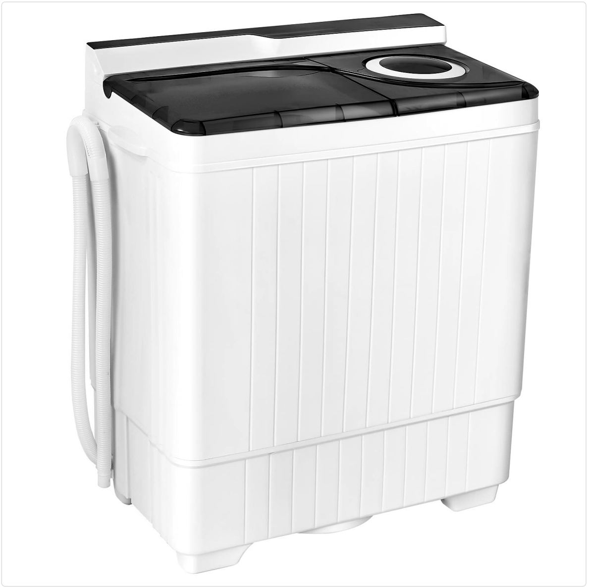
Overall view of the Giantex Semi-automatic Twin Tub Washing Machine.