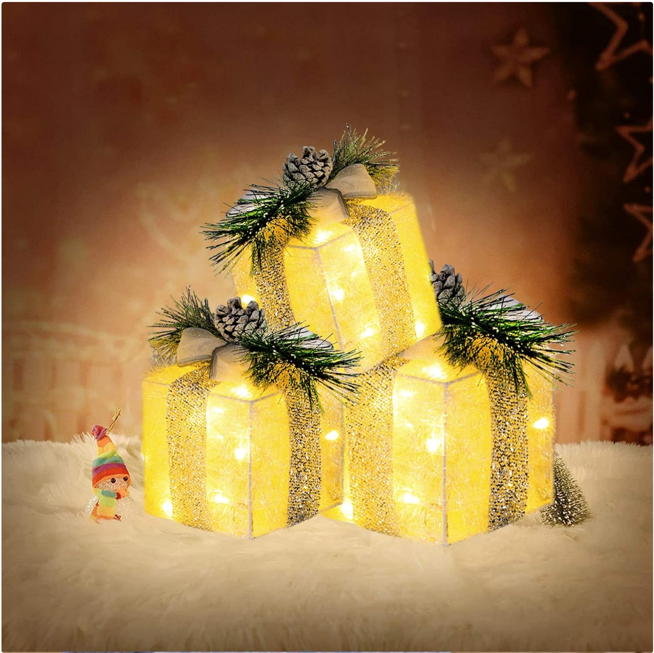
Image: Close-up of the detachable pine cone decoration.