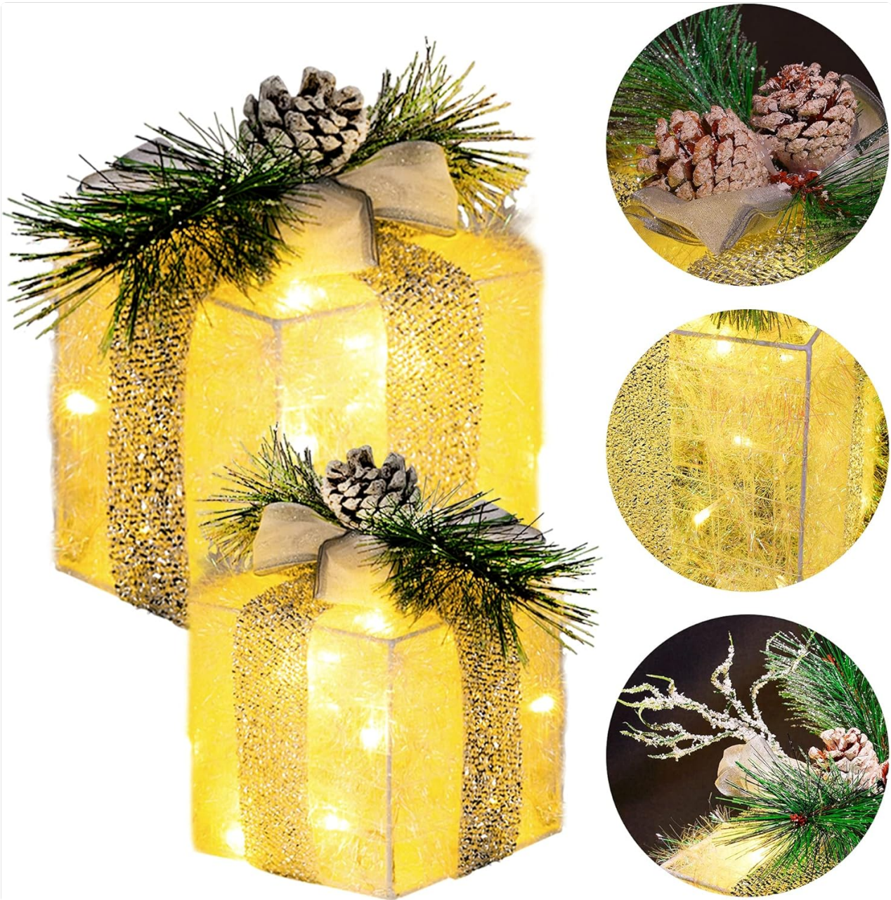
Image: Lighted gift boxes as indoor Christmas decor.