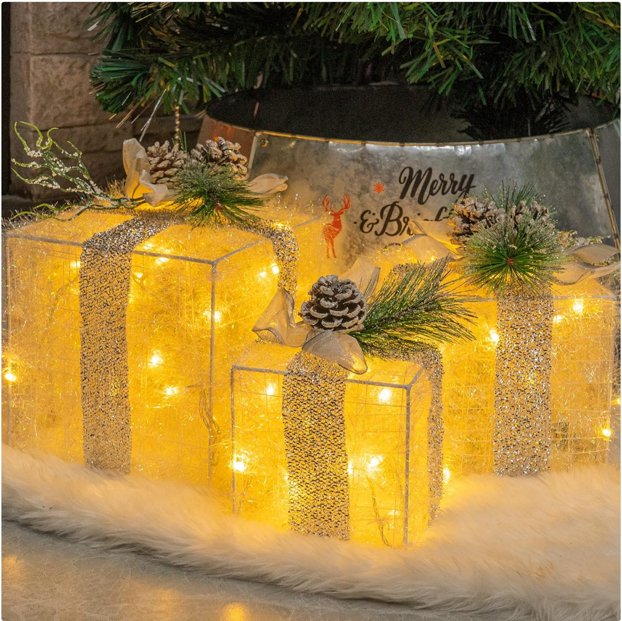
Image: Hourleey Lighted Gift Boxes illuminating a festive scene.