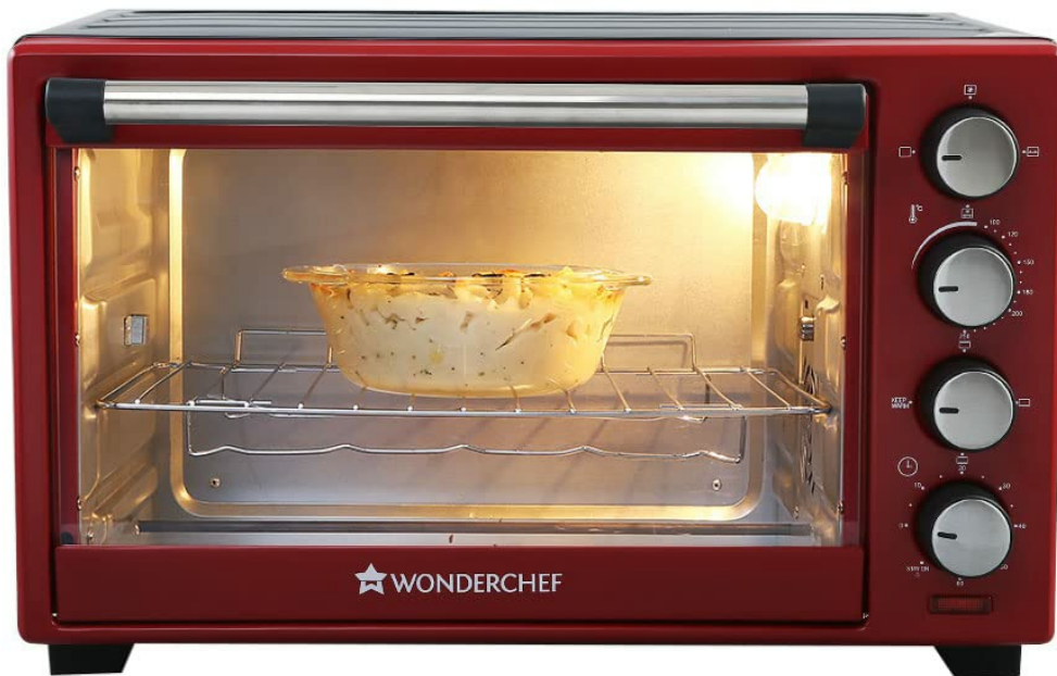
Image 1.1: Wonderchef OTG Crimson Edge 28 Litres, front view with food inside.