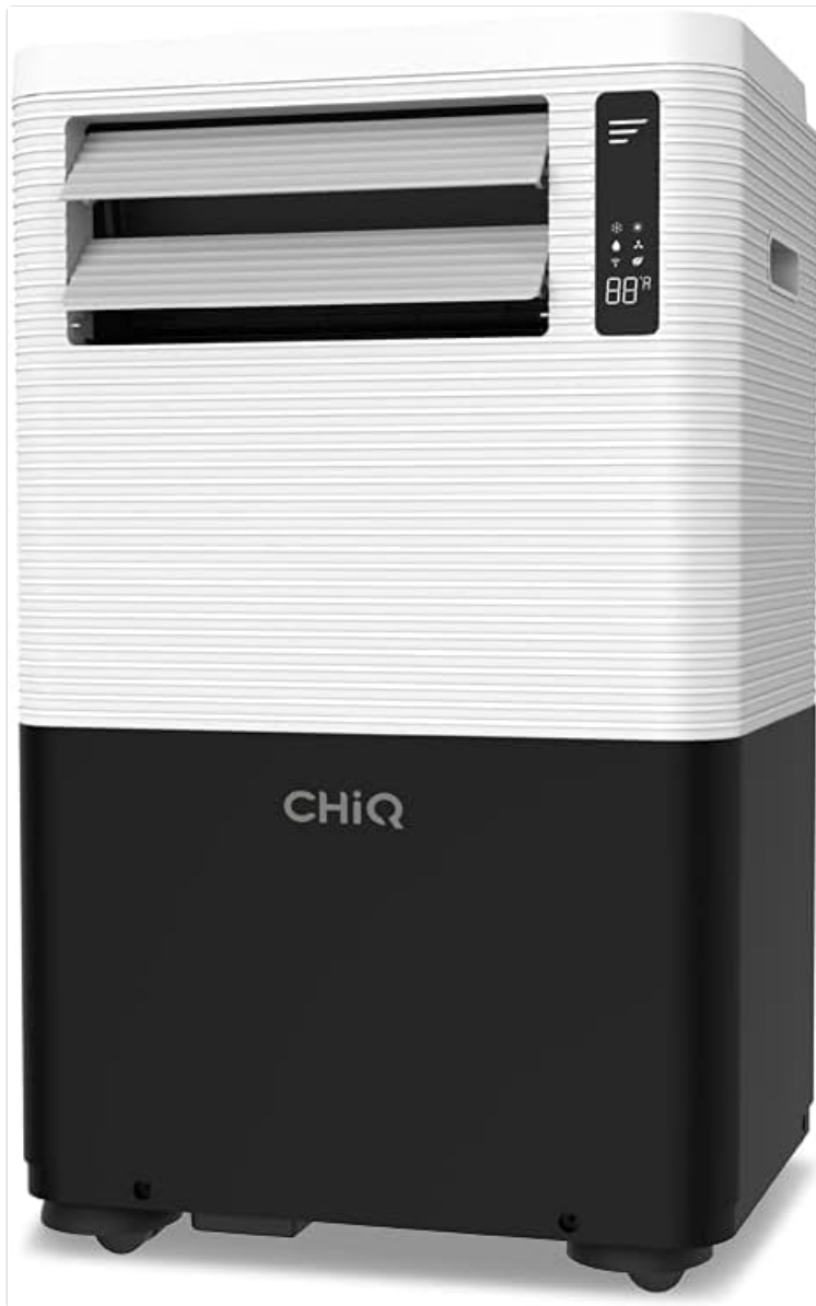
Image: Front view of the CHIQ Portable Air Conditioner, showcasing its white and black design with air vents and control panel.