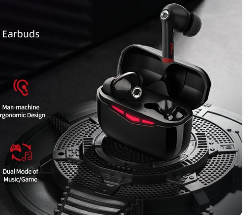
Image: An overview graphic detailing key features of the Hecate GM3, including 60ms latency, H + Game Sound Effects, 10mm Biologic Diaphragm, Ergonomic Design, 19.5h Playback, IP55 rating, Vacuum Plated Touch-control Ring, and Dual Mode (Music/Game).