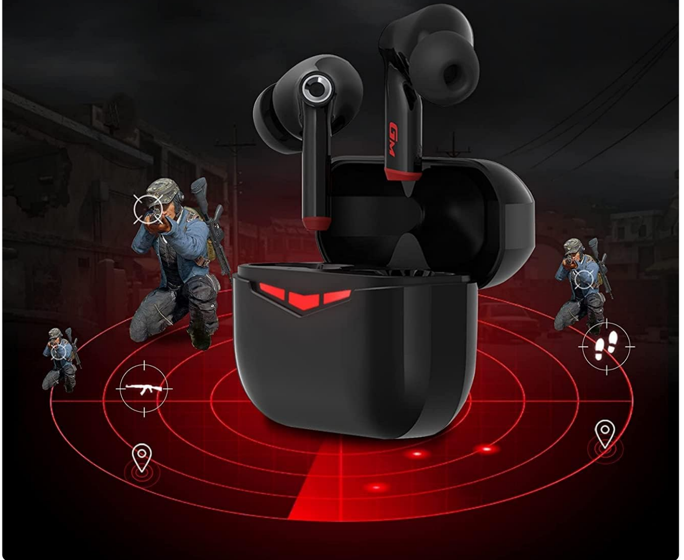
Image: The Hecate GM3 earbuds and case with a graphic illustrating enhanced positional audio, highlighting the ability to hear detailed sounds like gunshots, footsteps, and explosions in gaming.

GM3 gaming earbuds give you immersive positional audio with enhanced bass to hear more detailed sounds of gunshots, footsteps, and explosions in gaming.