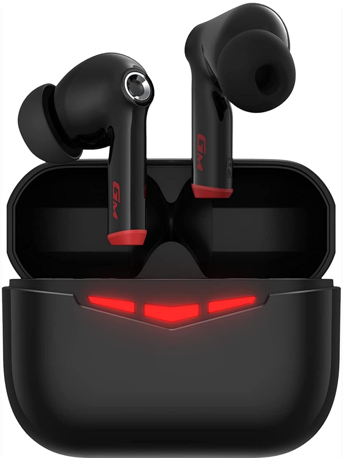
Image: The Hecate GM3 True Wireless Earbuds shown inside their charging case, with the case lid open revealing the earbuds and the illuminated indicator lights.