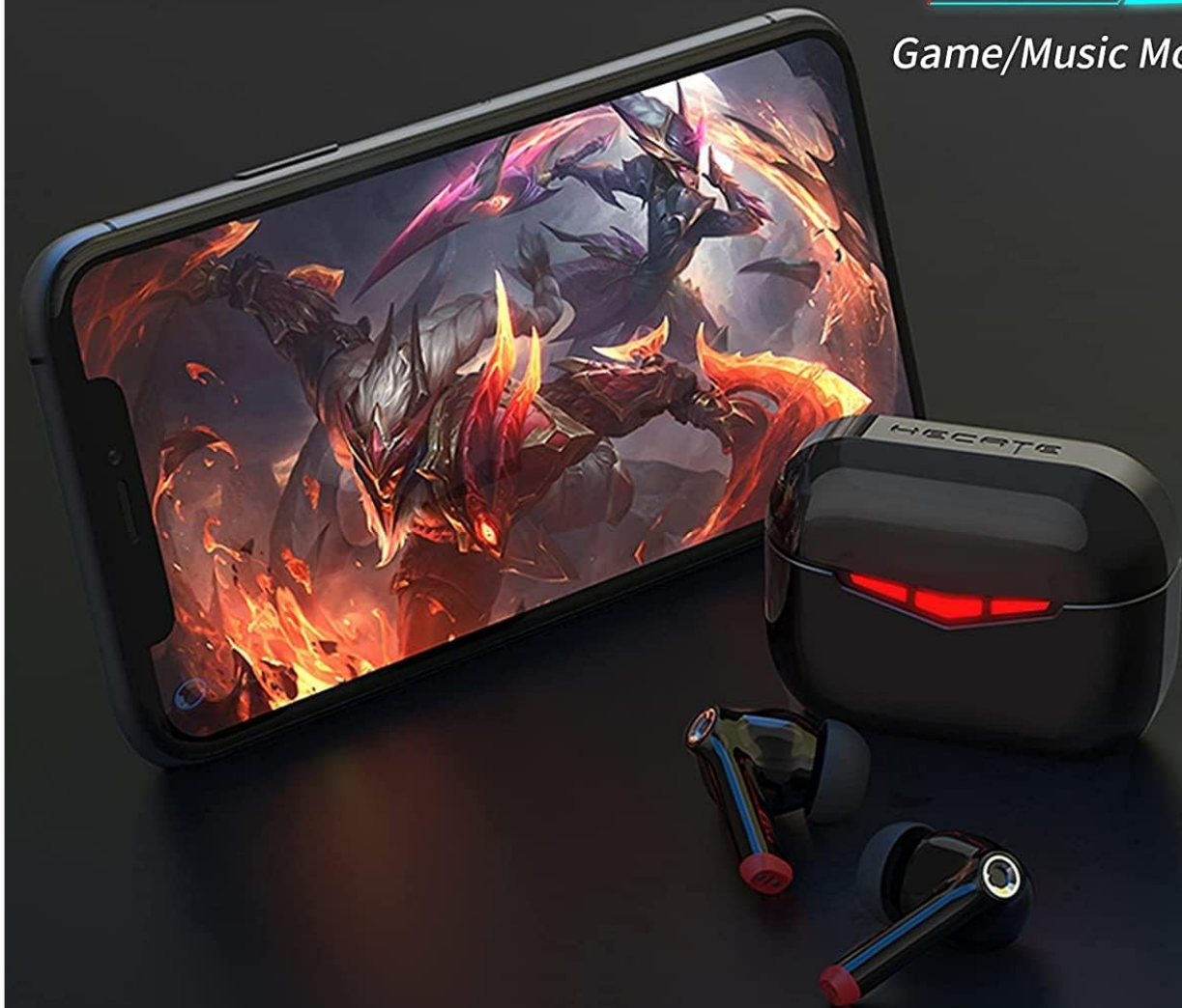
Image: An illustration showing the Hecate GM3 earbuds and charging case next to a smartphone displaying a game, emphasizing the 60ms imperceptible latency and the Game/Music Mode feature.