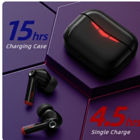
Image: Visual representation of the Hecate GM3's battery life, showing 15 hours from the charging case and 4.5 hours from a single earbud charge.

A single charge provides approximately 4.5 hours of playback, and the charging case provides an additional 15 hours, totaling up to 19.5 hours of battery life.