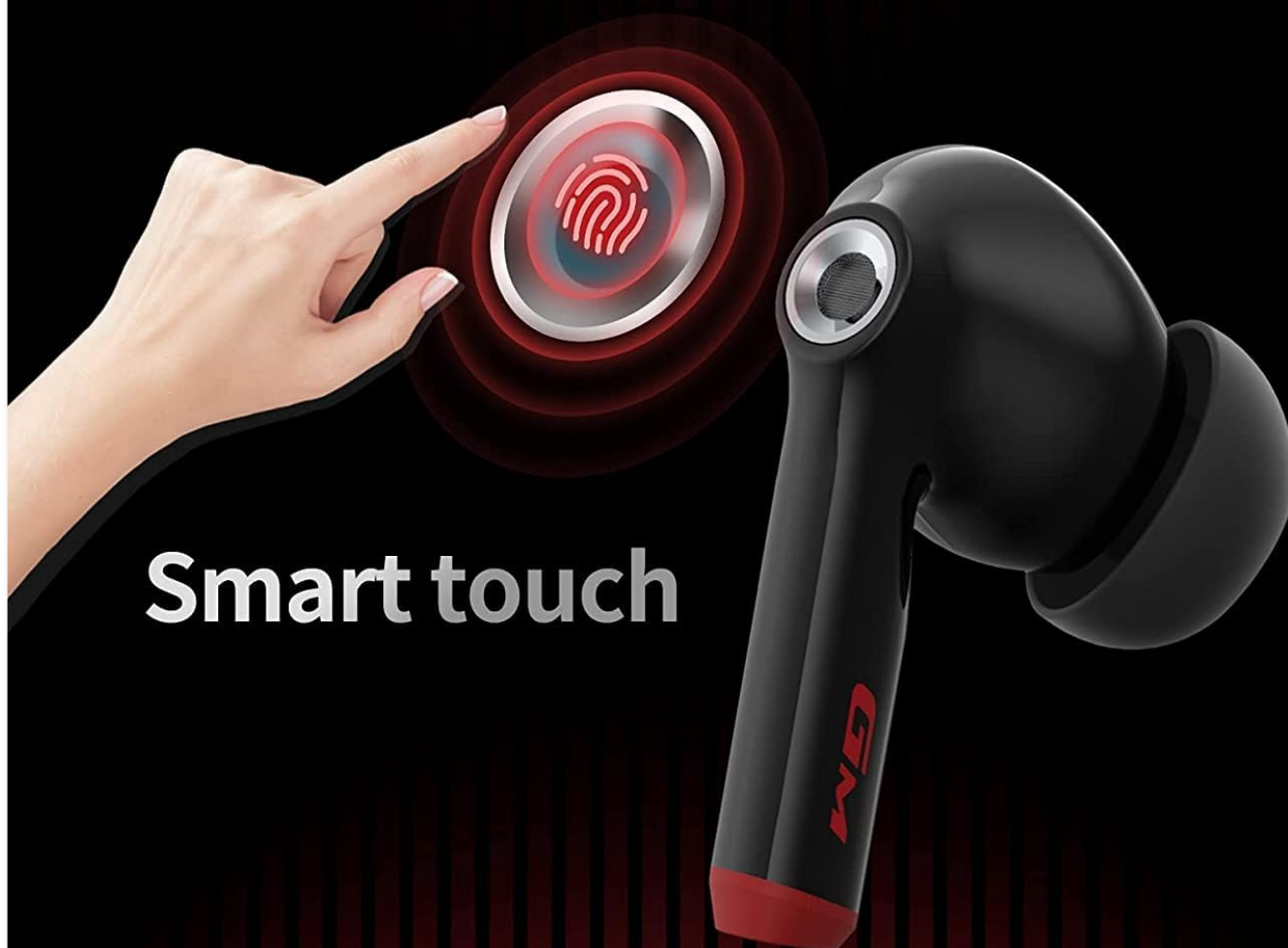
Image: A close-up of the Hecate GM3 earbud highlighting the "Smart touch" area, indicating the location of the touch-control ring.