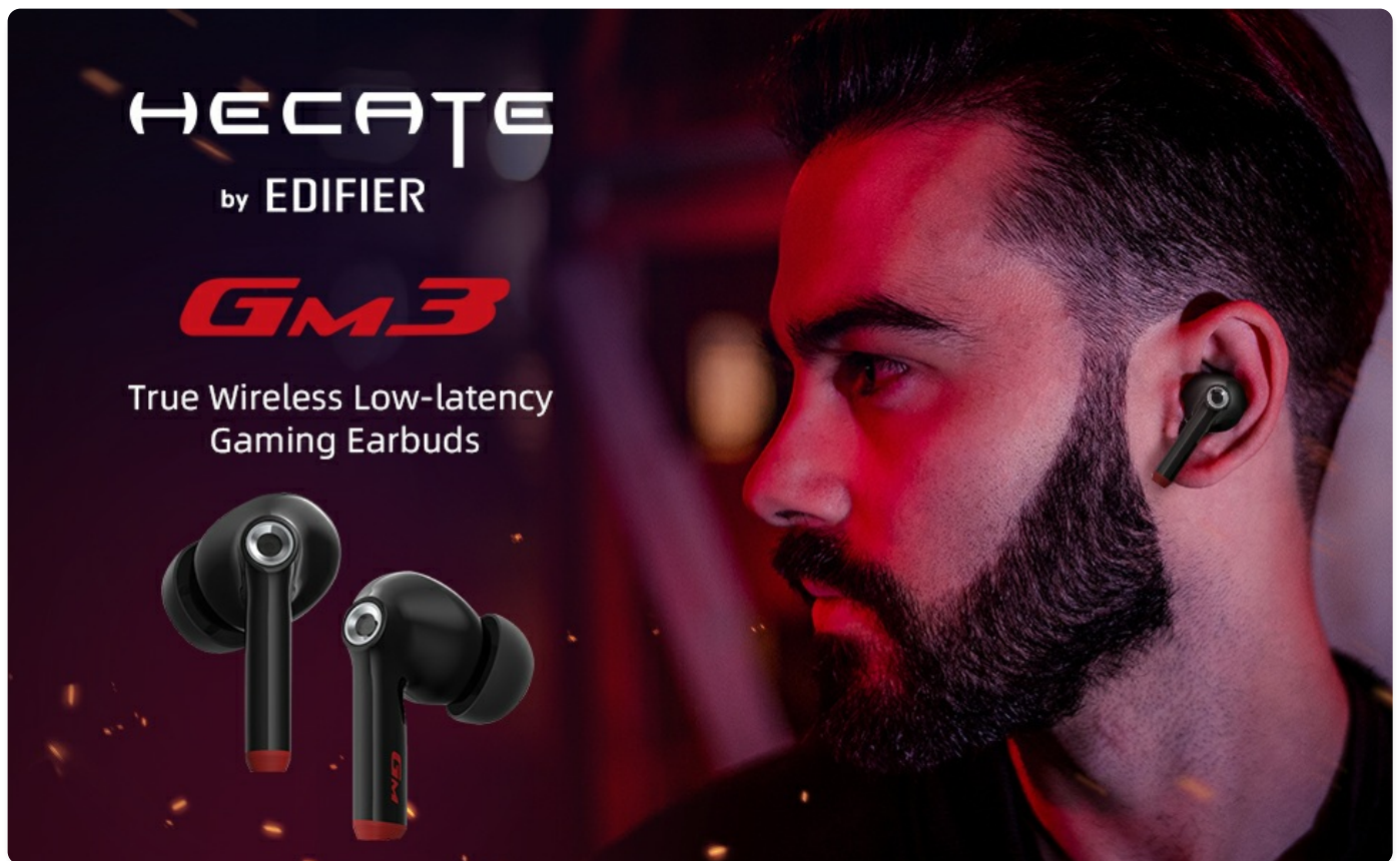
Image: Hecate GM3 True Wireless Low-latency Gaming Earbuds. This image displays the product branding and highlights its gaming focus.

Thank you for choosing the Edifier Hecate GM3 True Wireless Earbuds. These earbuds are designed to provide an immersive audio experience, especially for gaming, with features like low latency, specialized sound effects, and comfortable wear. This manual will guide you through the setup, operation, and maintenance of your GM3 earbuds to ensure optimal performance.