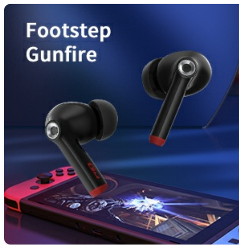
Image: The Hecate GM3 earbuds positioned above a portable gaming console, illustrating the enhanced footstep and gunfire sound effects for gaming.