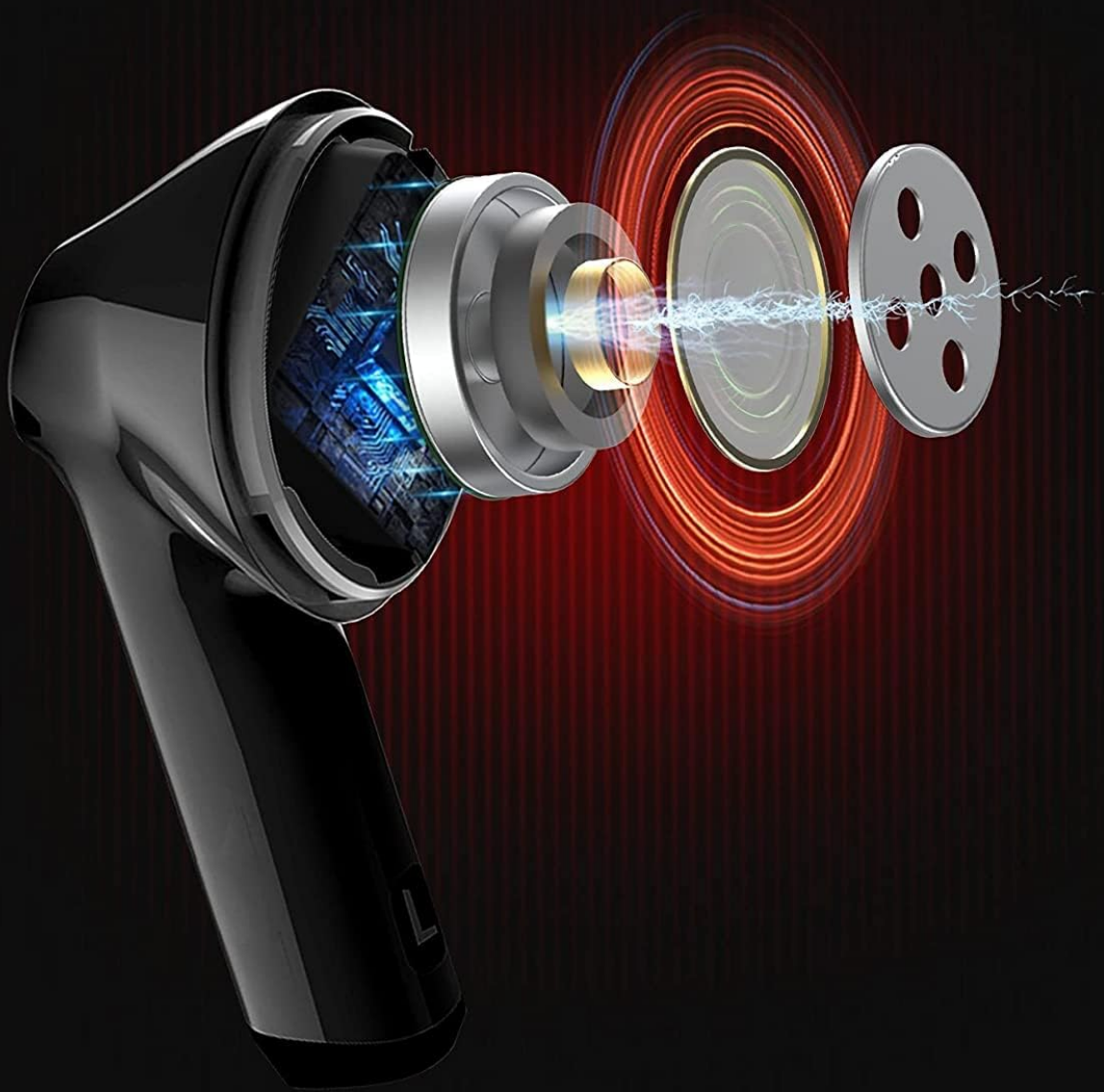
Image: A cutaway diagram of the Hecate GM3 earbud, highlighting the 10mm composite biologic diaphragm and its internal components responsible for sound production.