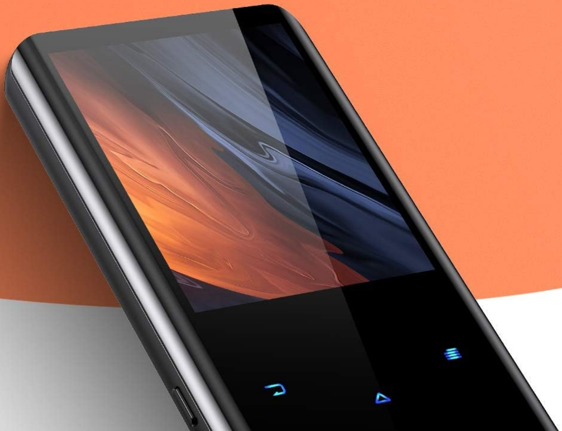
Image: The AGPTEK A19X MP3 player with a visual representation of its diverse functionalities, including music, voice recording, e-book reading, video playback, photo browsing, pedometer, alarm clock, and calendar.