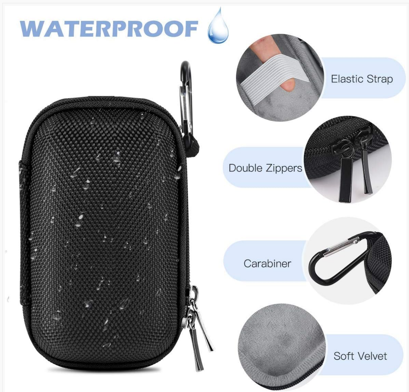
Image: A detailed view of the AGPTEK A19X carrying case, highlighting its key features including the elastic strap, double zippers, carabiner, and soft velvet interior for device protection.

The included carrying case is designed to protect your MP3 player. It features a scratch-resistant and shockproof interior with an elastic strap to secure the device. The dual zippers and carabiner provide convenience and portability.