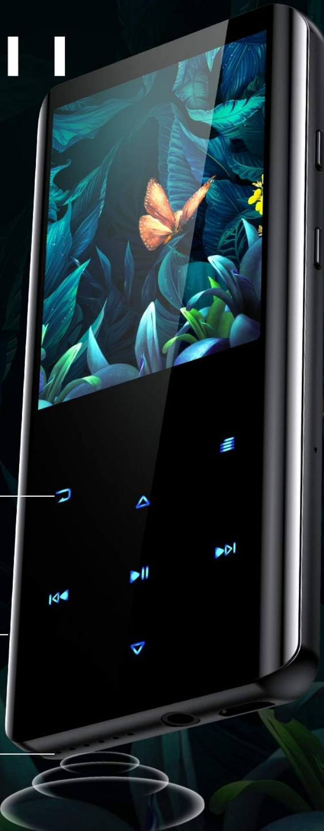
Image: A close-up view of the AGPTEK A19X MP3 player, highlighting its 2.4-inch curved screen, the touch-sensitive navigation buttons below the display, and indicating the built-in speaker and expandable storage.