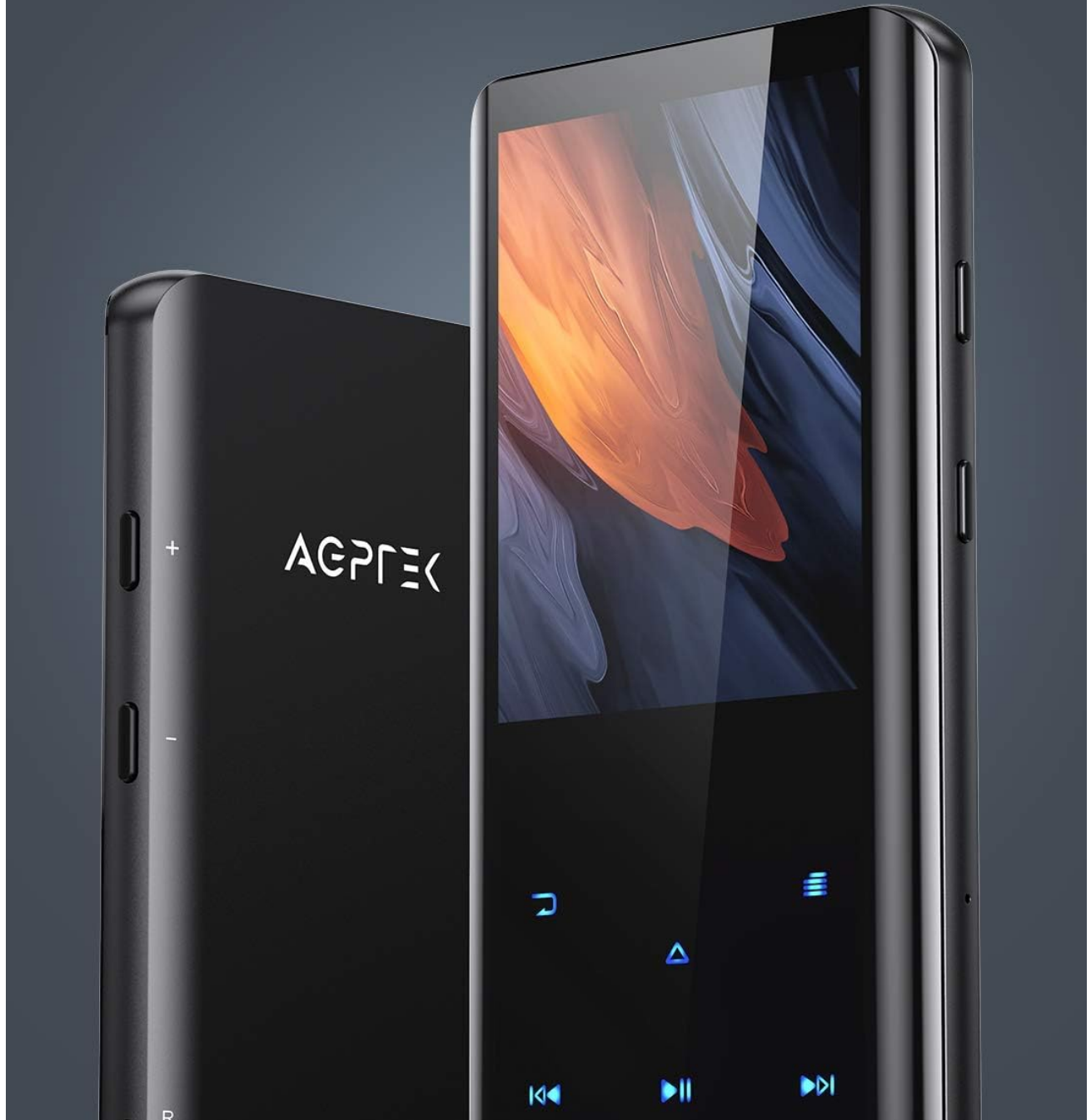
Image: The AGPTEK A19X MP3 player displayed from both front and back angles, emphasizing its double curved surfaces designed for comfortable handling.