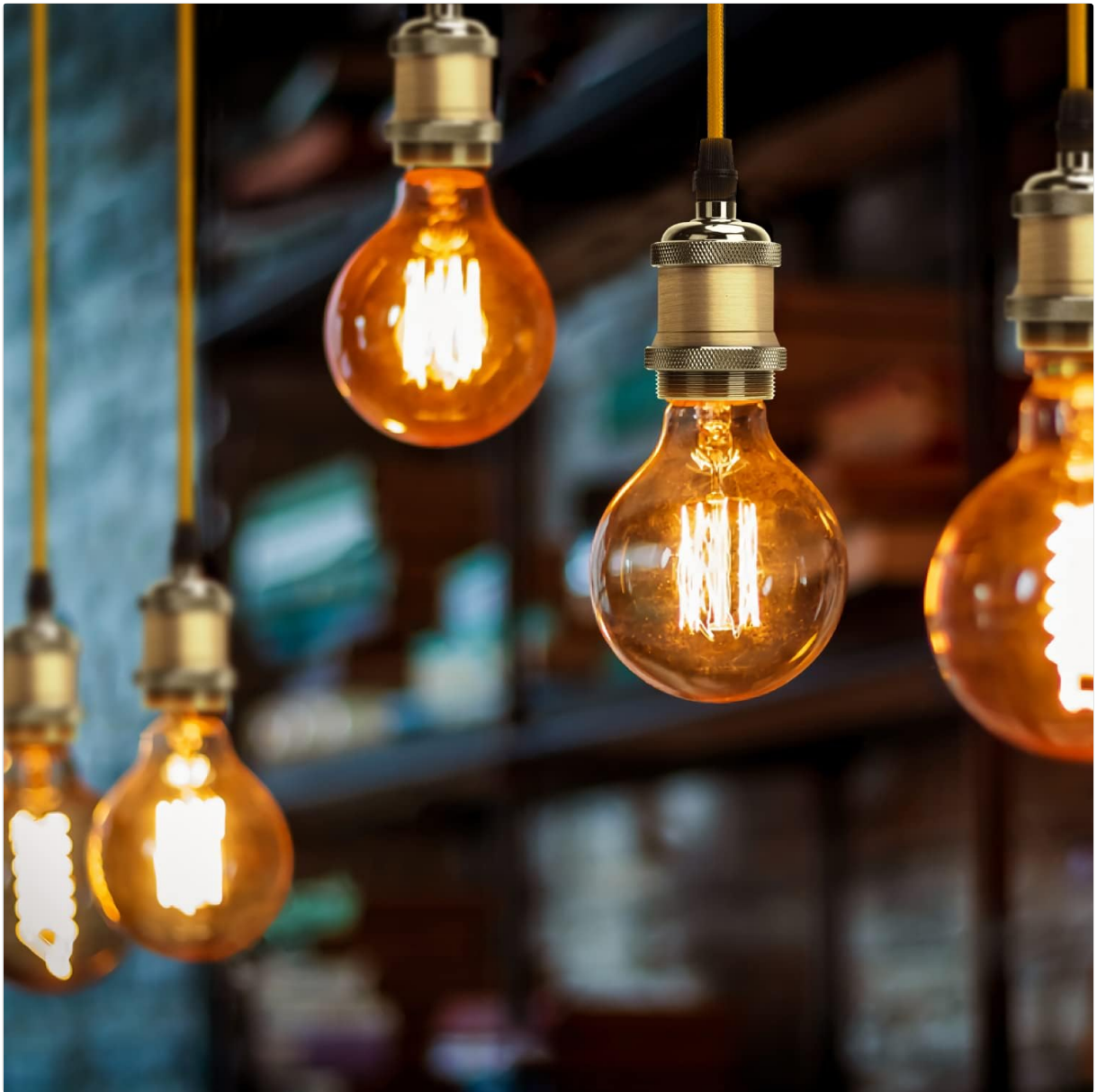
Figure 4: Example of Lamp Holders with Edison Bulbs