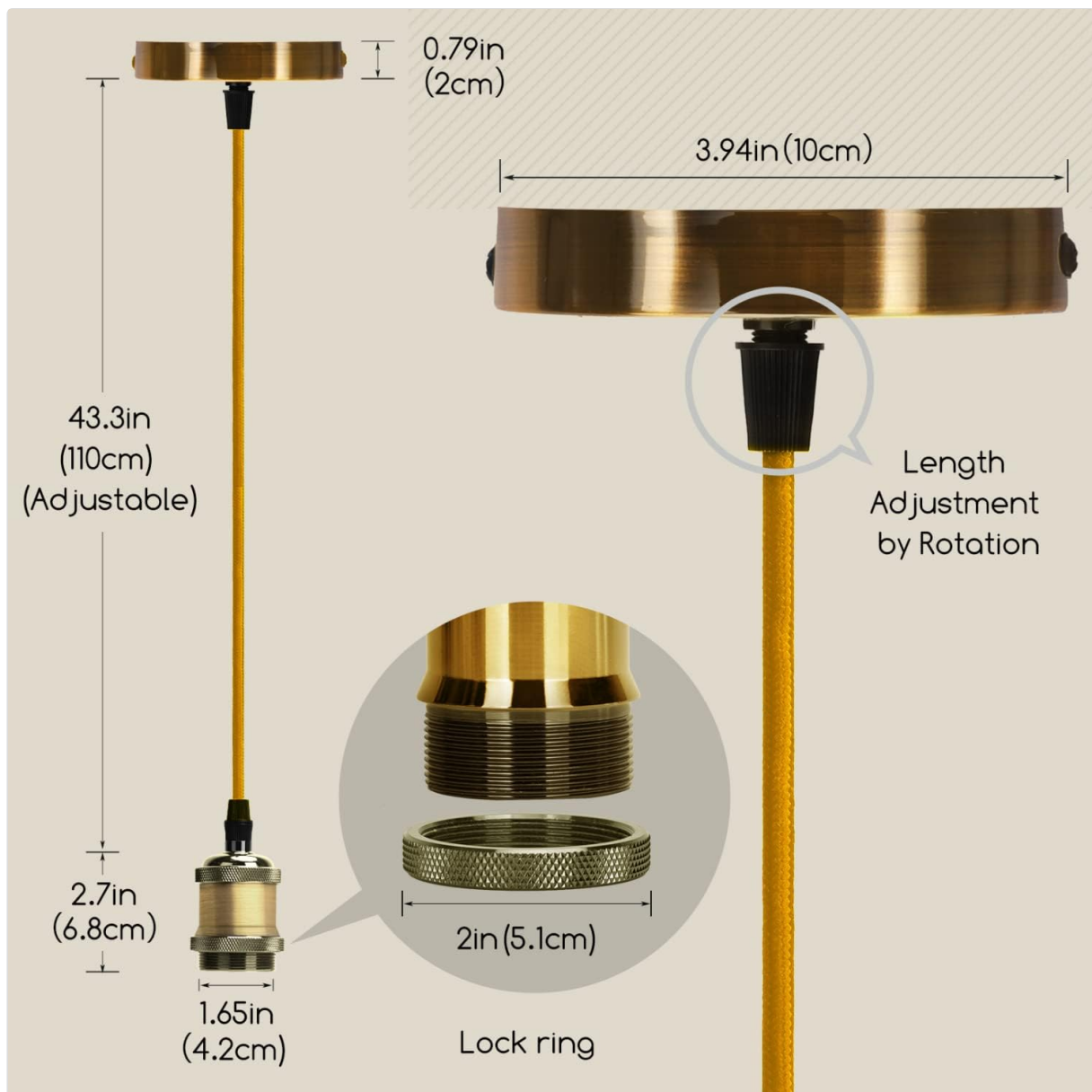
Figure 1: Product Dimensions and Adjustable Cable Mechanism