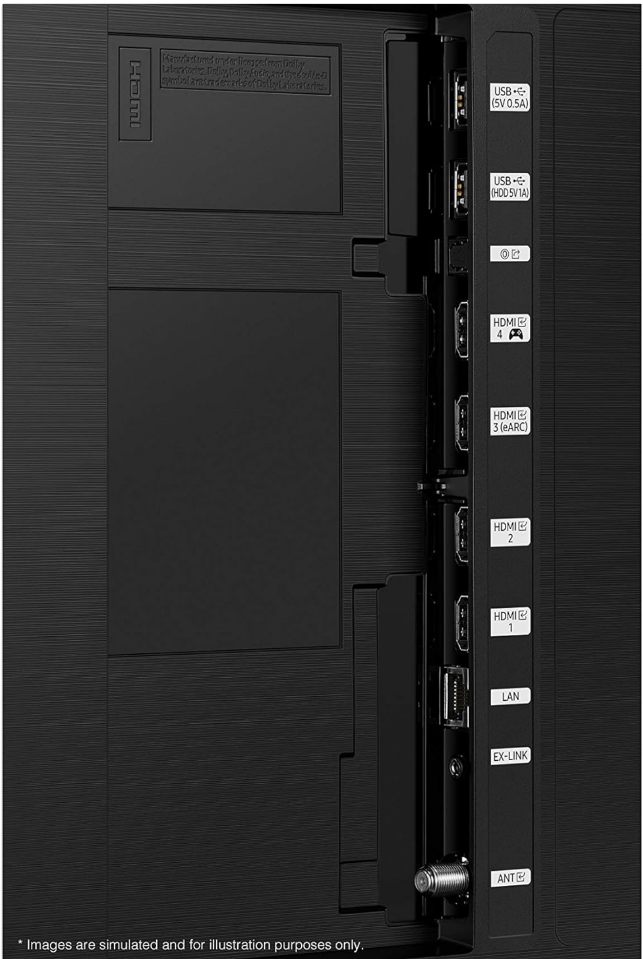
Image: Rear view of the TV's connection panel, showing multiple HDMI ports (including eARC), USB ports, LAN port, and antenna input.