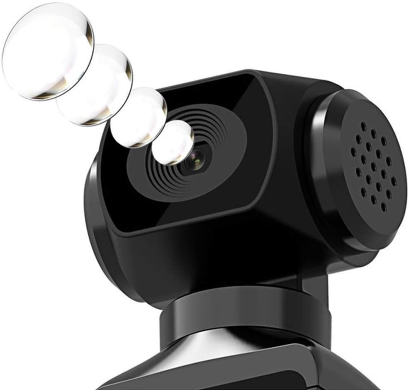
Figure 2.4: Close-up view of the Minolta MN4KP1's rotating lens head, emphasizing its optical components and design.