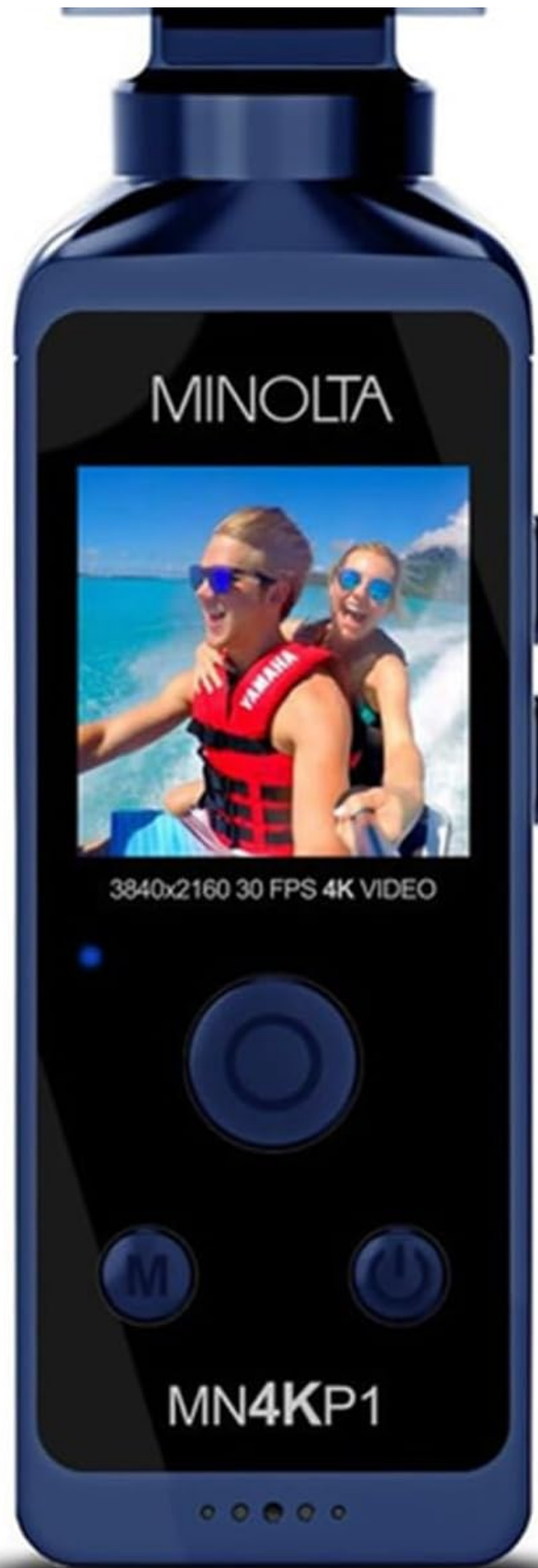
Figure 2.1: Front view of the Minolta MN4KP1 Pocket Camcorder. This image shows the main display, control buttons, and the rotating lens head.