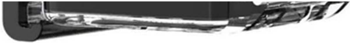
Figure 2.5: The Minolta MN4KP1 camcorder enclosed within its transparent waterproof housing, ready for aquatic use.