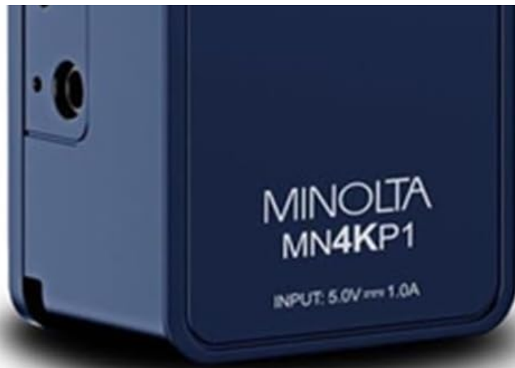
Figure 2.3: Rear view of the Minolta MN4KP1, showing the smooth back panel and charging input details.