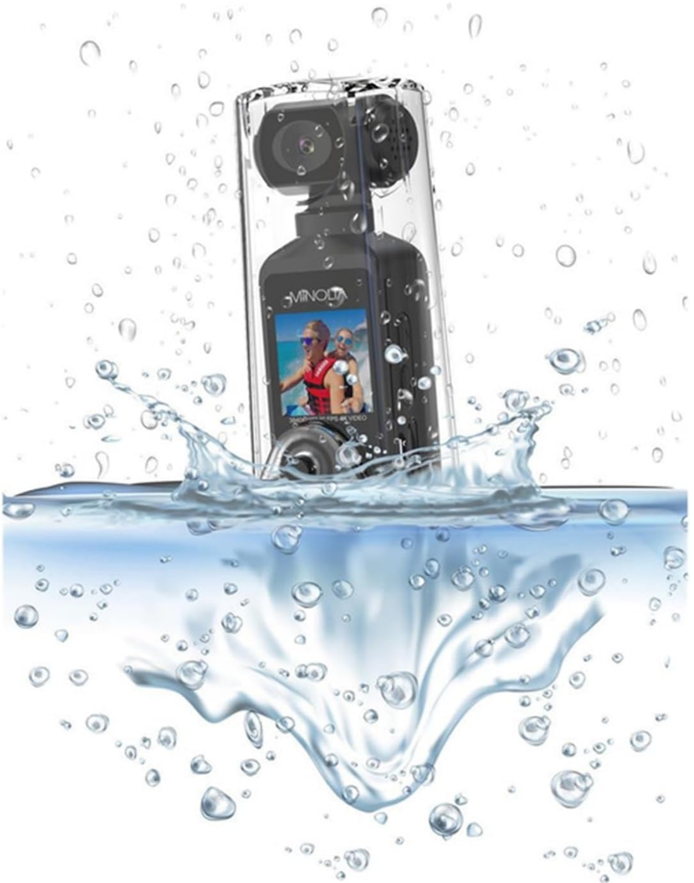
Figure 2.6: The Minolta MN4KP1 in its waterproof case, partially submerged in water, demonstrating its water resistance capabilities.