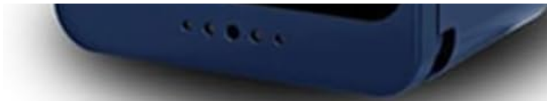
Figure 2.2: Side view of the Minolta MN4KP1, highlighting the various ports and side buttons for connectivity and control.