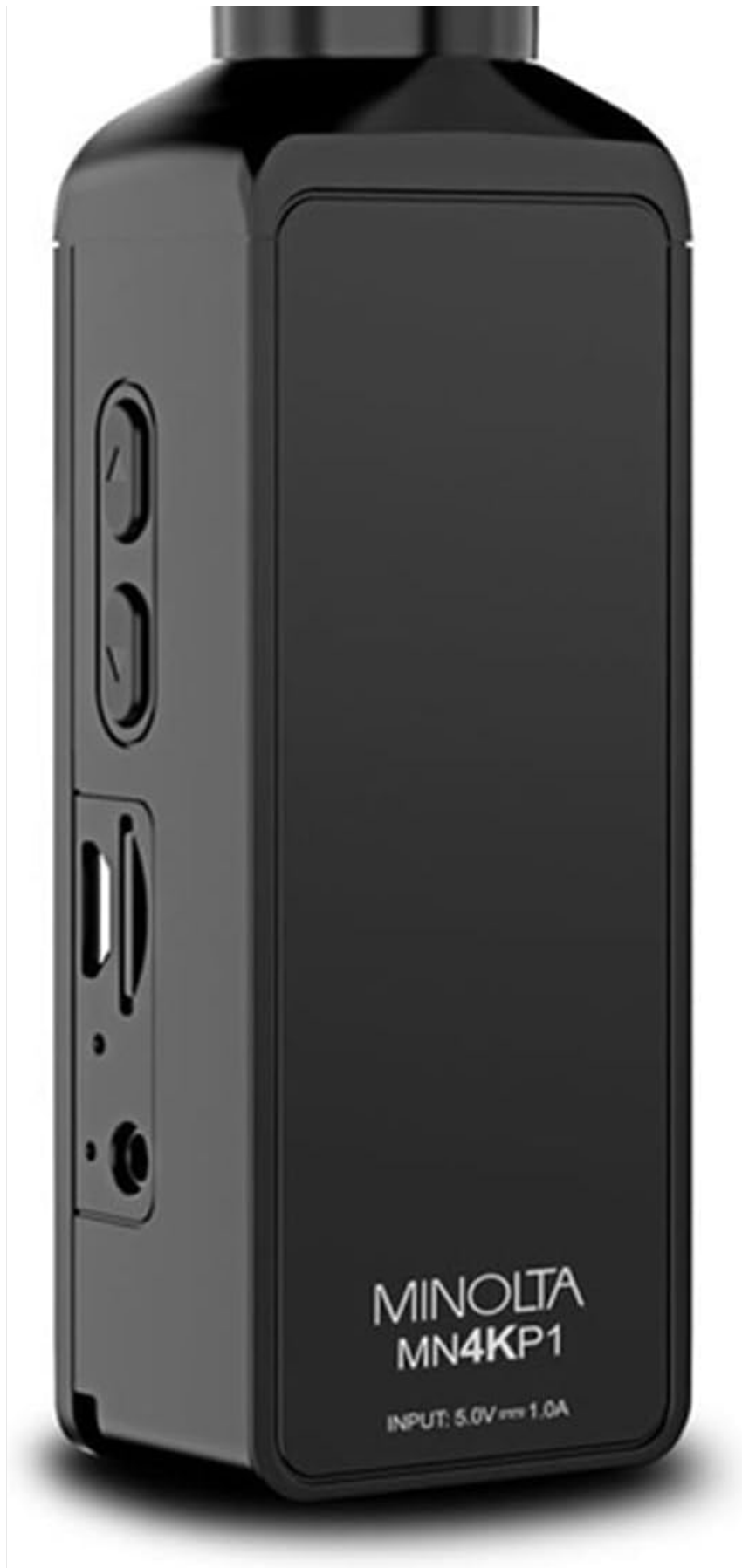
Back View: Displays product information and input specifications.

The camcorder features a compact body with a rotatable lens head. The front includes a 1.3-inch display for live view and playback, along with intuitive control buttons. The side houses essential ports for connectivity and storage.