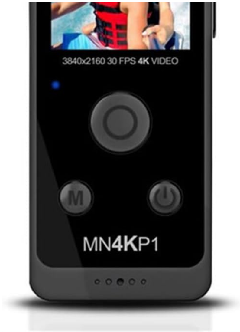
Front View: Features the main display, power button, mode button, and record button.