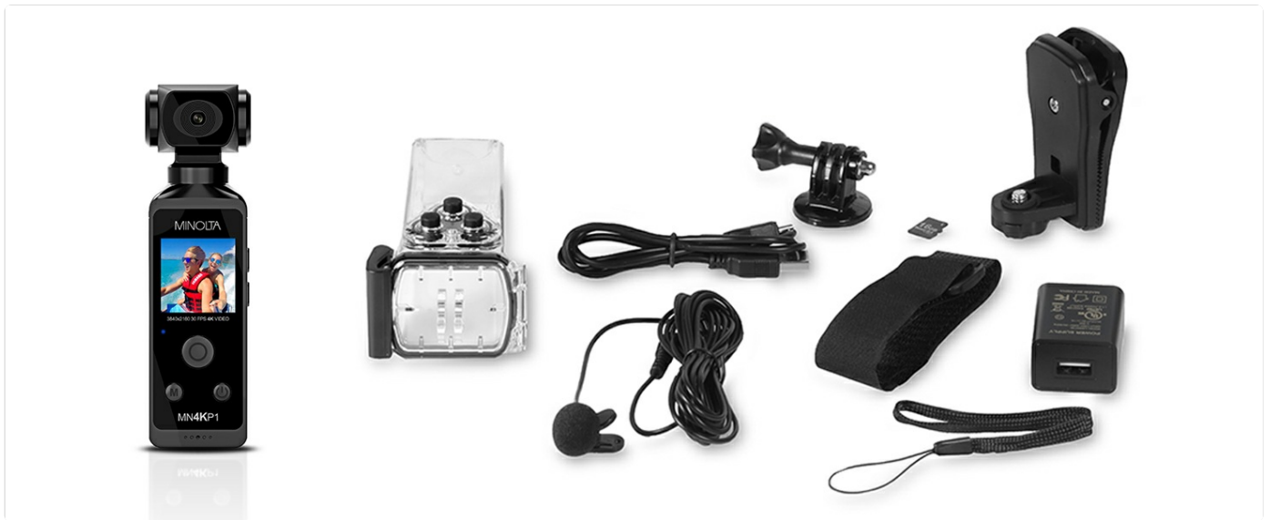
Image: All components included with the Minolta MN4KP1 Pocket Camcorder.