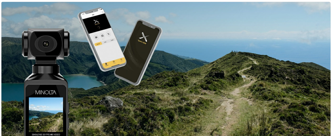
Image: Camcorder connected to a smartphone via the companion app.

The camcorder features built-in WiFi for wireless control and media management via a dedicated smartphone app. Download the official Minolta app from your device's app store. Follow the app's instructions to connect to the camcorder's WiFi network. This allows for remote control, live preview, and easy sharing of your captured content.