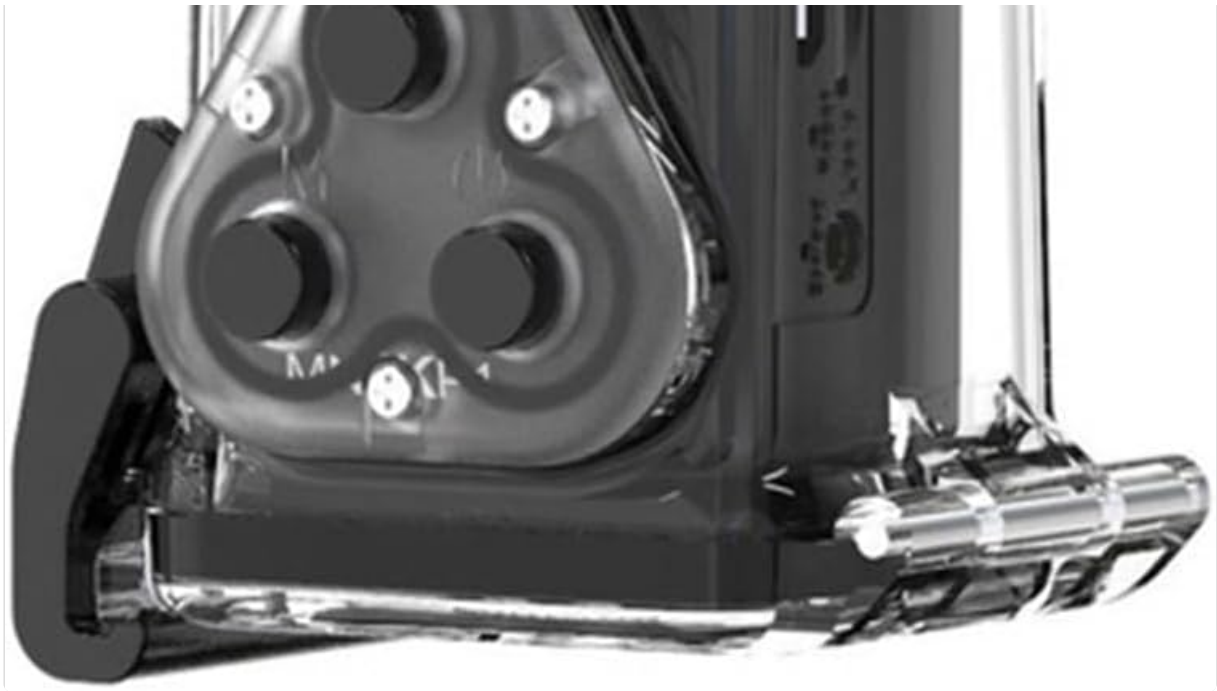
Image: The camcorder securely placed within its waterproof housing.