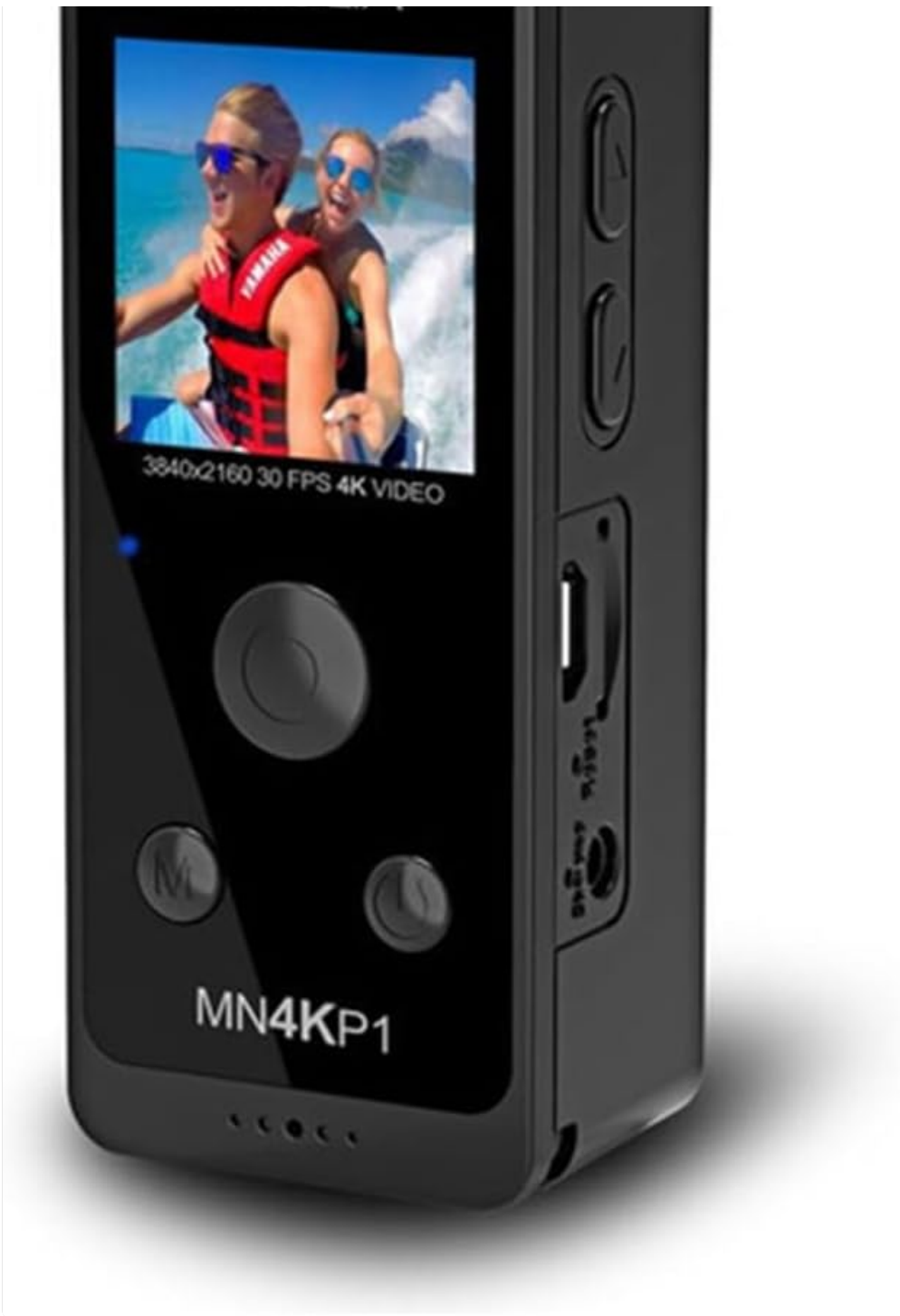
Side View: Includes the USB charging port, Micro SD card slot, and external microphone jack.