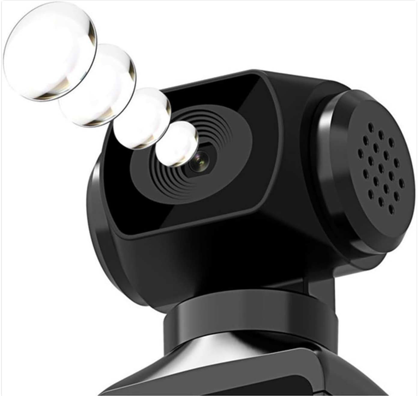
Image: Detail of the camcorder's wide-angle lens.

The camcorder features a 170° wide-angle lens, allowing you to capture a broader field of view, ideal for landscapes or group shots. The lens head can rotate 270°, providing flexibility to adjust your shooting angle without repositioning the entire camcorder. Ensure the lens is rotated to your desired position before sealing the camcorder in the waterproof case.