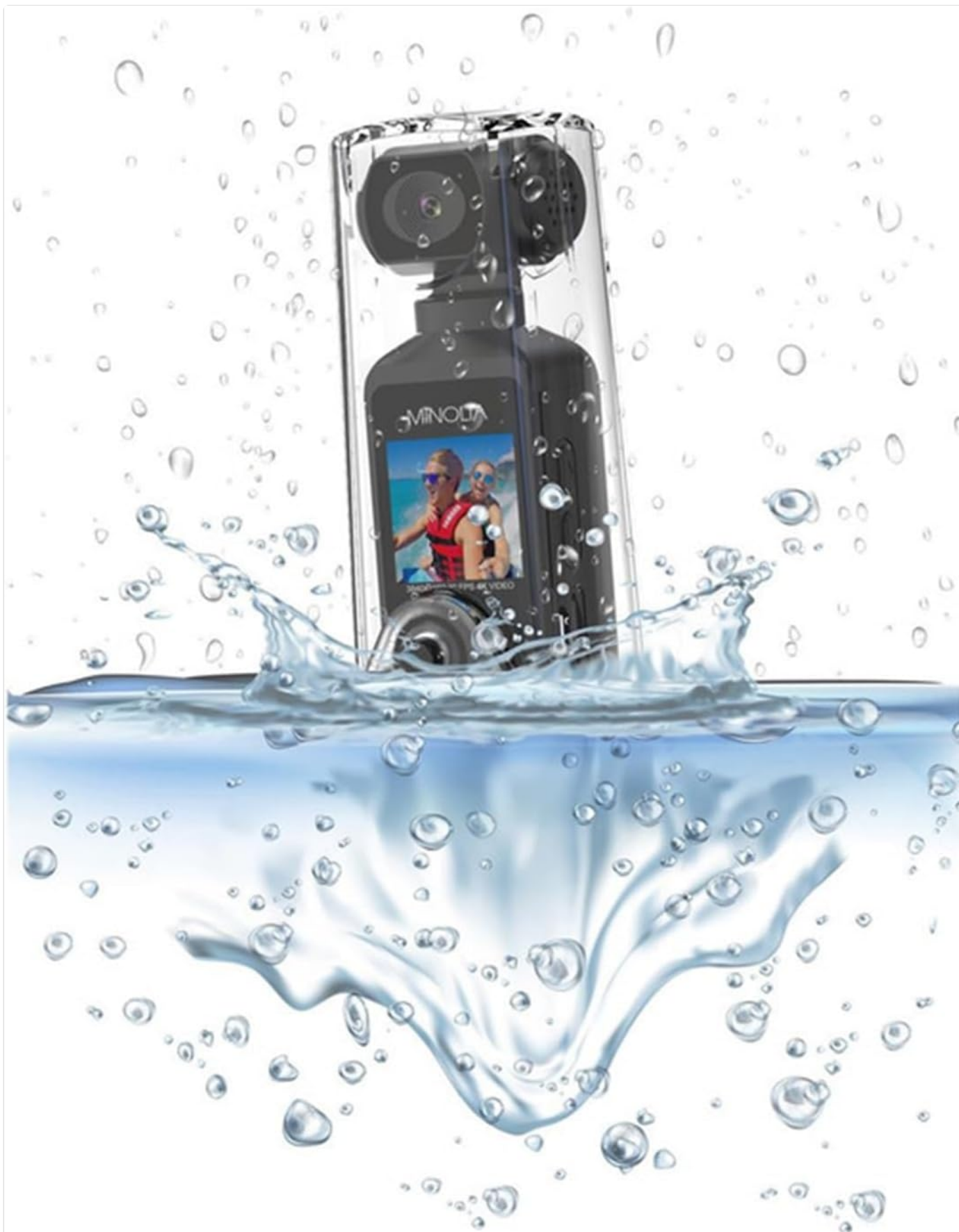
Image: The camcorder in its waterproof case, demonstrating its water resistance.