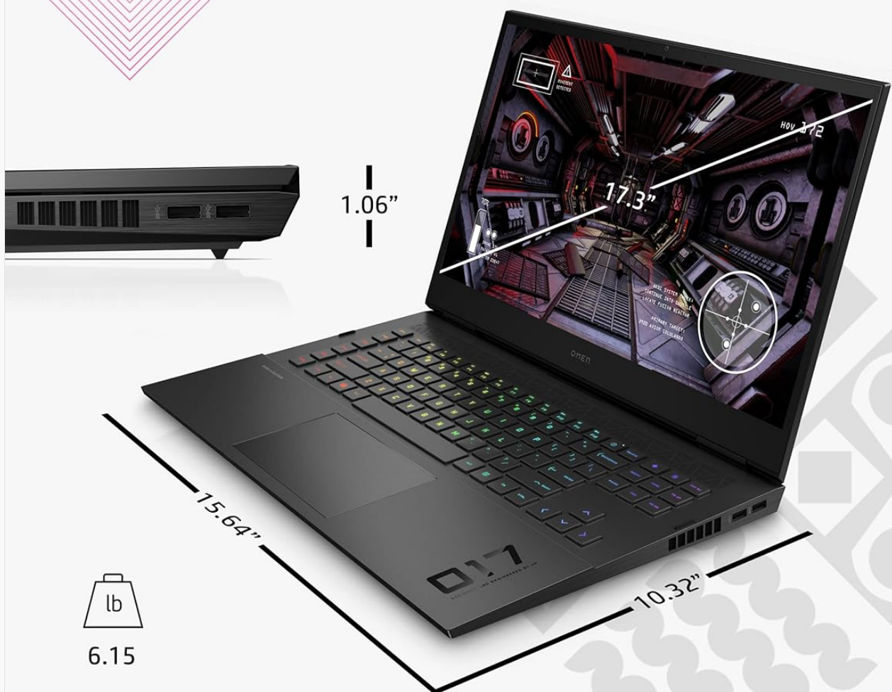
Image 4.2: Close-up of the RGB backlit keyboard and overall laptop dimensions.

This full-size keyboard is precision-designed for competitive gameplay. RGB per-key LED backlighting customization and N-key rollover anti-ghosting technology to never miss a key.