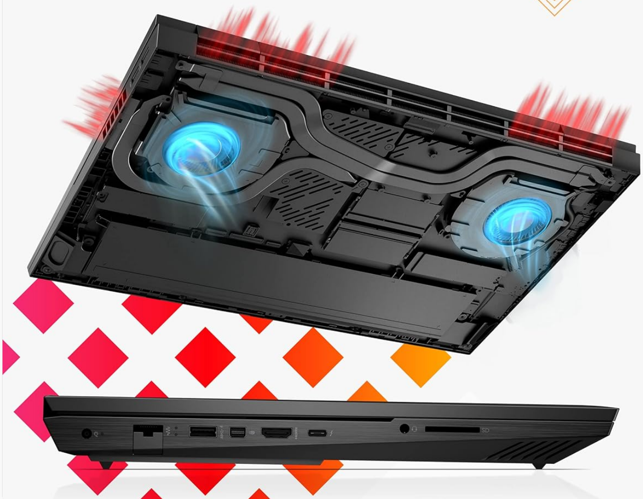
Image 4.3: View of the OMEN Tempest Cooling system, highlighting the fan and vent design.

Stay cool under pressure with the advanced laptop thermal solution. 3-sided venting and 5-way airflow ensure optimal system stability and performance when gameplay heats up.