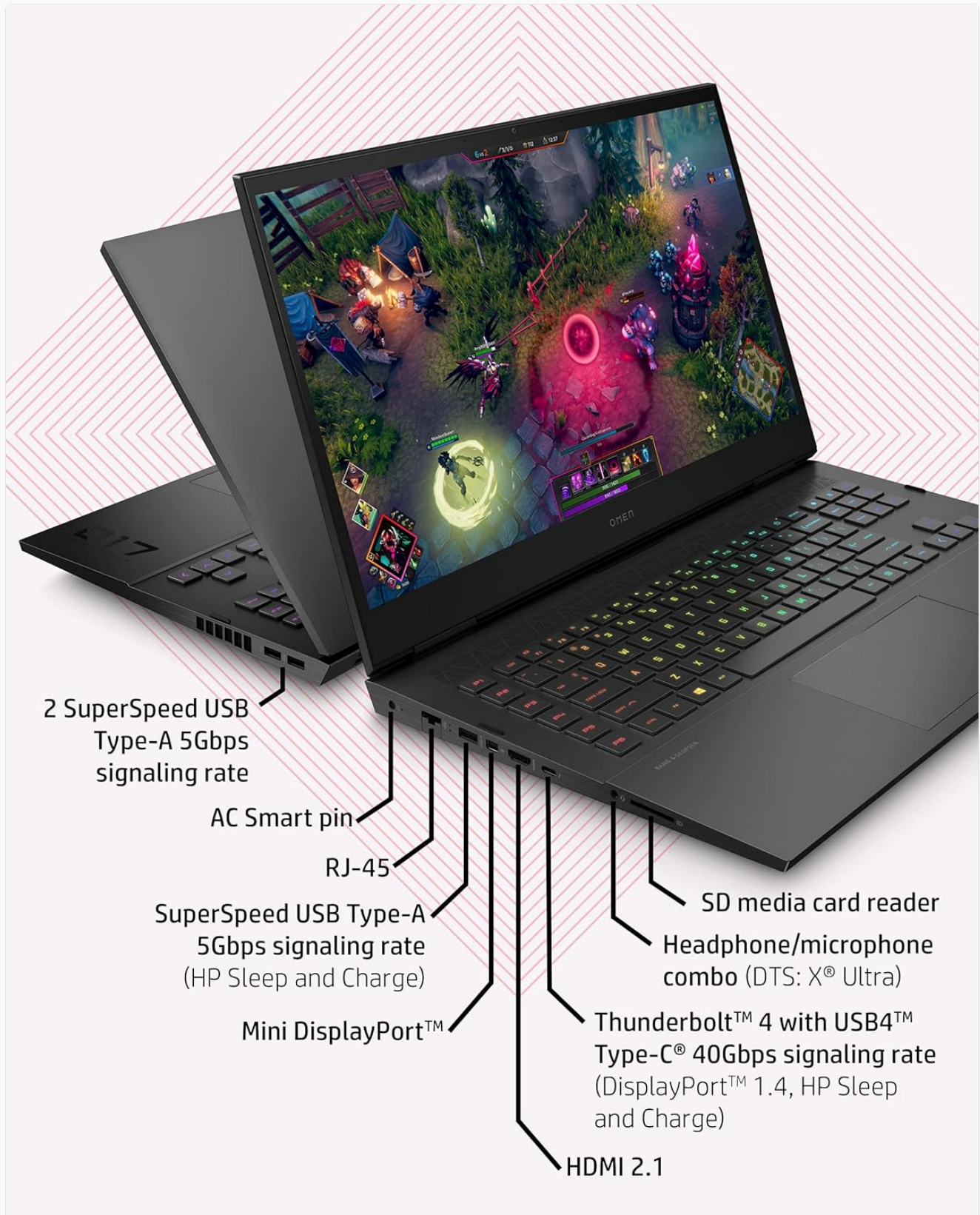
Image 3.1: Detailed view of the laptop's side ports, including USB, HDMI, Mini DisplayPort, Ethernet, and audio jacks.

Familiarize yourself with the available ports for connecting peripherals and external devices.