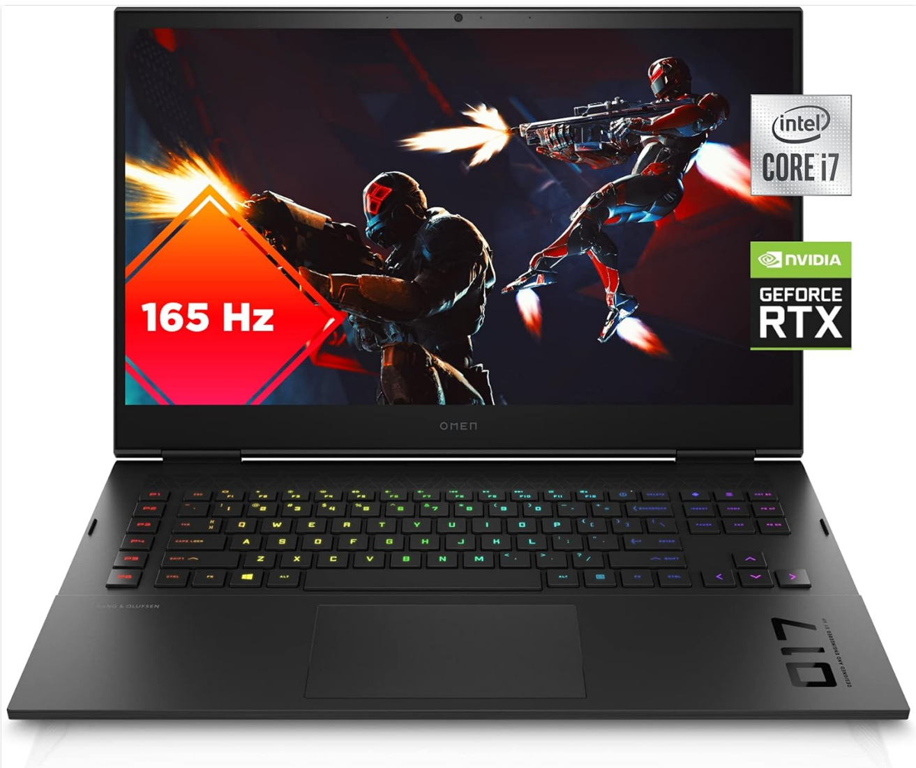
Image 1.1: Front view of the HP Omen 17 Gaming Laptop, showcasing its display and keyboard.