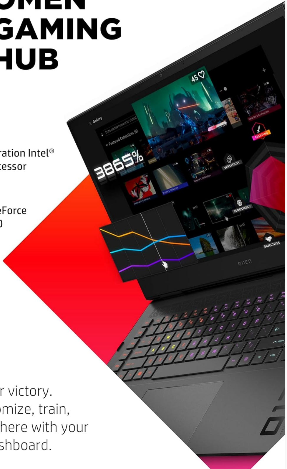
Image 4.5: The OMEN Gaming Hub interface, showing performance monitoring and customization options.

Your setup. Your victory. Your way. Customize, train, and win everywhere with your new gaming dashboard.