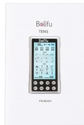
User Manual X 1pc