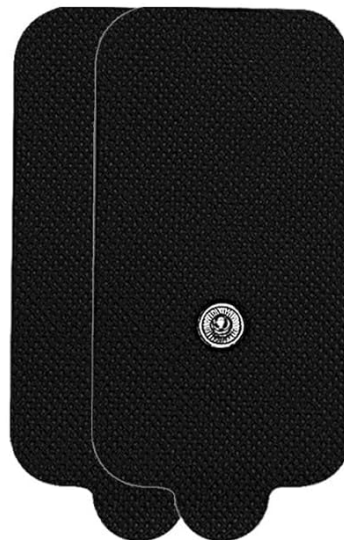
Large Pad X 2pcs