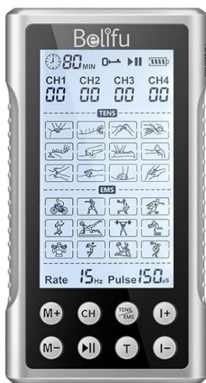
Device X 1pc