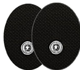
Small Pad X 2pcs