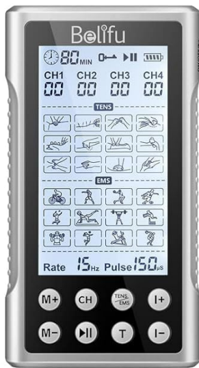
Device X 1pc