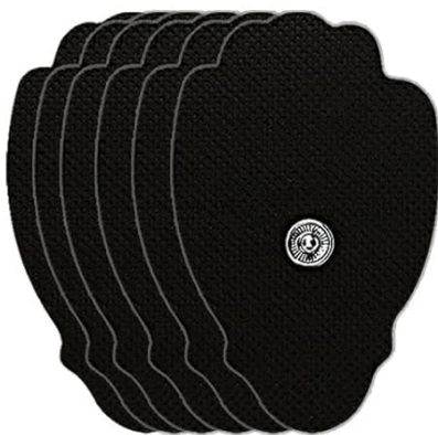
Medium Pad X 6pcs