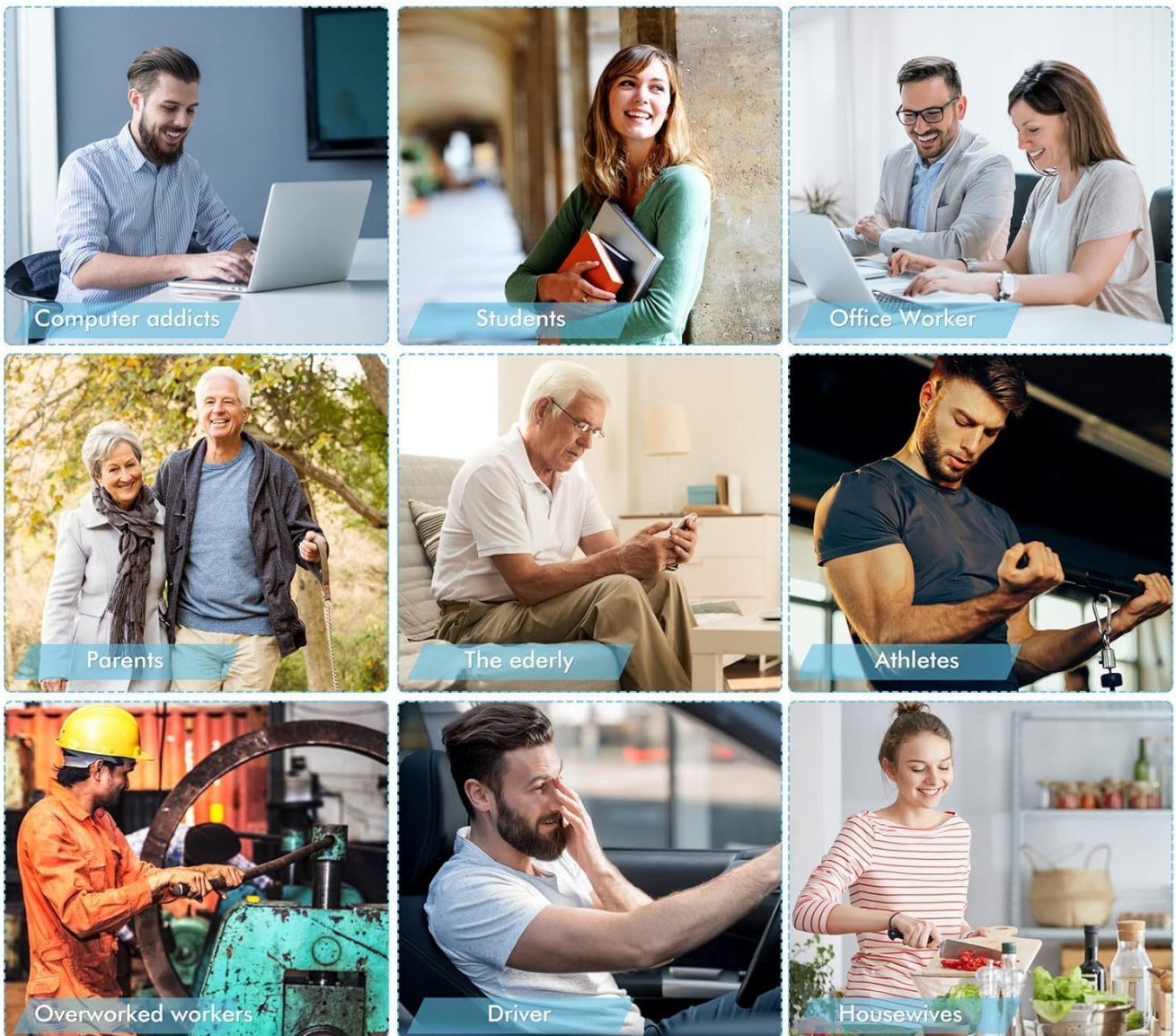
Figure 1: Applicable areas for the Belifu TENS EMS Unit.