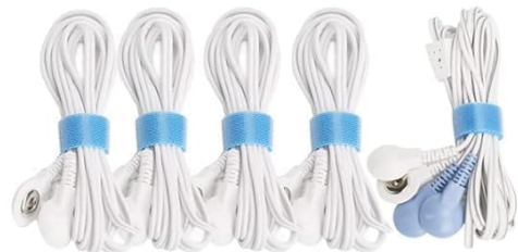
Electric Wire X 5pcs