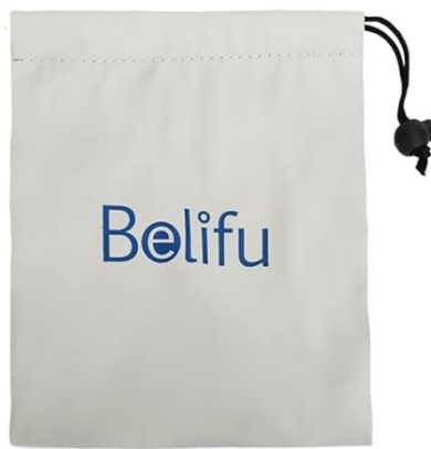
Bag X 1pc