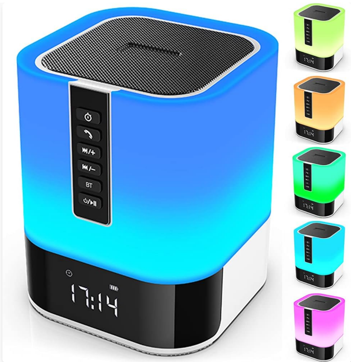
The Hetyre 5-in-1 Night Light Bluetooth Speaker, showcasing its multi-color lighting capabilities.