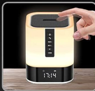
Tap twice soft