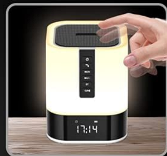
Tap three times brightest