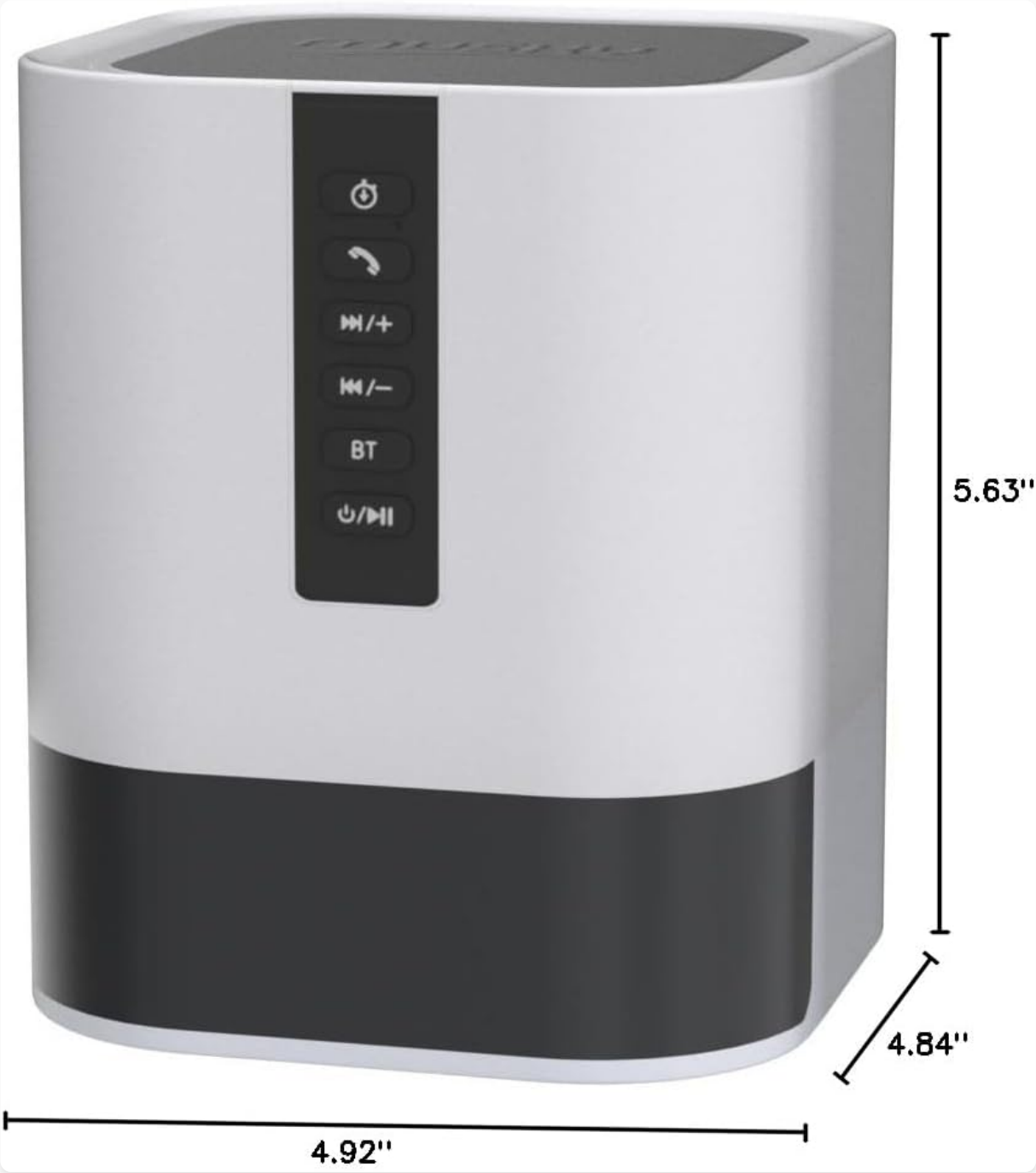
Product dimensions for placement and reference.