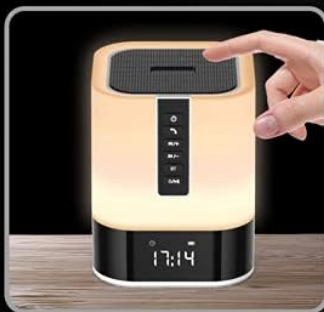
Tap once dim