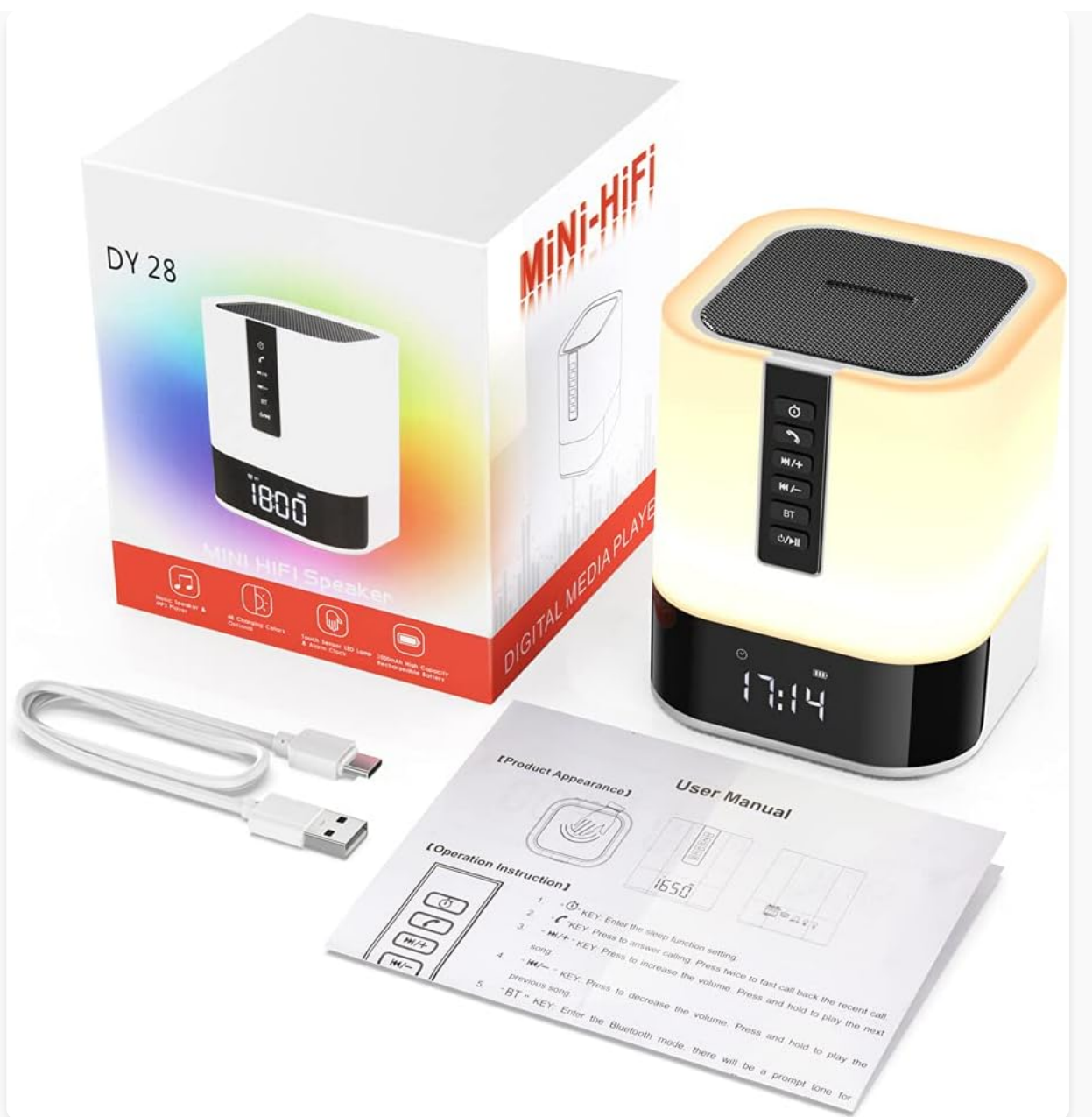
The product packaging and included accessories.