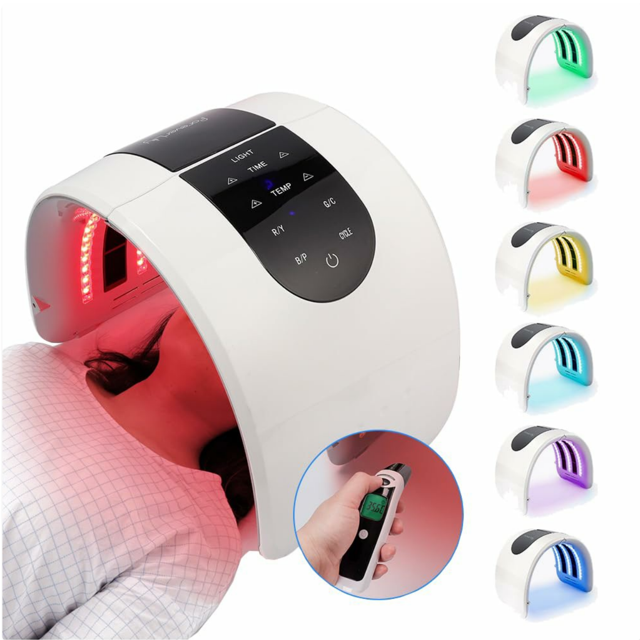
Image 1: The foreverLily Face Skin Care Machine in use, demonstrating its design and remote control.