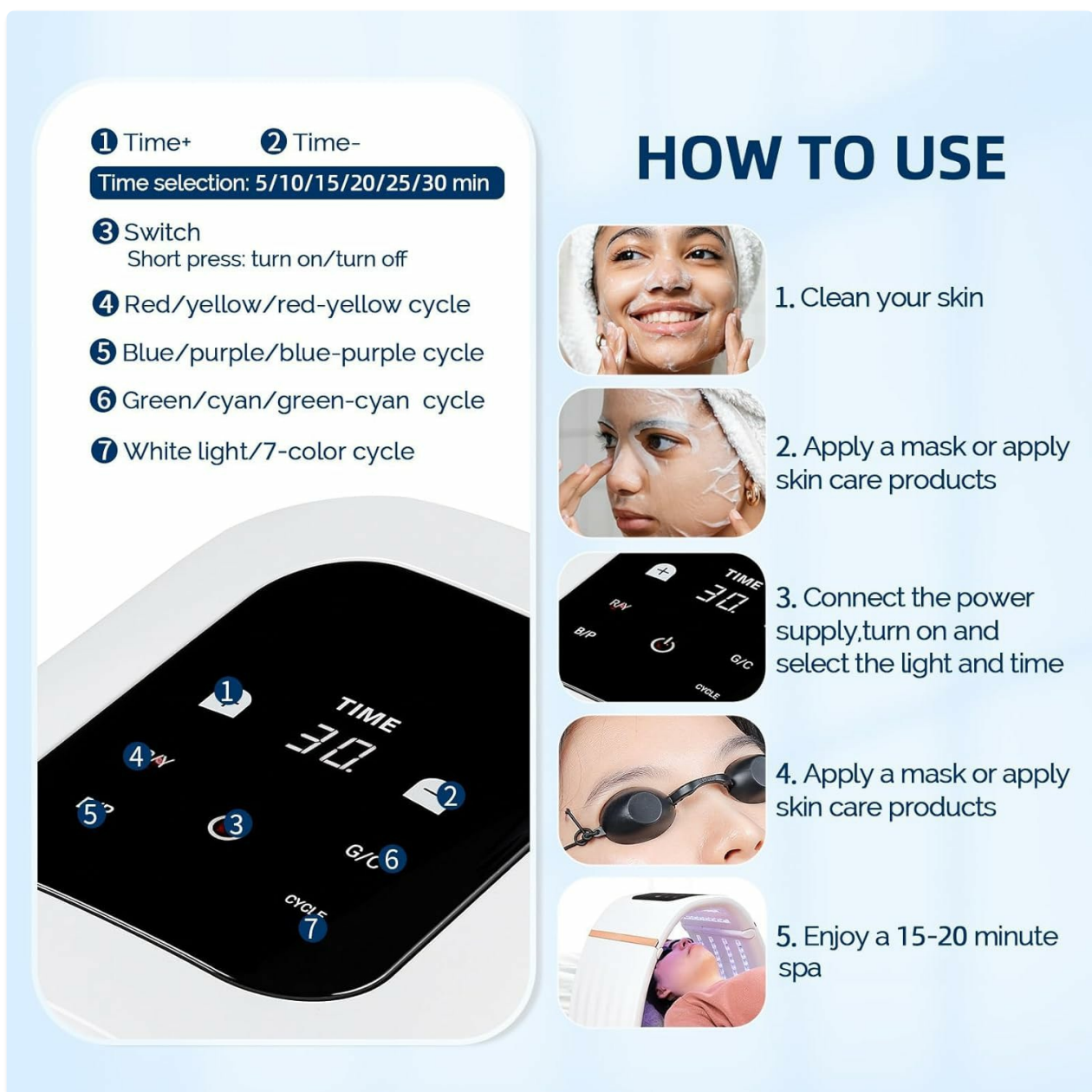
Image 4: A visual guide detailing the usage steps, from skin preparation to enjoying the treatment.