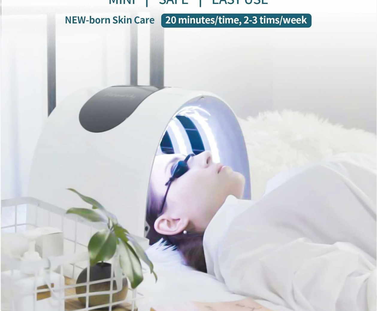
Image 3: The device positioned for use, highlighting its ergonomic design for home or salon settings.

NEW-born Skin Care 20 minutes/time, 2-3 tims/week