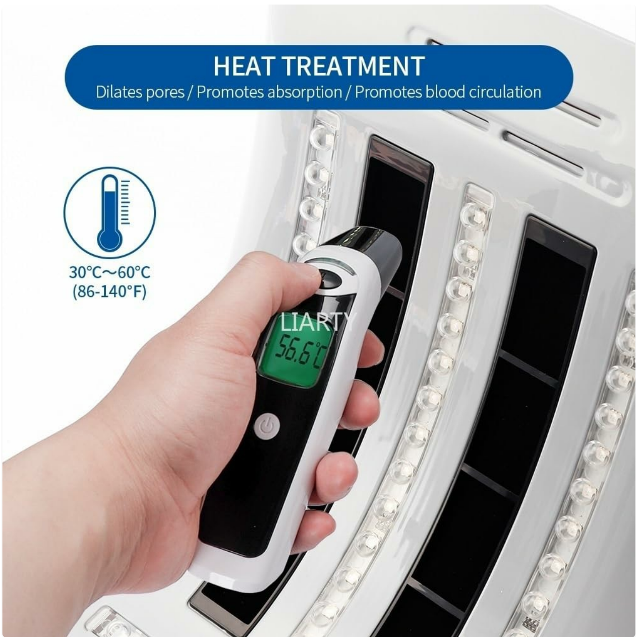
Image 7: Detail of the heat treatment feature, showing temperature control via the remote.