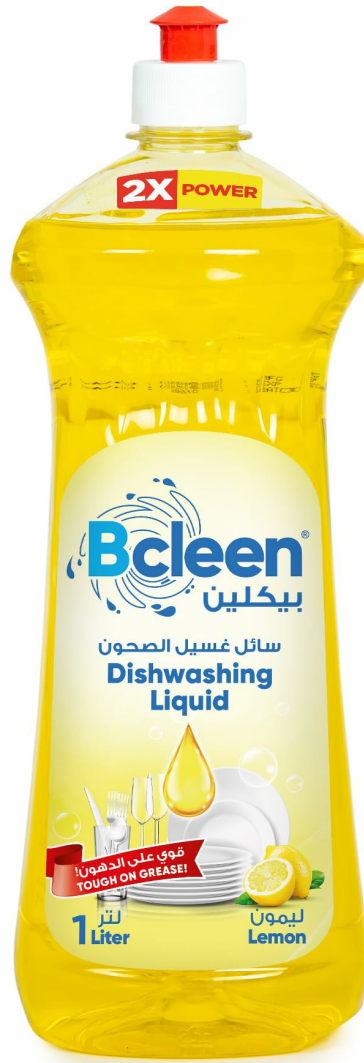
Image 1: Front view of Bcleen Dishwashing Liquid, Lemon, 1 Liter bottle.