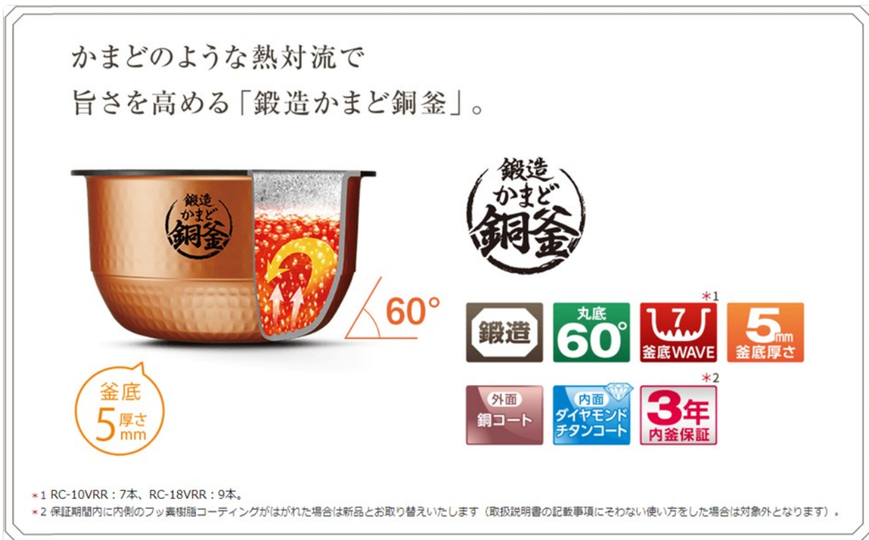
Figure 7: Forged Kamado Copper Pot design.