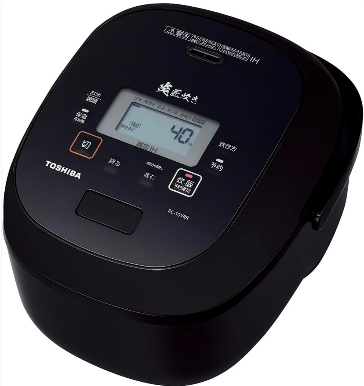
Figure 1: TOSHIBA RC-10VRR 5.5-Cup Vacuum IH Rice Cooker.