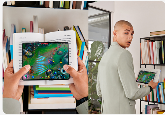
Image: The large display of the Galaxy Z Fold3 5G provides an expansive viewing experience.

See more and do more with the ultimate foldable screen that puts a super slim tablet right in your pocket.