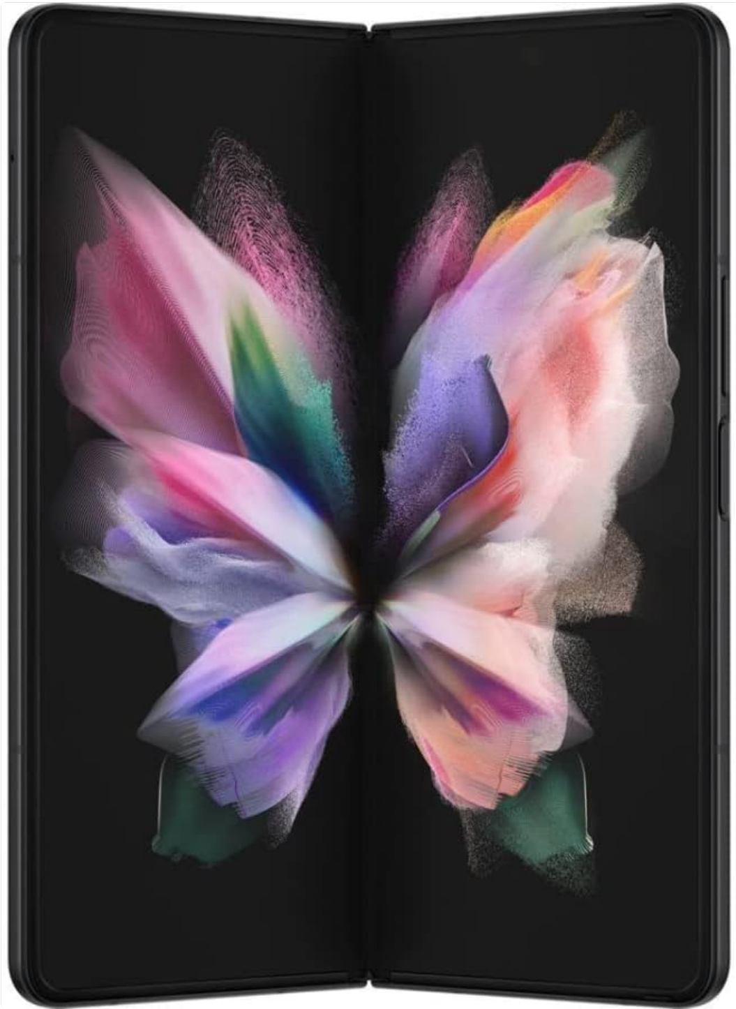
Image: Samsung Galaxy Z Fold3 5G unfolded, showcasing its main display.