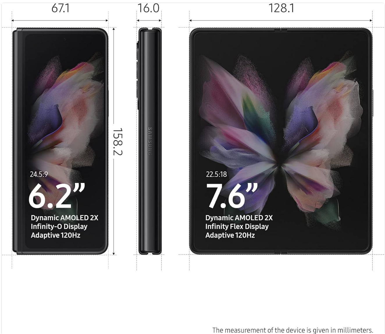
Image: Physical dimensions of the Samsung Galaxy Z Fold3 5G.