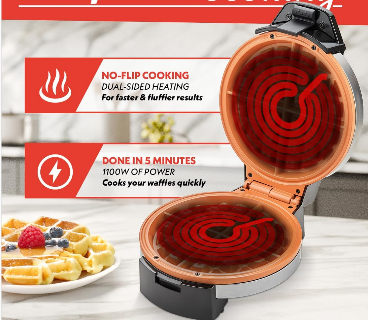
Image: The interior of the Gourmia GWM448 Belgian Waffle Maker, highlighting the dual-sided heating elements for even cooking.

DONE IN 5 MINUTES 1100W OF POWER Cooks your waffles quickly