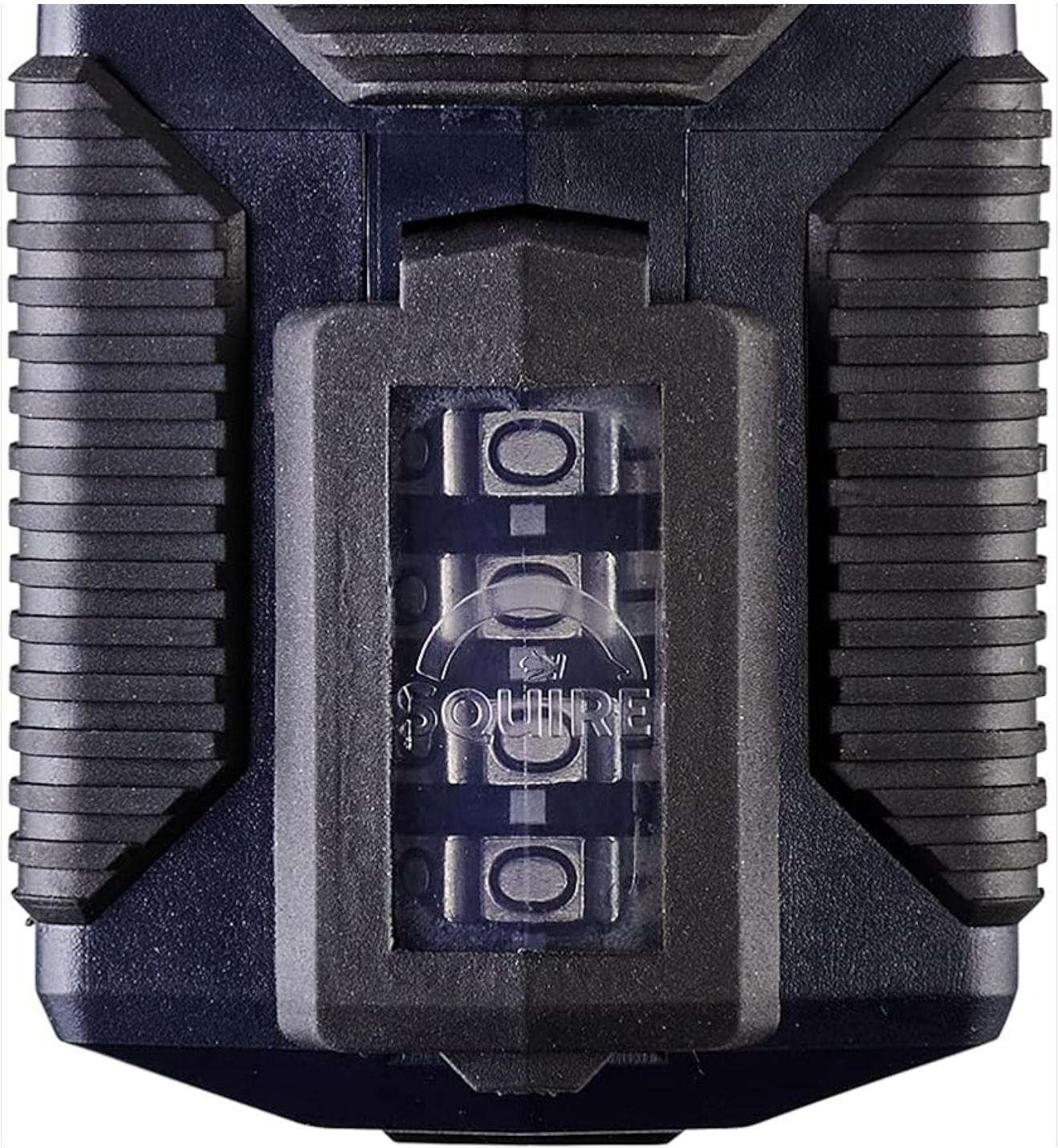
Figure 1: Front view of the SQUIRE CP50S All Terrain Combination Padlock, highlighting its robust construction and visible combination wheels.