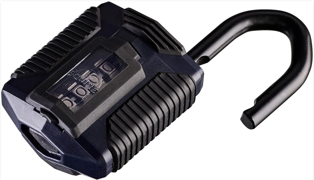
Figure 3: The padlock with its shackle in the open position, illustrating the state required for combination resetting.