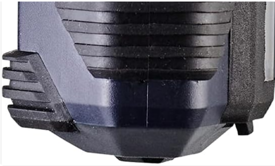
Figure 4: Side view of the SQUIRE CP50S padlock, showcasing its ergonomic design and protective features.