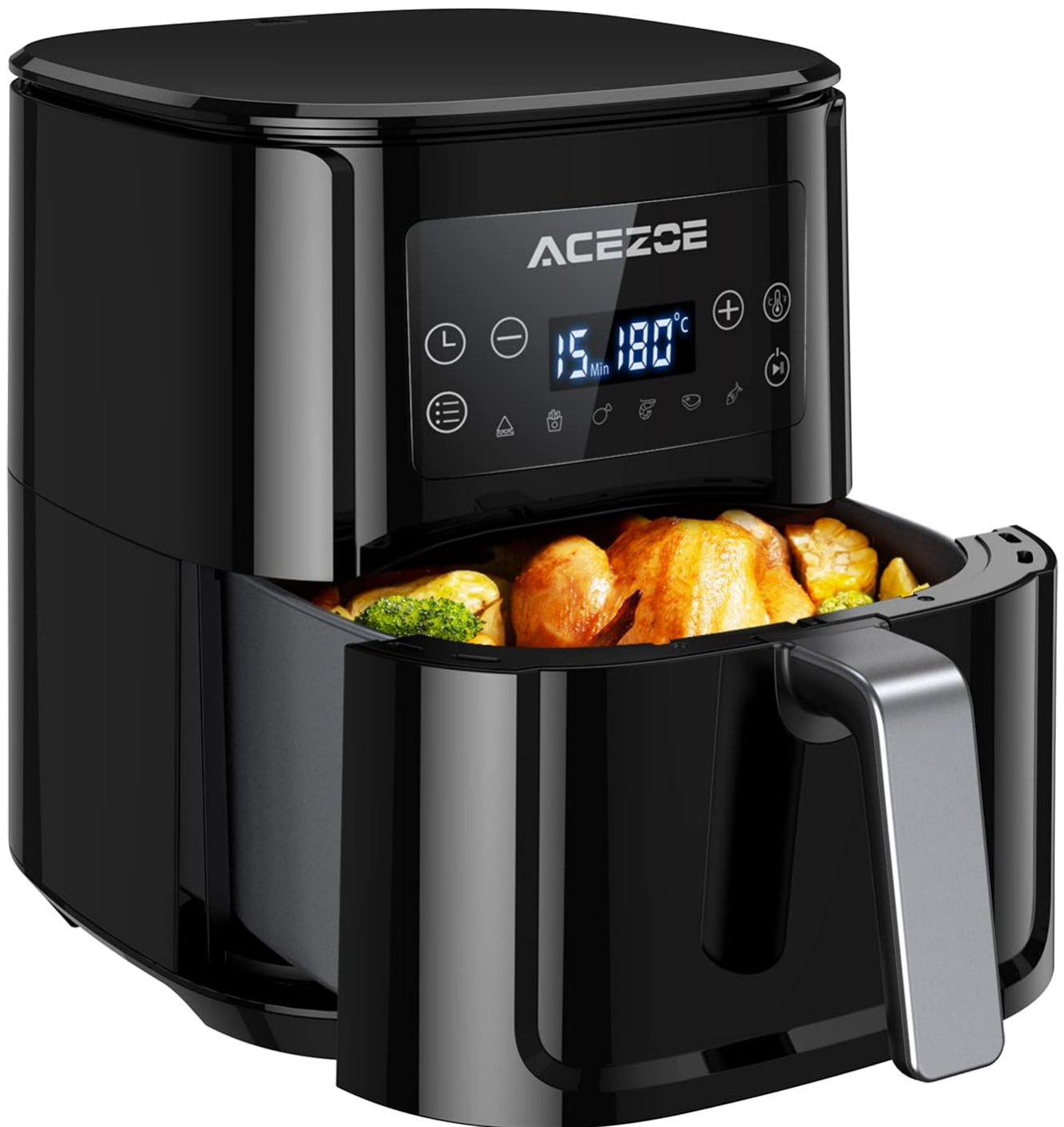
Figure 1.1: Acezoe 5.5L Air Fryer. This image shows the sleek black design of the air fryer with its digital display and the cooking basket containing a whole chicken and various vegetables.