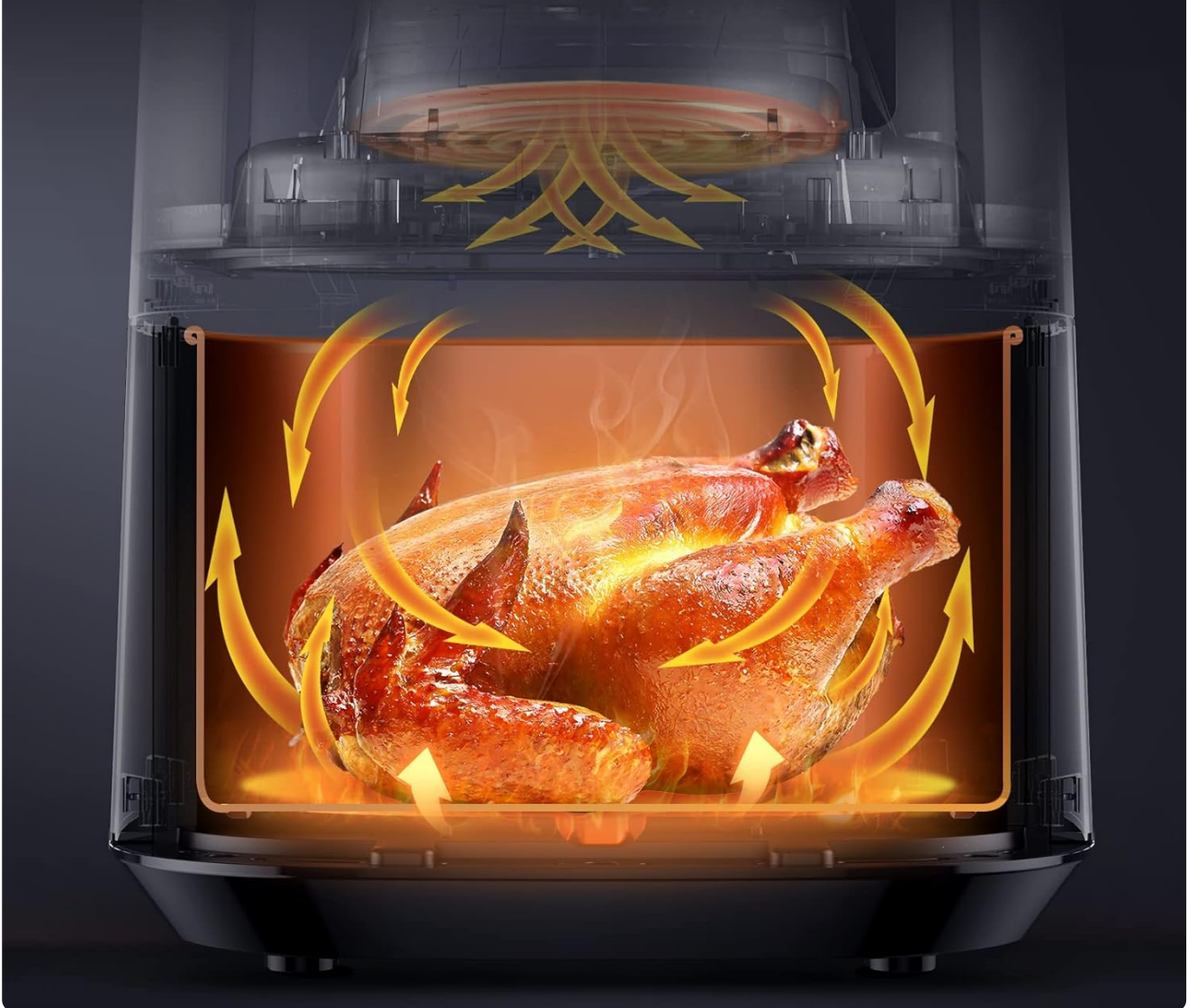
Figure 6.1: 360° Hot Air Circulation. This diagram shows how hot air circulates rapidly and evenly around the food in the air fryer, ensuring thorough and consistent cooking.

1700 W höhere Leistung zum schnellen und gleichmäßigen Erhitzen von Speisen