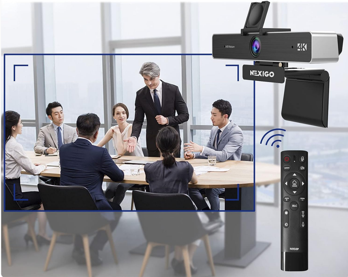
Image: Detailed layout of the NexiGo N950P remote control, highlighting various function buttons including zoom, volume, and privacy controls.

Remote control allows you to easily zoom in or adjust the camera view.