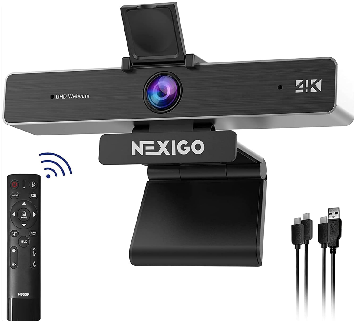
Image: The NexiGo N950P webcam, showing its adjustable clip, remote control, and included USB-A and USB-C cables.