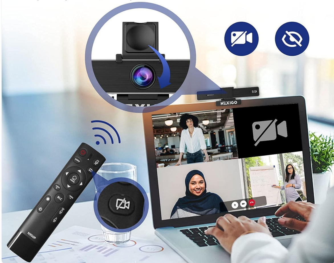
Image: Shows the physical privacy cover and the remote control button for instantly stopping the video feed, ensuring ultimate privacy.

The remote control has a button to stop your video feed, instantly cutting off your view if something unexpected happens. The included privacy cover blocks your webcam when the webcam is off.