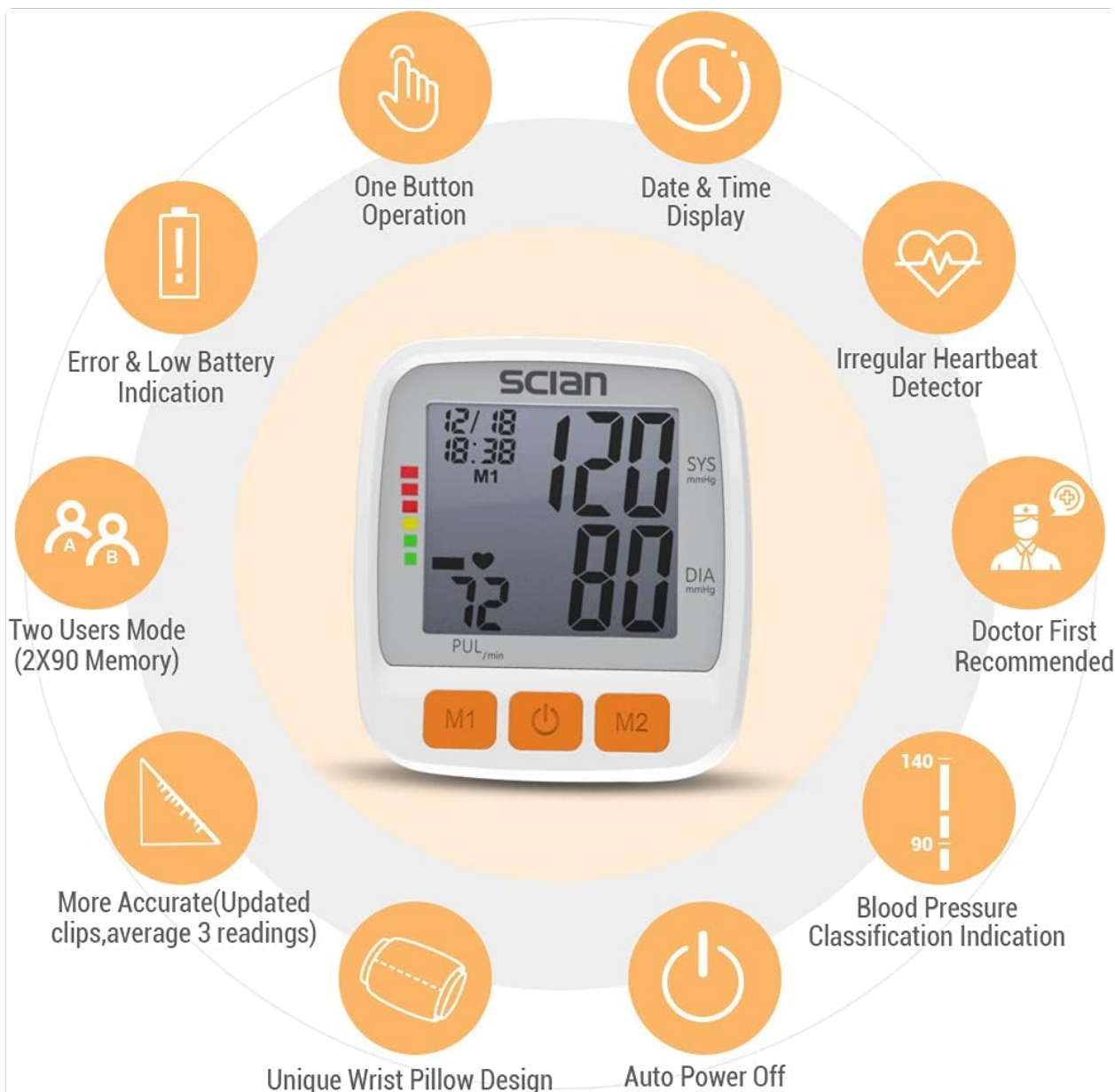
Image 1.1: Overview of the Scian LD 753 Wrist Blood Pressure Monitor and its main features.