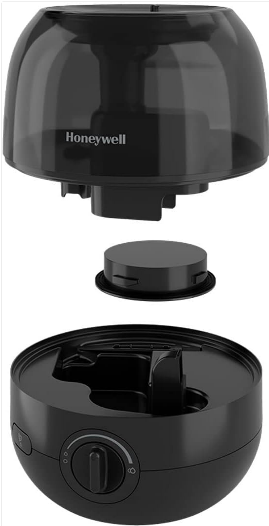
Figure 4: Humidifier components separated for thorough cleaning.