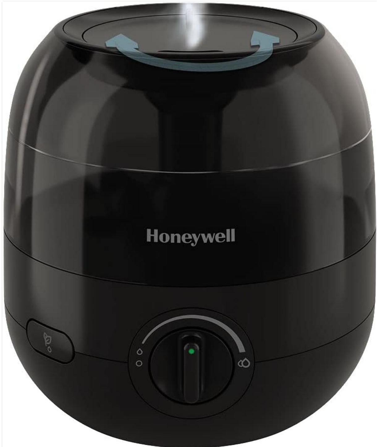
Figure 2: The humidifier in operation, emitting cool mist.