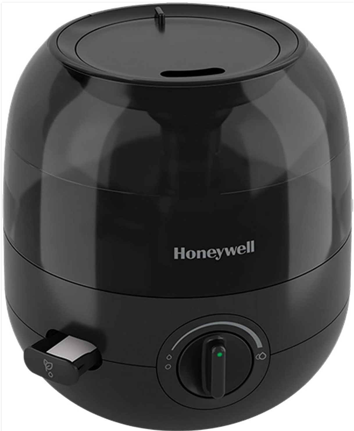
Figure 3: Essential oil tray location and usage.