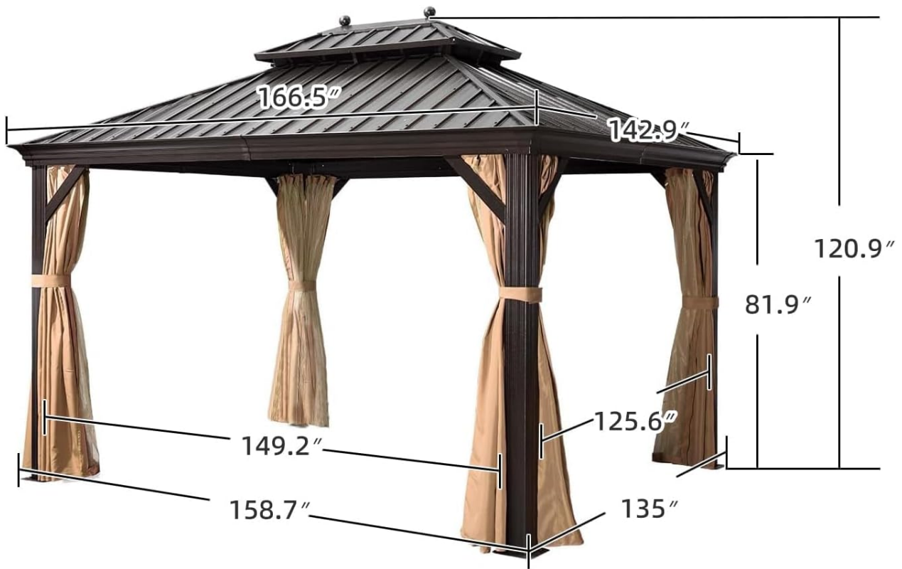
Image: The integrated hooks provide convenient points for hanging decorative elements or lighting fixtures.