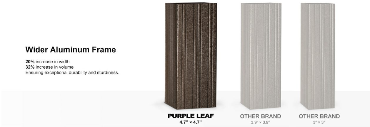
Image: Visual comparison highlighting the increased width and volume of the PURPLE LEAF gazebo's aluminum columns for enhanced durability.