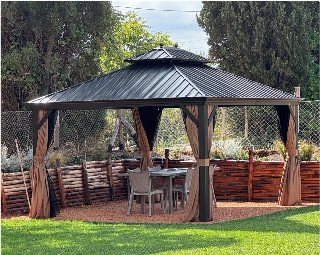
Image: The PURPLE LEAF 12' X 14' Hardtop Gazebo providing shade and shelter in an outdoor environment.