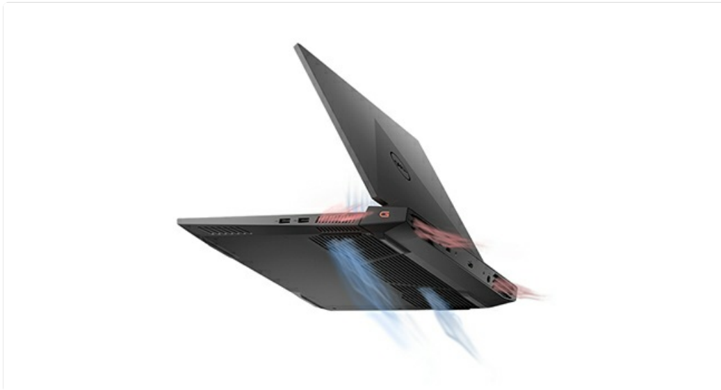
Image: Internal view of the Dell G15 5511's thermal cooling system.

The laptop's thermal design incorporates a dual air-intake system that expels air through four vents (located on the sides and rear) to maximize airflow. This design helps keep components cooler and maintain higher clock speeds during demanding applications.