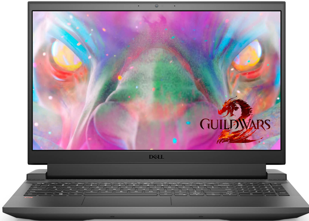
Image: Dell G15 5511 Gaming Laptop, showcasing its display with a game.