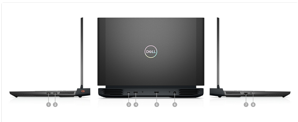
Image: Port layout of the Dell G15 5511 Gaming Laptop.

The Dell G15 5511 offers a variety of ports for connectivity: