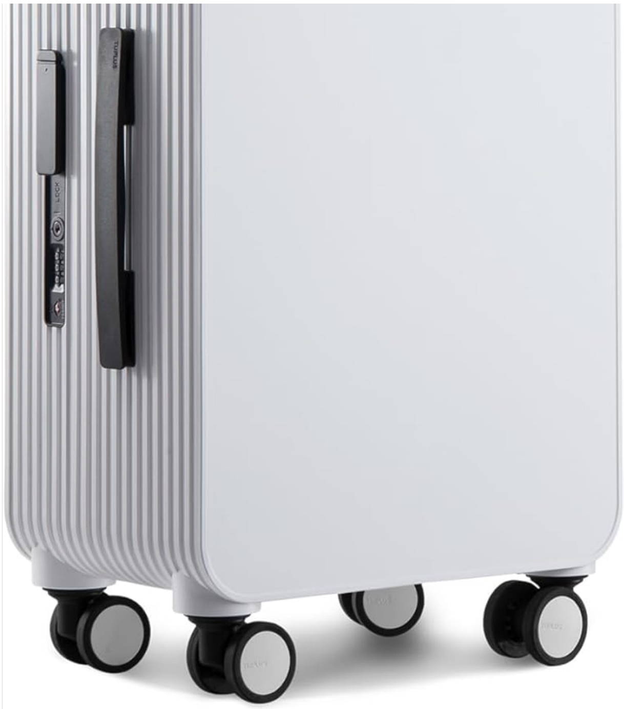
Figure 1: Front view of the TUPLUS Balance Series 20-Inch Carry-On Suitcase.