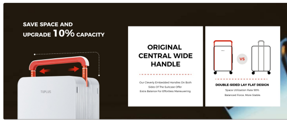
Figure 2: The unique wide handle design provides extra balance and a flat top surface when retracted.