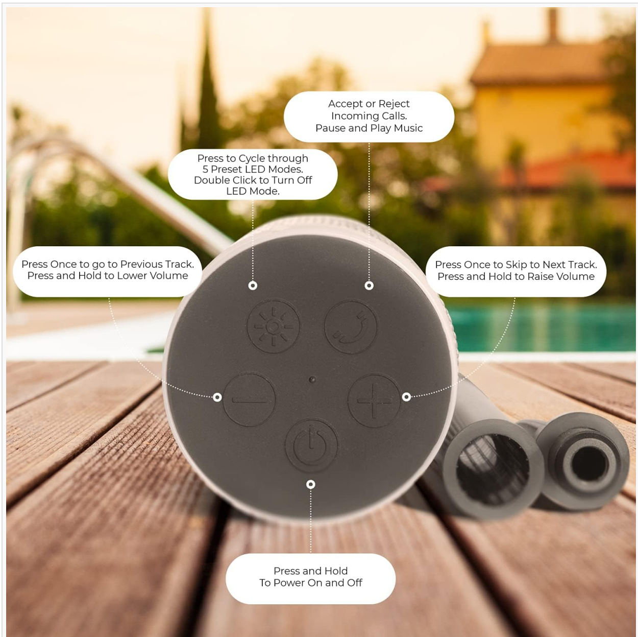
Figure 4: Control buttons on the top of the speaker.