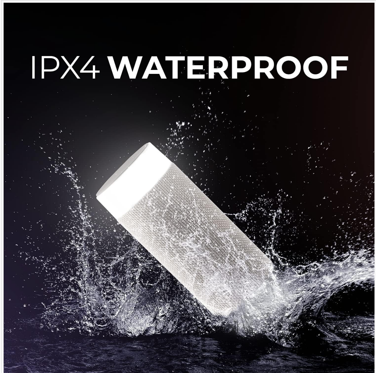
Figure 6: The speaker's IPX4 waterproof feature.