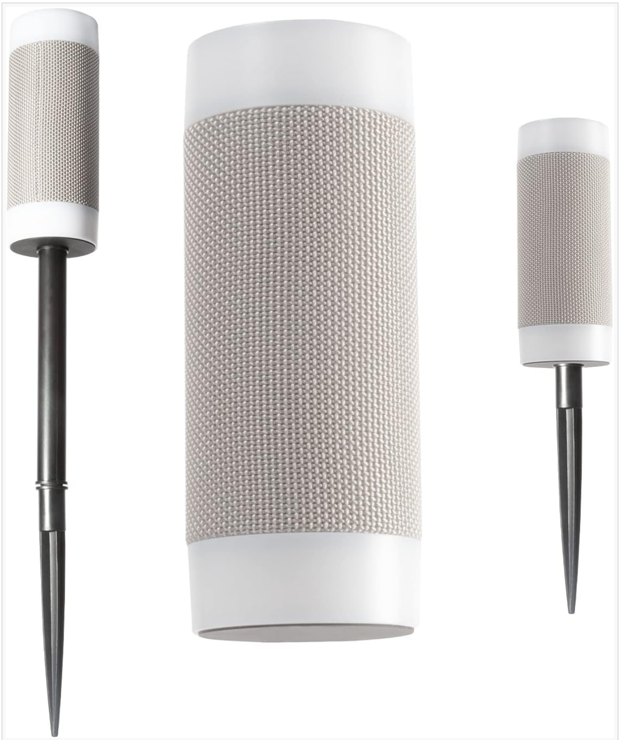
Figure 1: iJoy Wireless Speaker with adjustable stake for outdoor placement.