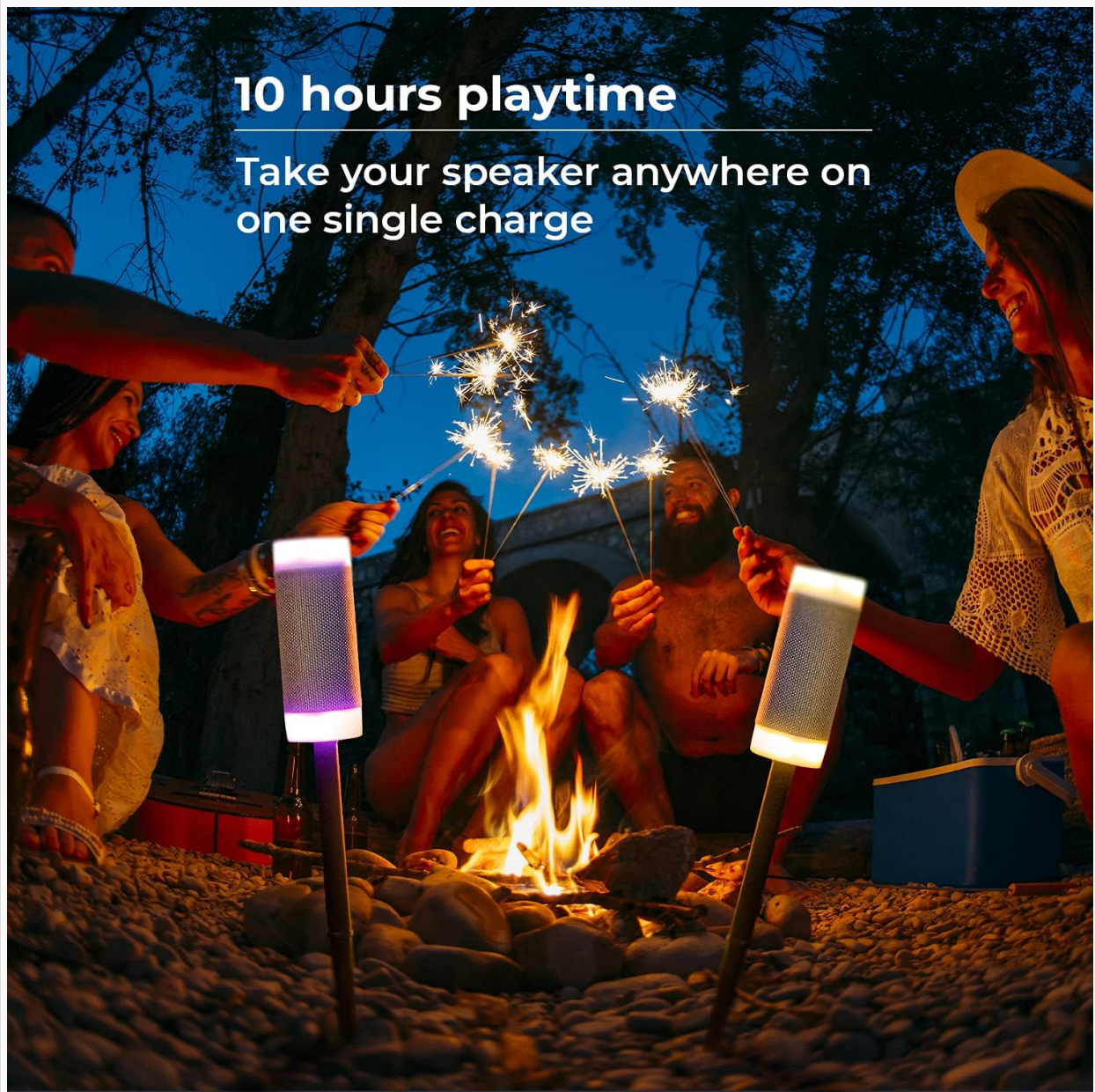
Figure 5: Speakers showcasing various LED light options.