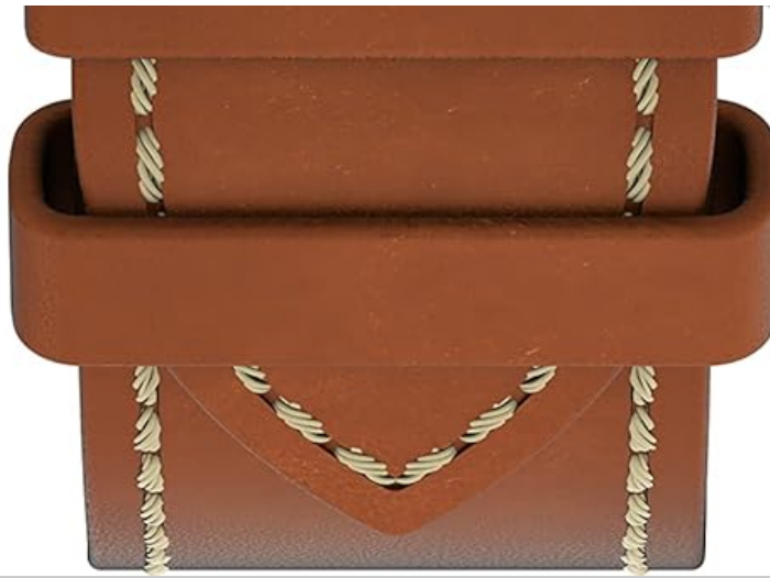
Image: Rear view of the watch, showing the brown leather strap with stitching and the stainless steel buckle mechanism.