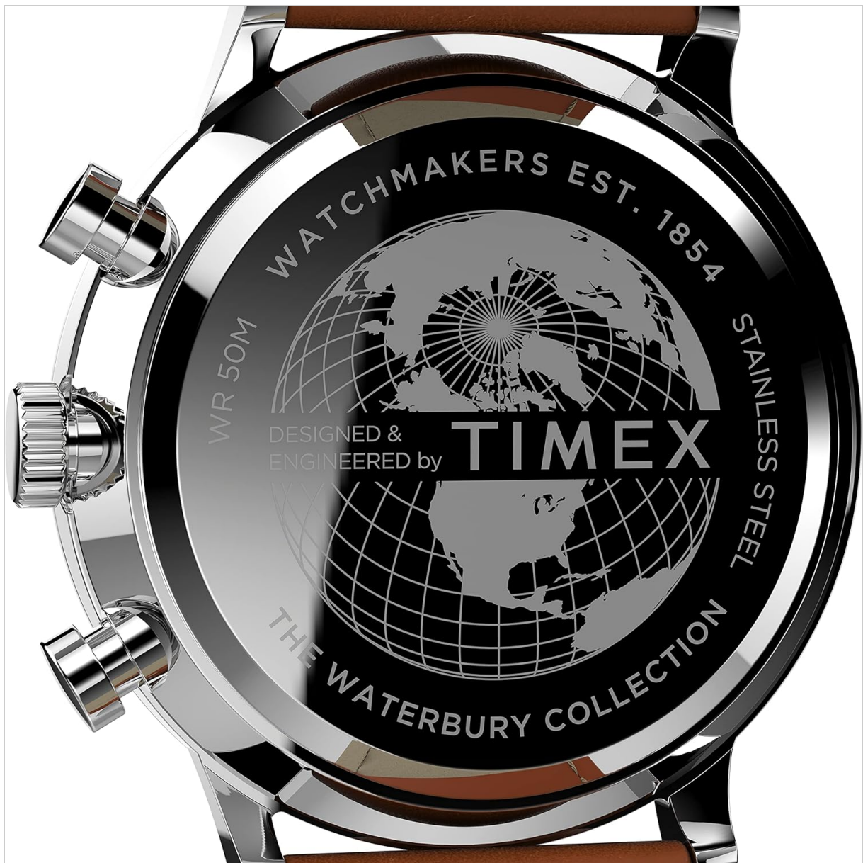
Image: Detailed view of the watch's stainless steel case back, engraved with 'TIMEX', 'WATERBURY COLLECTION', 'WR 50M', and 'STAINLESS STEEL'.