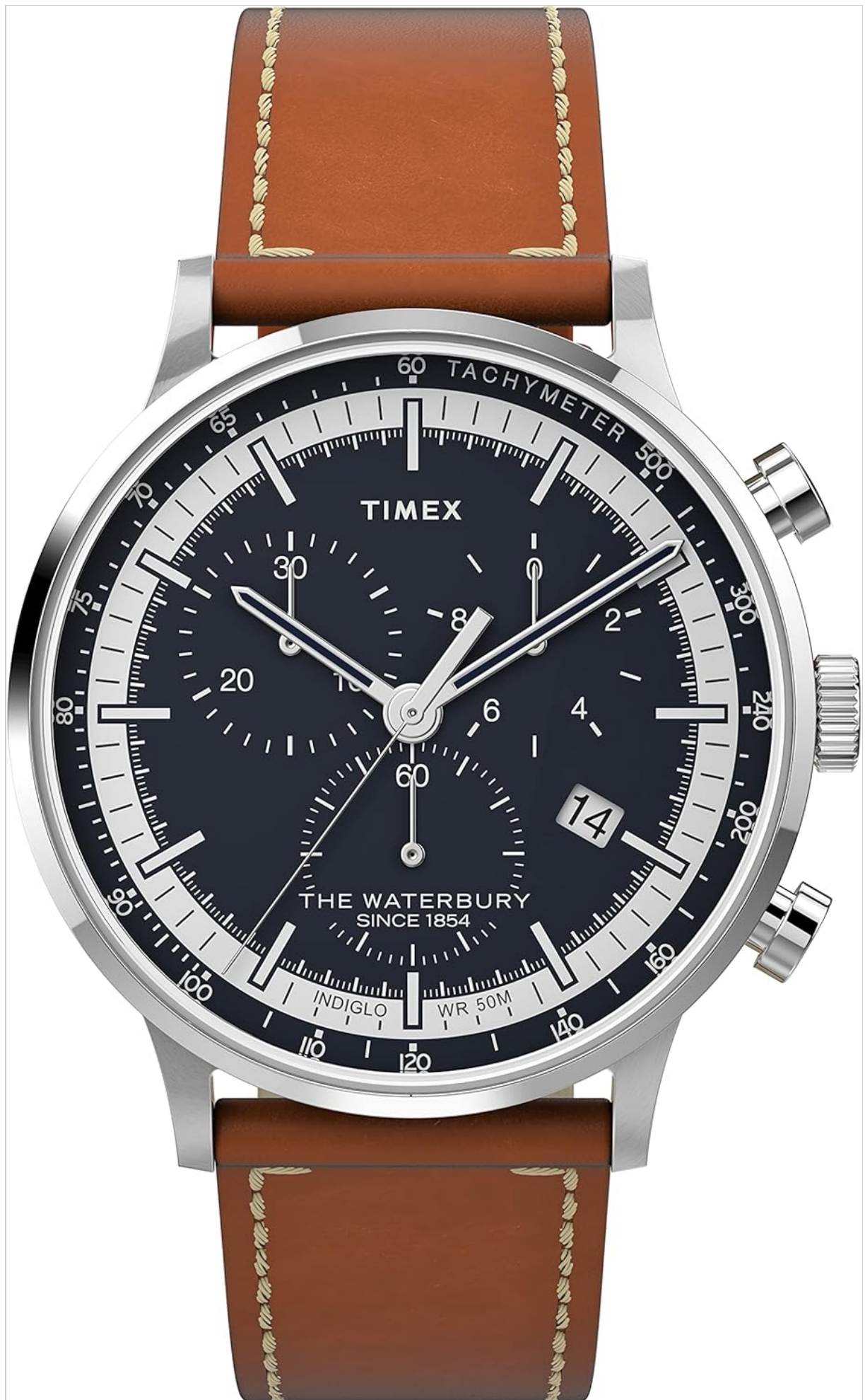
Image: Front view of the Timex Waterbury Classic Chrono watch, showcasing the blue dial, chronograph subdials, and brown leather strap.