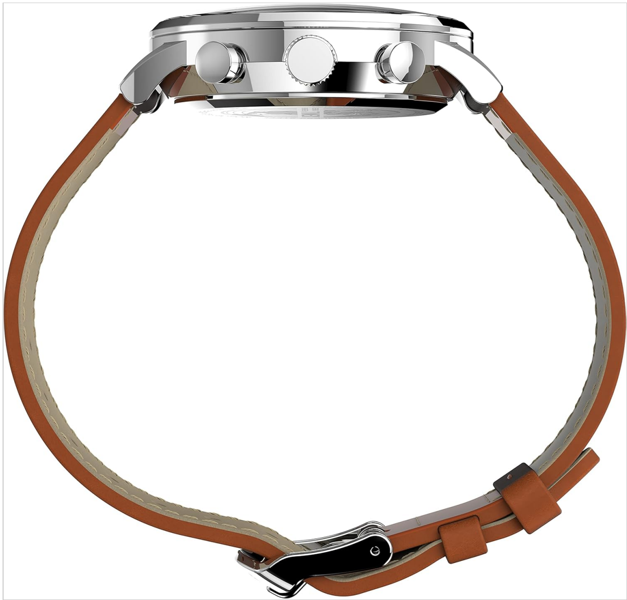
Image: Side profile of the watch case, highlighting the crown and chronograph pushers.