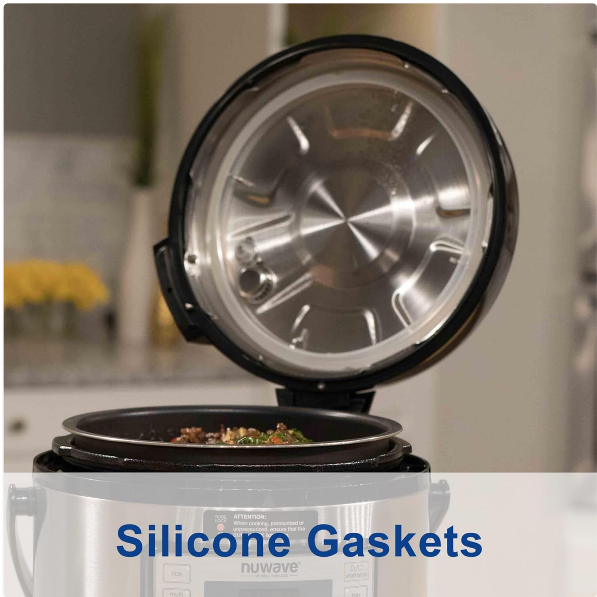
Image: Close-up view of the silicone gaskets positioned within the lid of the Nutri-Pot.