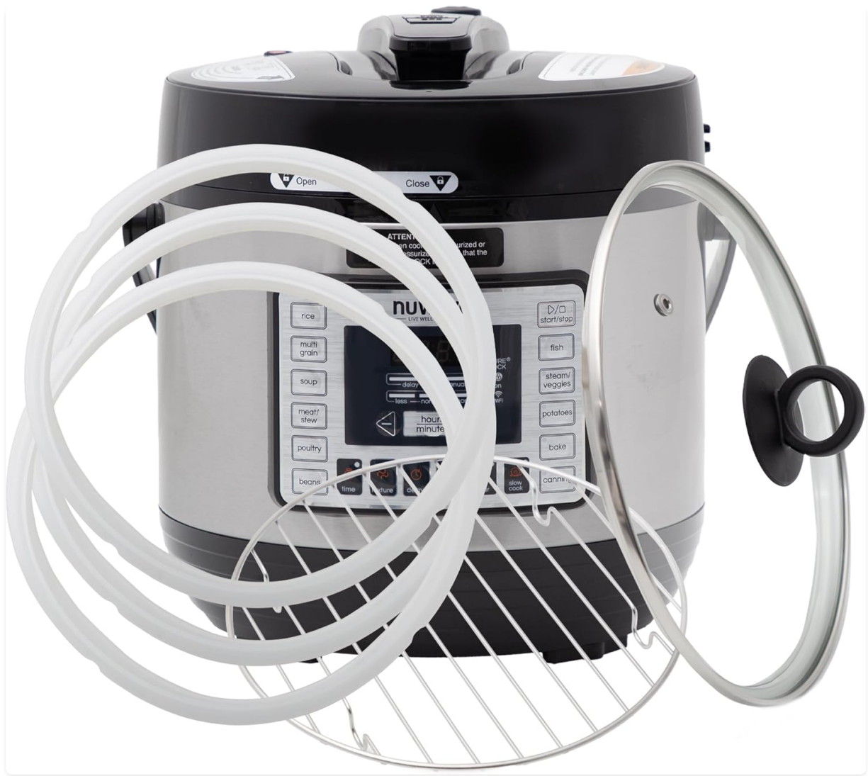
Image: The complete Nuwave Accessory Bundle, showcasing the tempered glass lid, stainless steel cooking rack, and silicone gaskets alongside a Nuwave Nutri-Pot Digital Pressure Cooker.