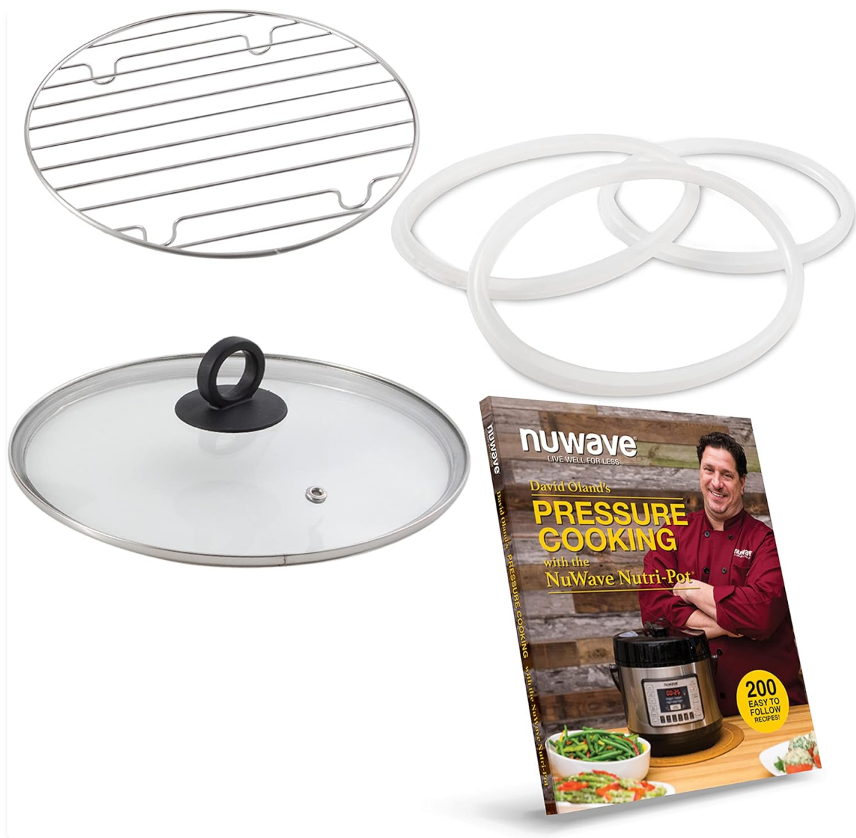
Image: An overhead view of all items included in the accessory bundle: the glass lid, cooking rack, silicone gaskets, and recipe book.