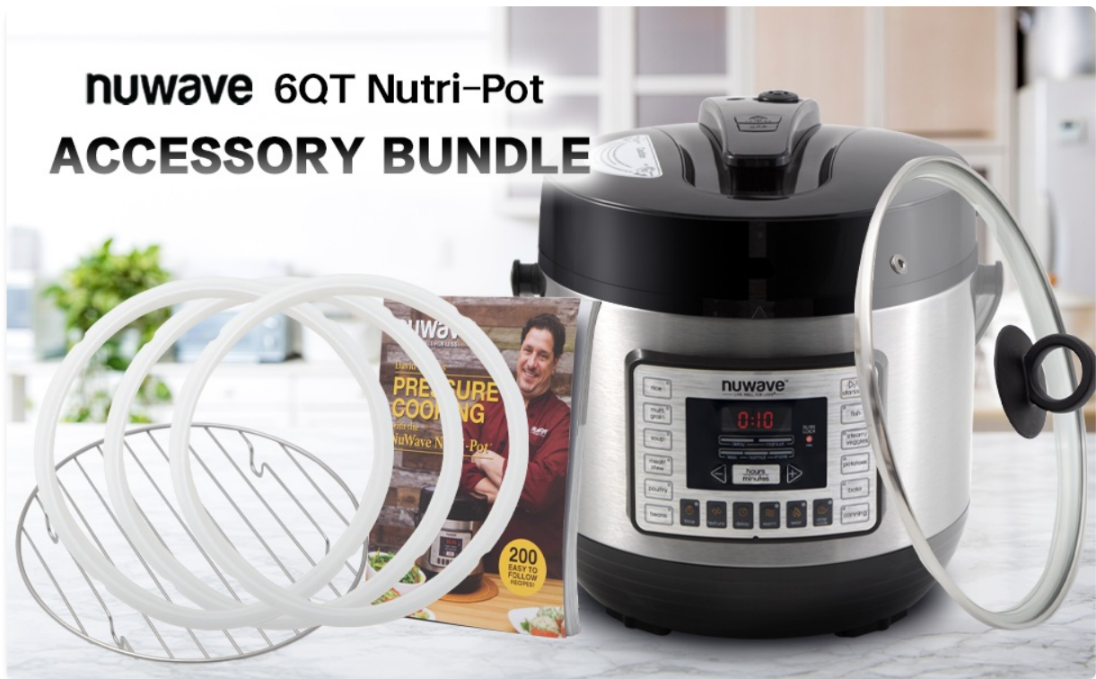
Image: The tempered glass lid in use on the Nutri-Pot, allowing visibility of the cooking process.