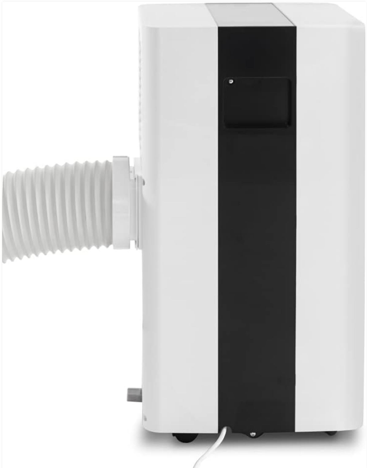
Image 2: Side view of the TROTEC PAC 2600 X showing the exhaust hose connected to the unit. This illustrates how the hot air is expelled from the appliance.

Important Note for First Use: If the unit has been tilted during transport, allow it to stand upright for at least 12 hours before plugging it in and turning it on. This allows the refrigerant fluids to settle, similar to a refrigerator, ensuring proper operation and longevity.