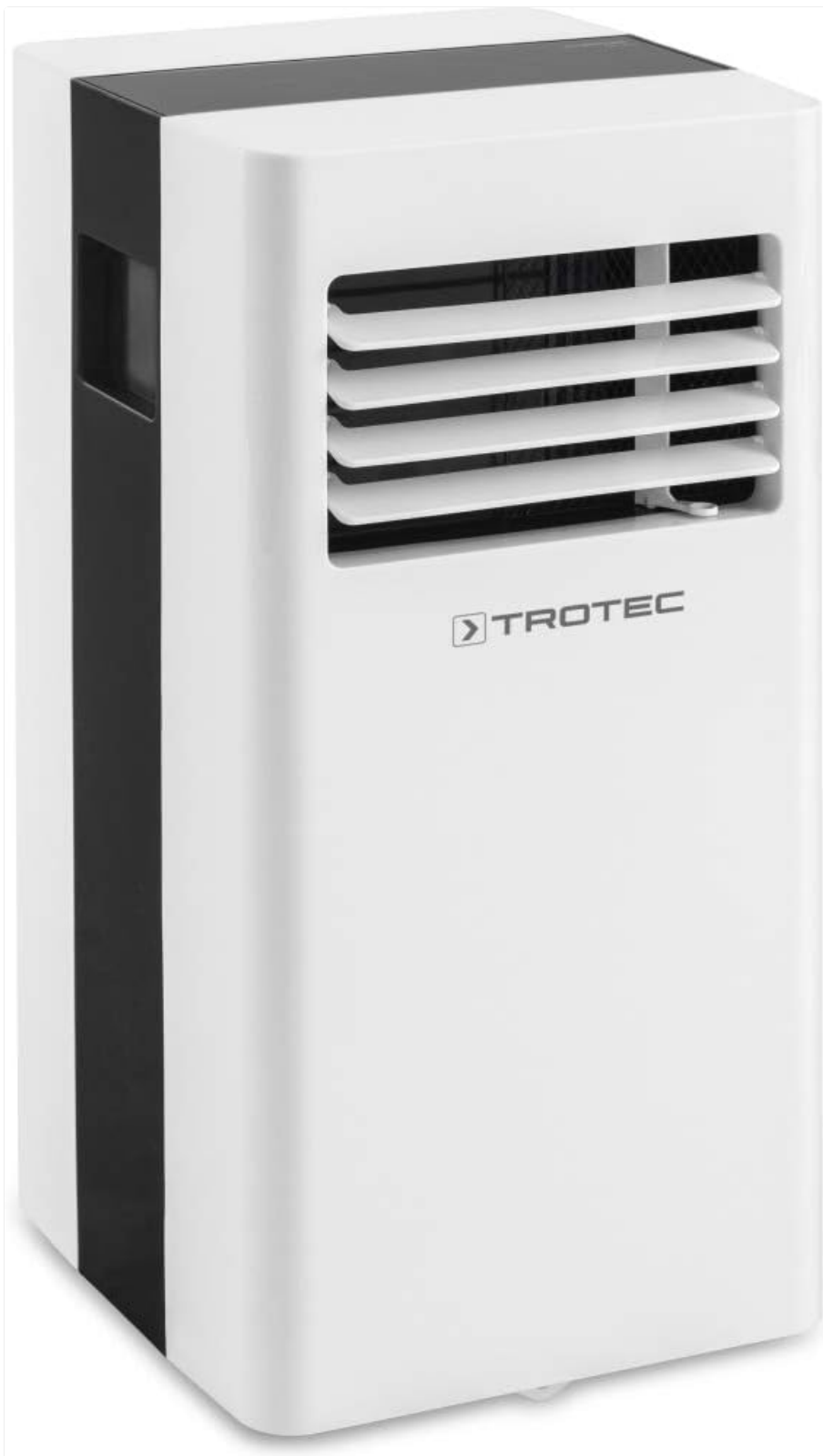
Image 1: Front view of the TROTEC PAC 2600 X Mobile Air Conditioner. This image shows the compact, white unit with black side panels and the front air outlet louvers.