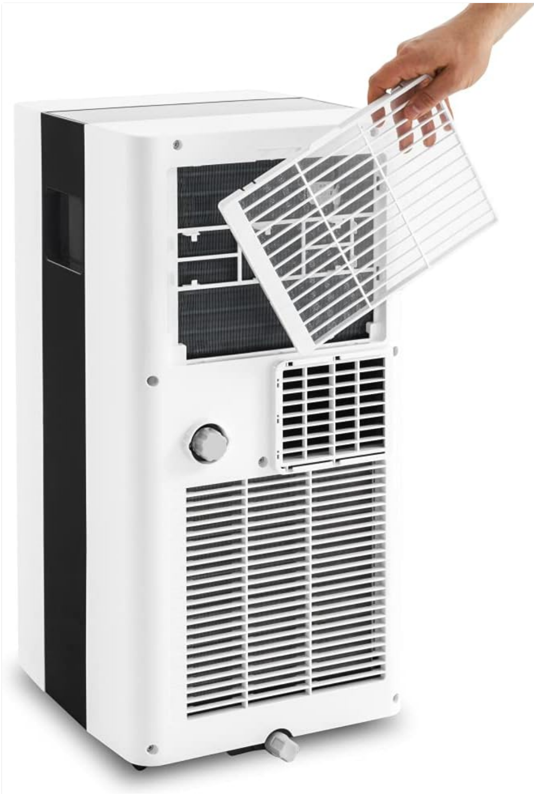
Image 4: A hand demonstrating the removal of the air filter from the back of the TROTEC PAC 2600 X, highlighting the ease of maintenance.