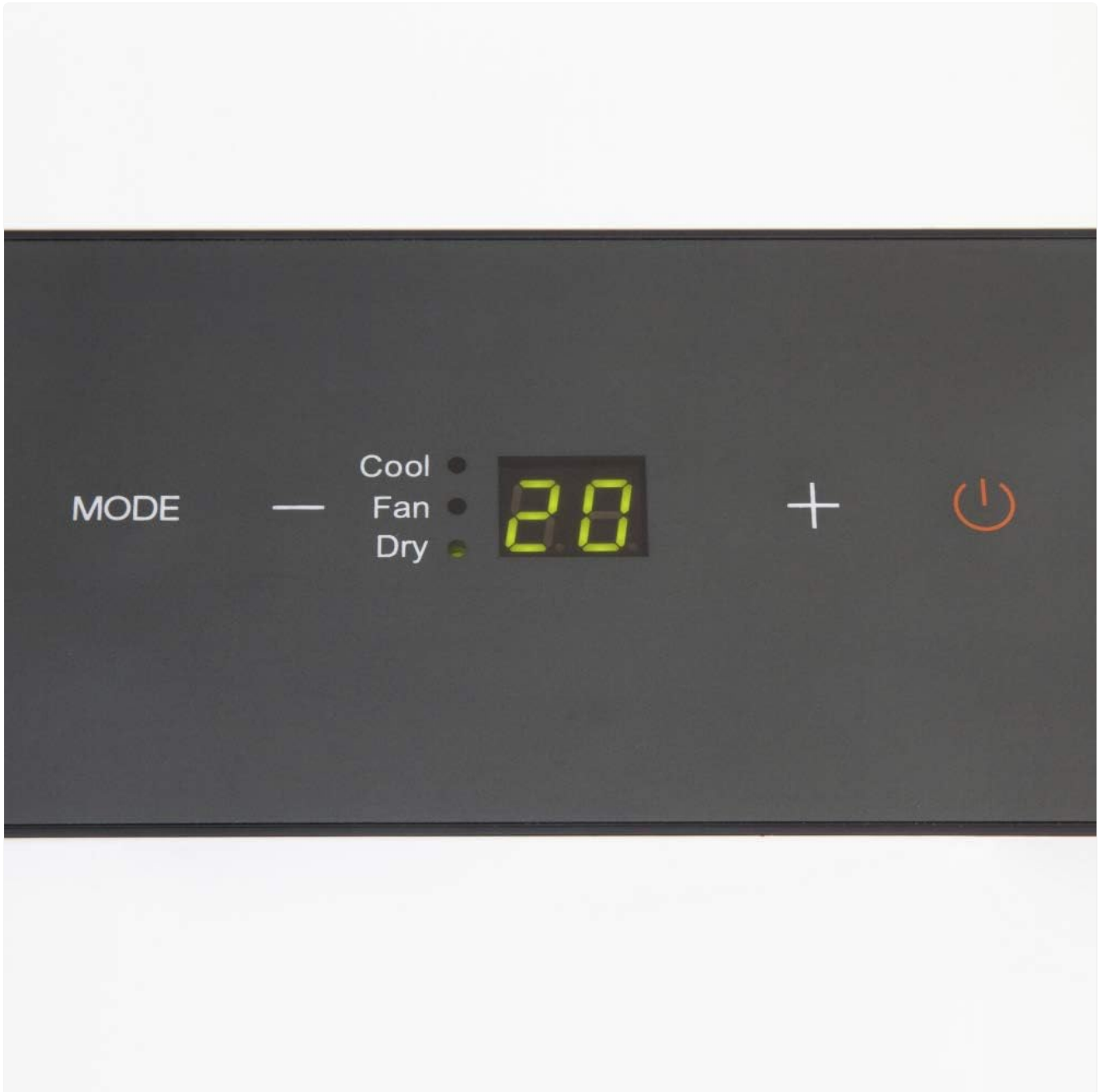
Image 3: Close-up of the TROTEC PAC 2600 X control panel, showing the LED display and touch buttons for Mode, Temperature adjustment, and Power.