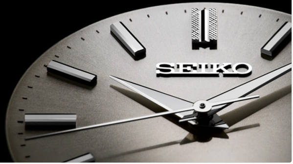
Image: Close-up of the watch dial, illustrating the day/date display.

The story of Seiko began in 1881, when a 21 year old entrepreneur, Kintaro Hattori, opened a shop selling and repairing watches and clocks in central Tokyo. Today, after more than 130 years of innovation, Kintaro Hattori's company is still dedicated to the perfection that the founder always strove to achieve. Seiko is one of the few fully integrated watch manufacturers, designing and developing our own movements using leading-edge technology. Today, Seiko continues its mission to constantly pursue innovation and craft the ideal watch for any need.