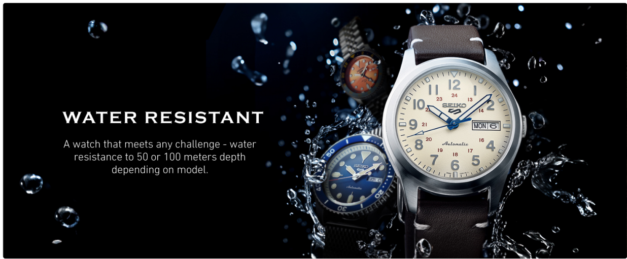
Image: Seiko watches demonstrating water resistance.