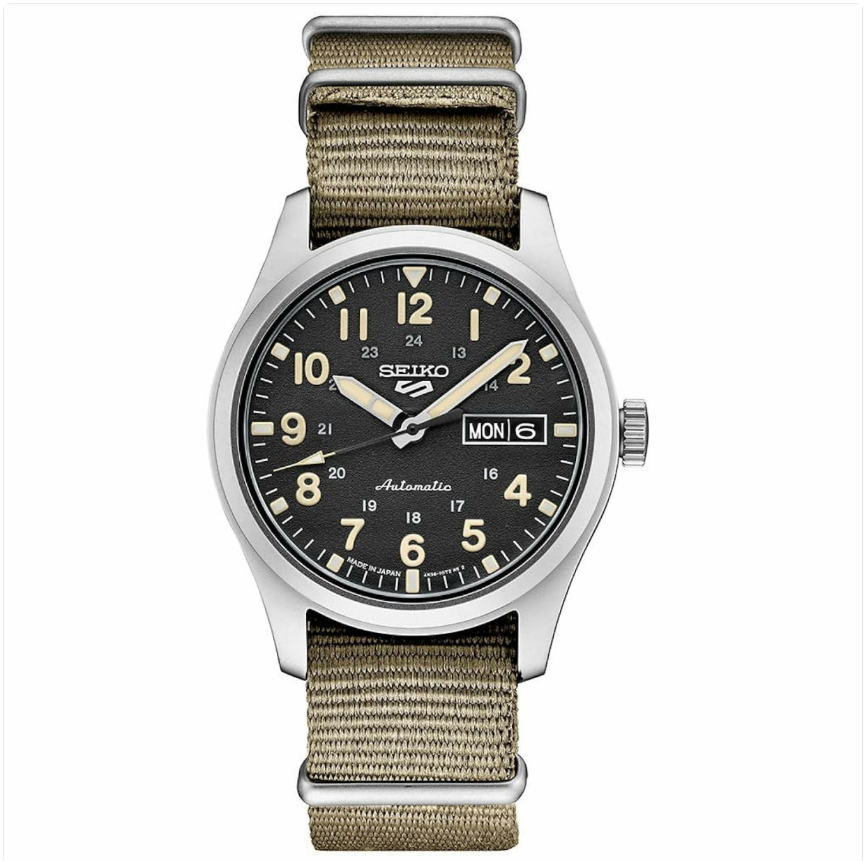
Image: Seiko Men's SRPG35 Automatic Watch, front view.