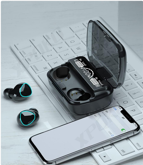
The earbuds and charging case are shown alongside a smartphone displaying its Bluetooth settings, illustrating the pairing process.

The earbuds feature touch controls for various functions.